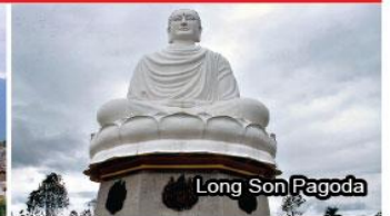
Long Son Pagoda