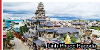
Linh Phuoc Pagoda