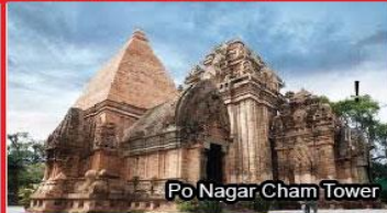
Po Nagar Cham Tower