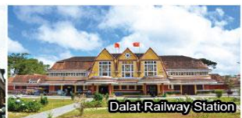
Dalat Railway Station