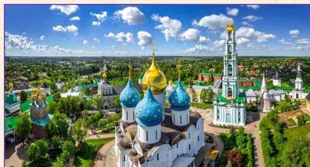
UNESCO World Heritage Site Trinity St. Sergius Monastery in Sergiev Posad

St Petersburg / Moscow High Speed Train (2nd Class Seat / about 4.5 hours) After breakfast, proceed to Vasilevsky Island to visit Rostral Column of Old Sea Port and see the Stock Exchange . Enter to Peter & Paul Fortress build by Peter the Great in the height of Northern War to protect the projected capital from possible Swedish