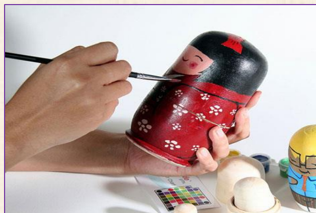
DIY Painting Matryoshka Doll (Do-It-Yourself)