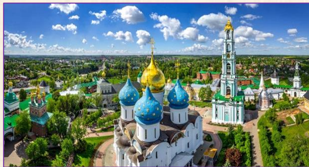
UNESCO 世界文化遗产 谢尔盖圣三一修道院

早餐后，前往瓦西里岛，参观位于老海港口的陶立克式圆柱及欣赏位于瓦西里岛长滩上的证券交易所大楼。进入并游览由彼得大帝于北方大战高峰时期所建立以保护该地区免受瑞典可能性攻击的彼得保罗要塞。参观令人印象深刻的彼得保罗大教堂 - 所有俄罗斯皇帝和后