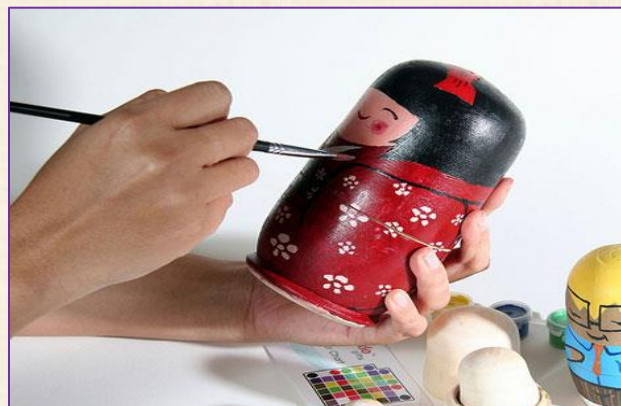
DIY Painting Matryoshka Doll (Do-It-Yourself)