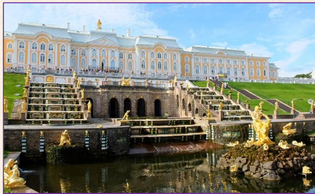
Grand Palace of Peterhof