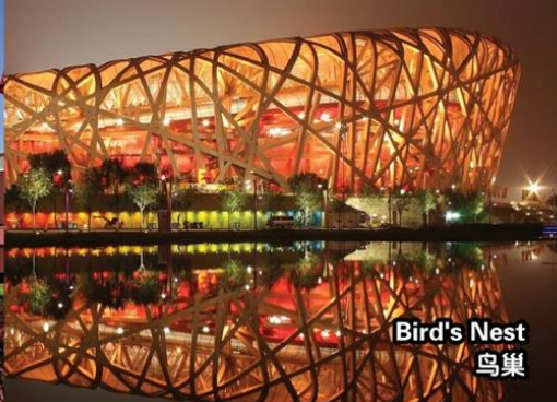
Bird's Nest 鸟巢