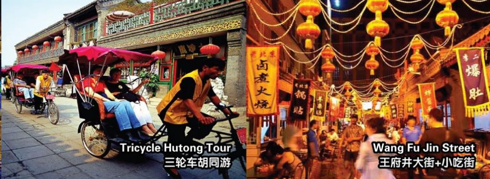
Tricycle Hutong Tour 三轮车胡同游