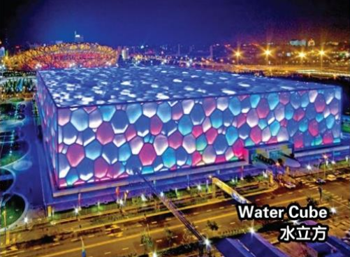
Water Cube 水立方