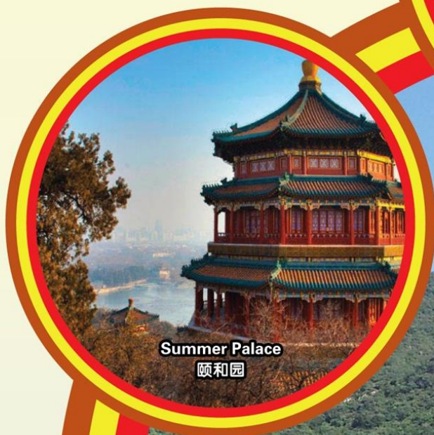
Summer Palace 颐和园