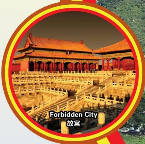
Forbidden City 故宫