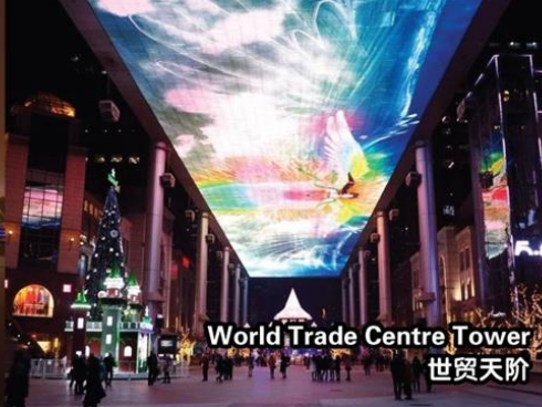
World Trade Centre Tower 世贸天阶