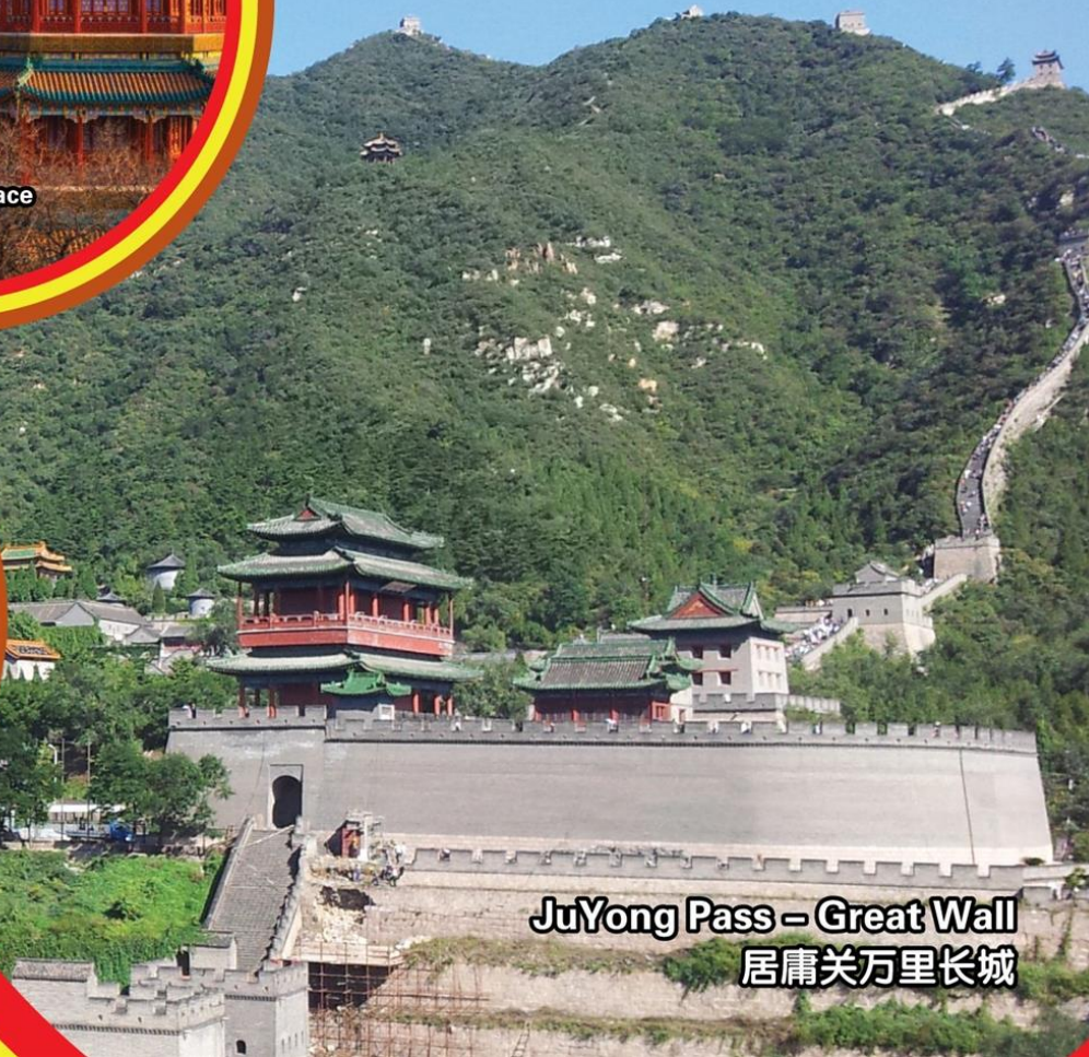
JuYong Pass – Great Wall 居庸关万里长城

行程次序，以当地旅社安排为准。 Sequences of Itinerary are subject to local arrangement.