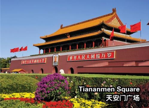
Tiananmen Square 天安门广场