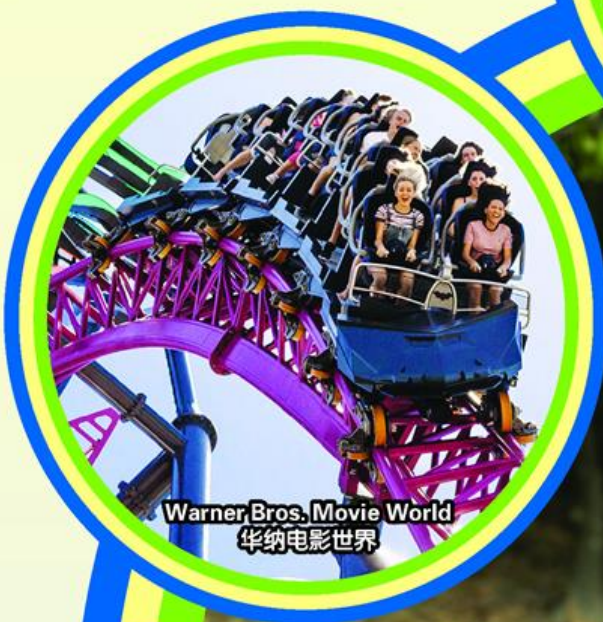
Warner Bros. Movie World 华纳电影世界