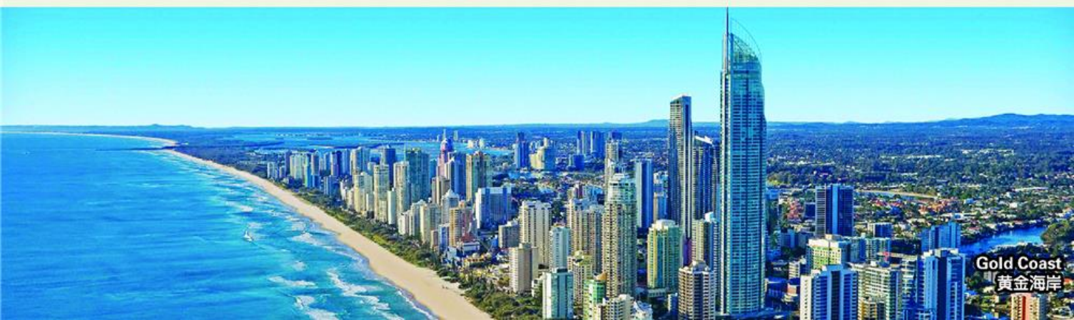
Gold Coast 黄金海岸