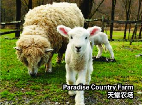
Paradise Country Farm 天堂农场