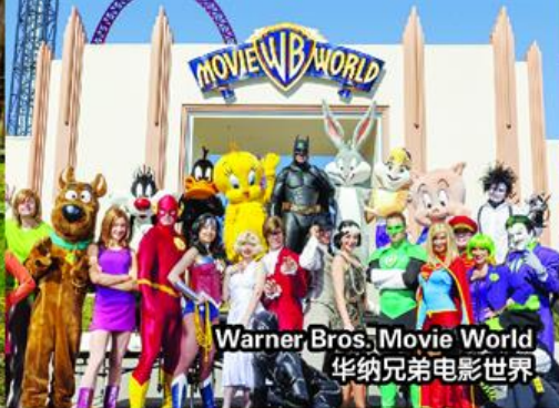
Warner Bros. Movie World 华纳兄弟电影世界