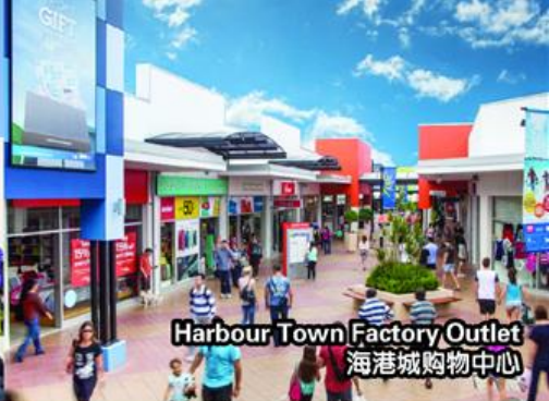
Harbour Town Factory Outlet 海港城购物中心