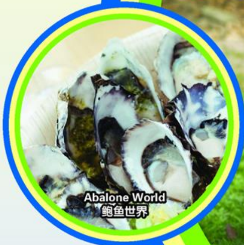
Abalone World 鲍鱼世界