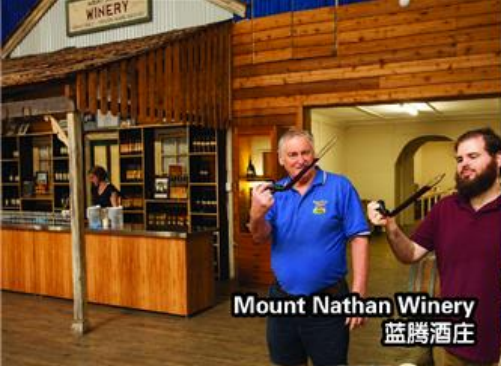
Mount Nathan Winery 蓝腾酒庄