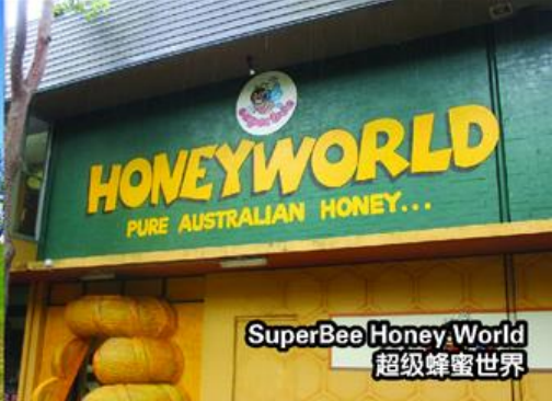
SuperBee Honey World 超级蜂蜜世界