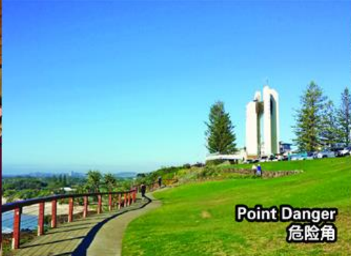
Point Danger 危险角