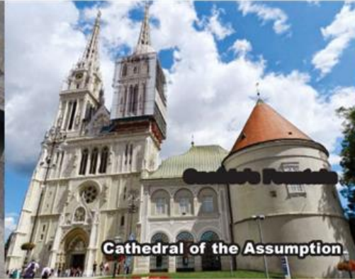
Cathedral of the Assumption