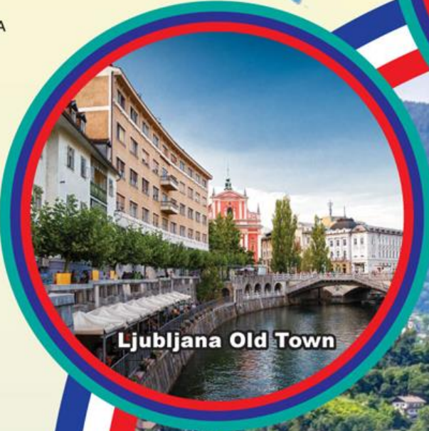
Ljubljana Old Town