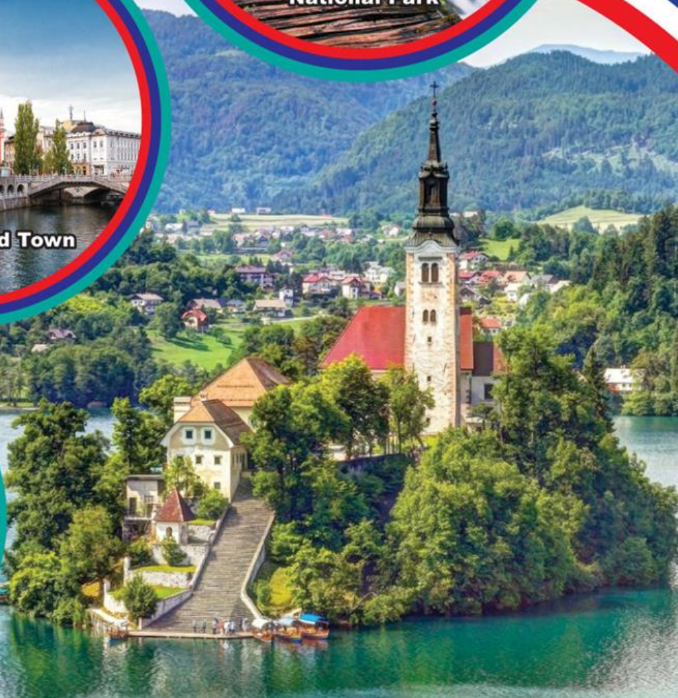
St. Mary's Church