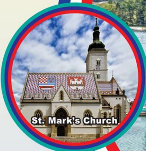
St. Mark's Church