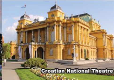
Croatian National Theatre