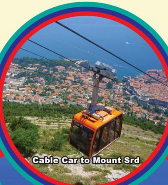
Cable Car to Mount Srd