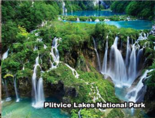
Plitvice Lakes National Park