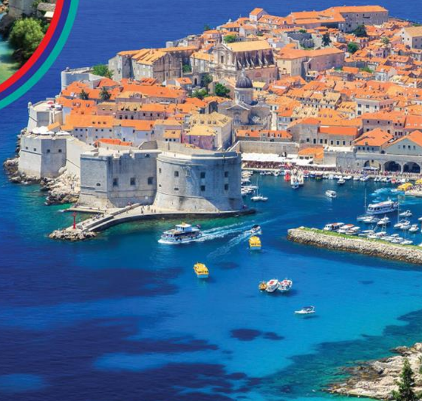
Dubrovnik's Ancient City Wall