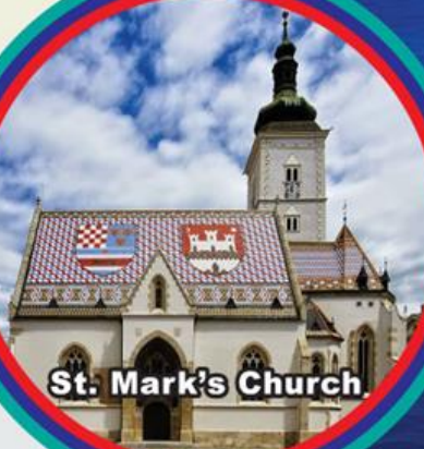
St. Mark's Church