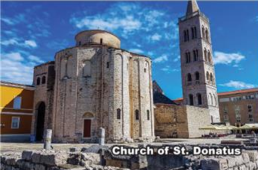
Church of St. Donatus