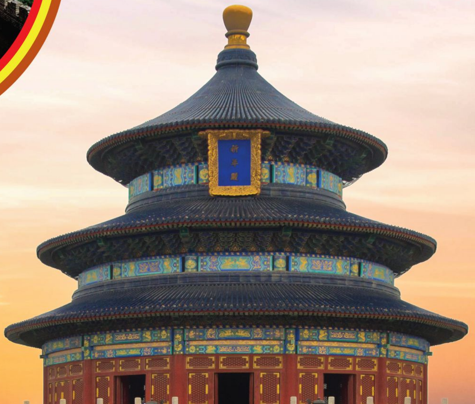
Temple of Heaven 天坛

行程次序，以当地旅社安排为准。 Sequences of Itinerary are subject to local arrangement.