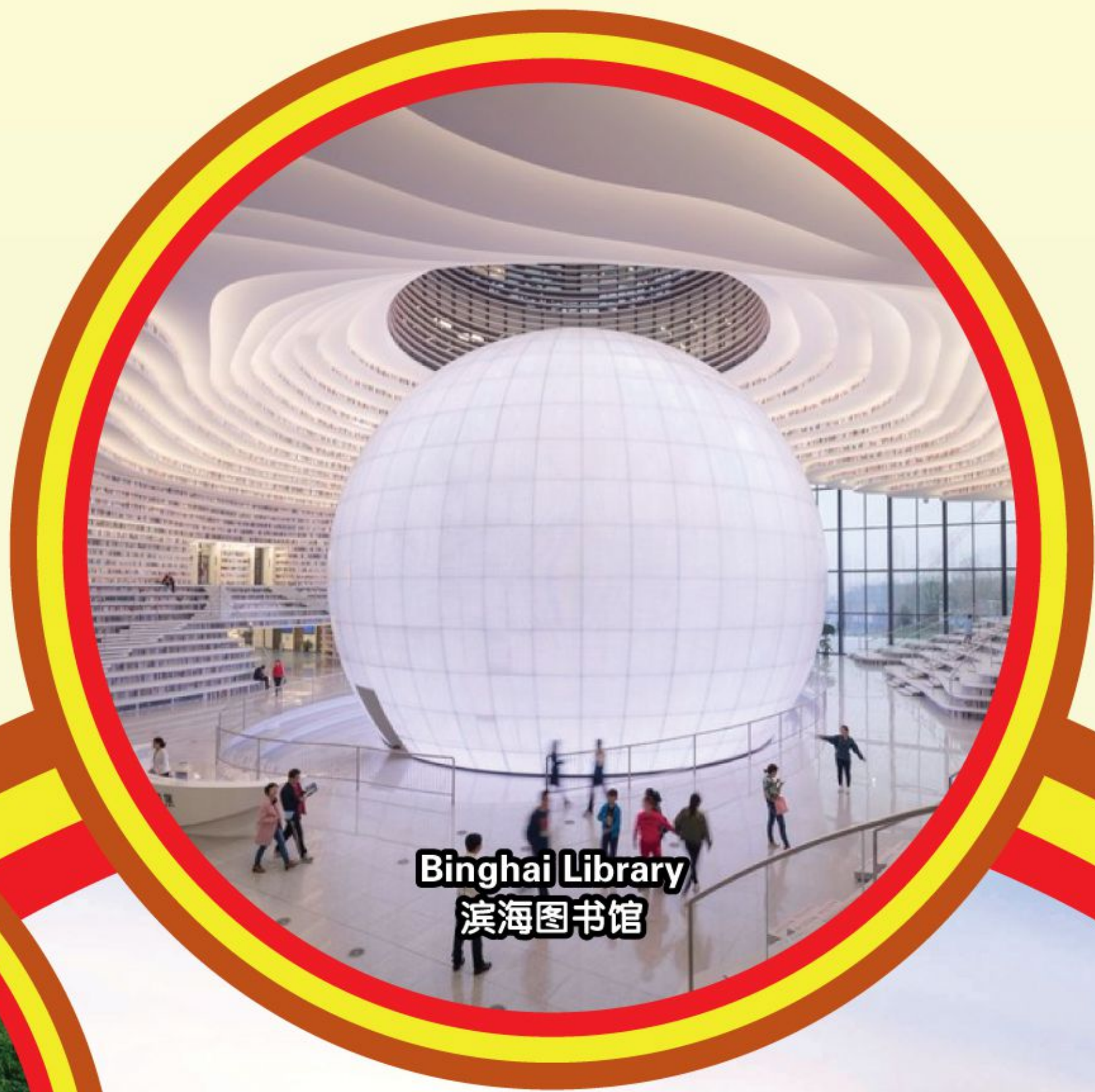
Binghai Library 滨海图书馆