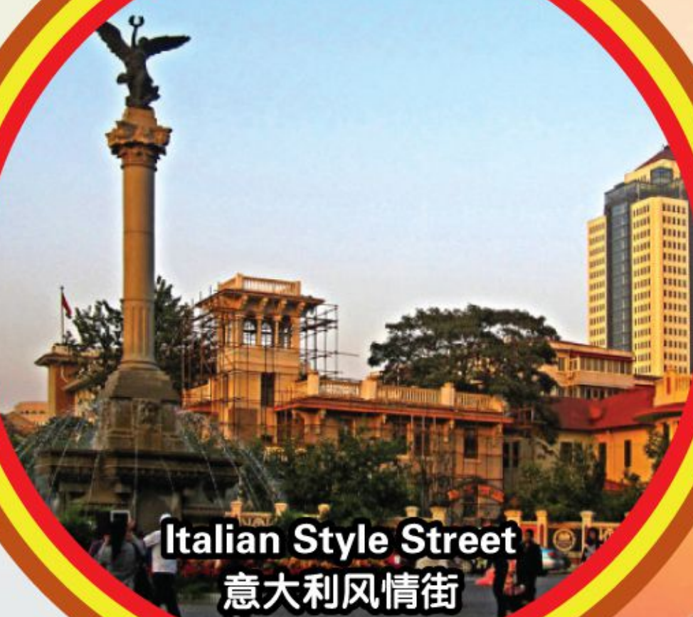
Italian Style Street 意大利风情街