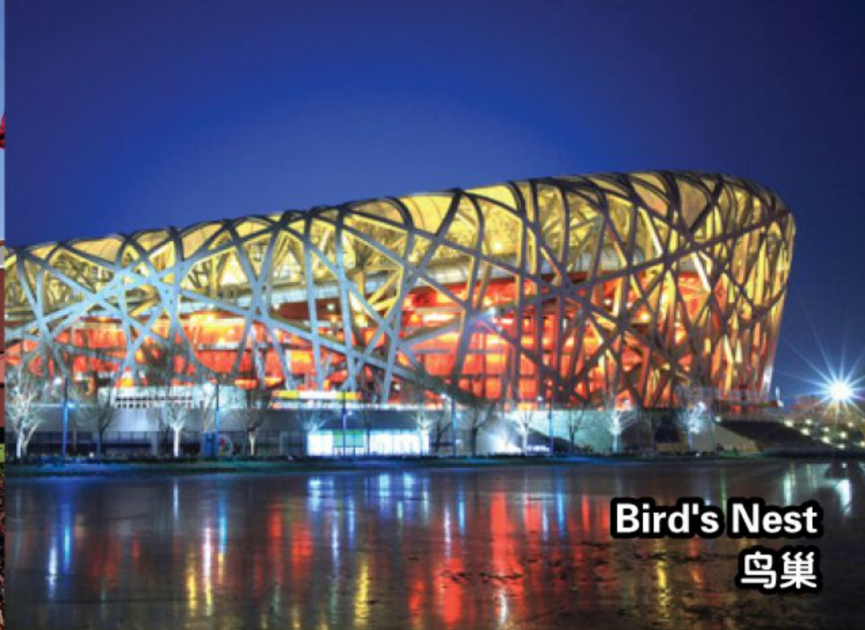
Bird's Nest 鸟巢