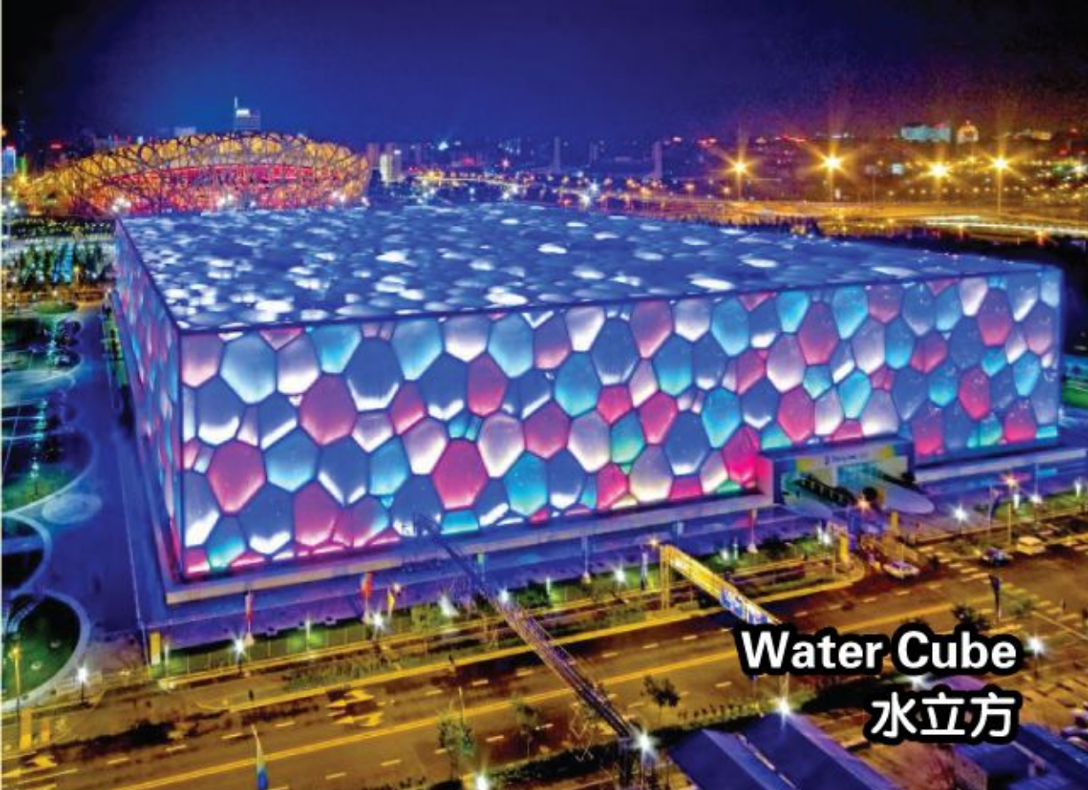
Water Cube 水立方