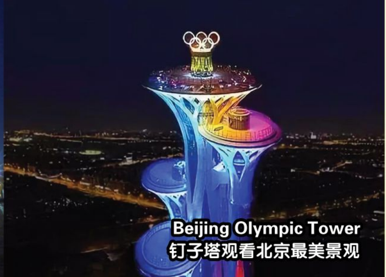
Beijing Olympic Tower 钉子塔观看北京最美景观