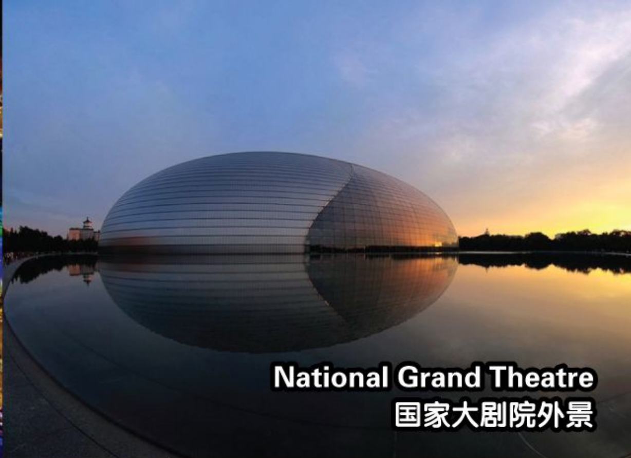
National Grand Theatre 国家大剧院外景