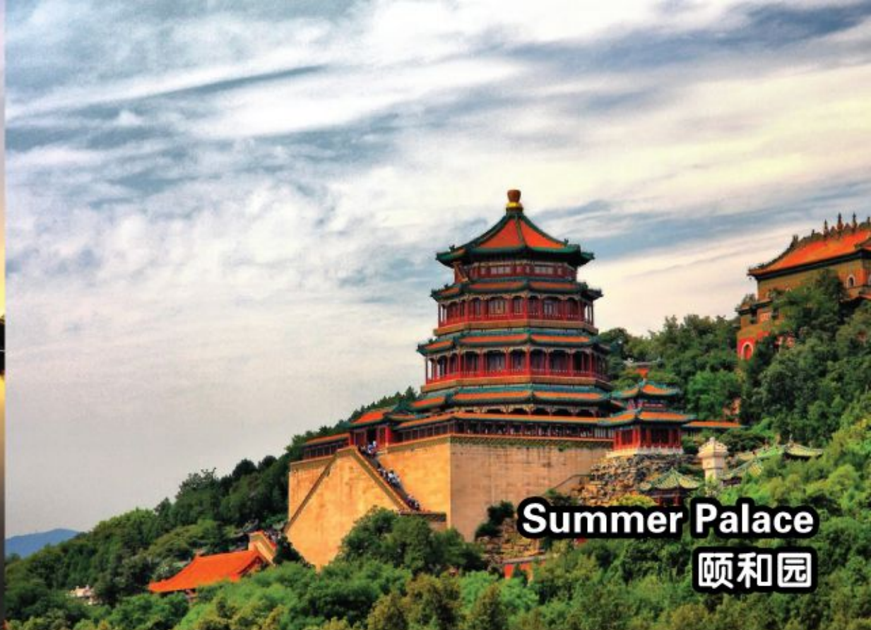
Summer Palace 颐和园