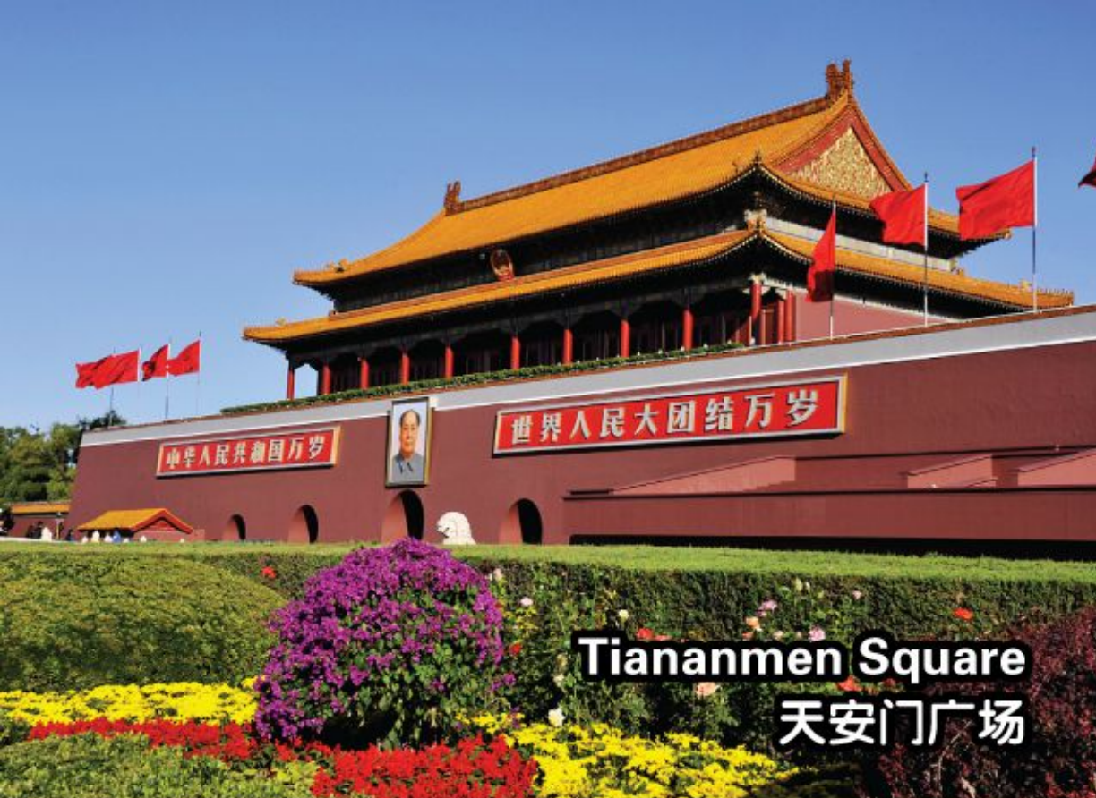
Tiananmen Square 天安门广场