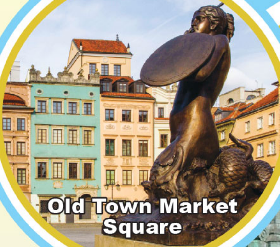
Old Town Market Square