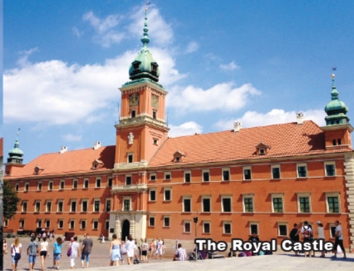
The Royal Castle