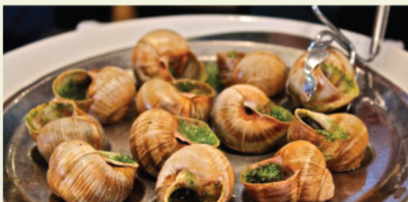
French Cuisine with Escargot