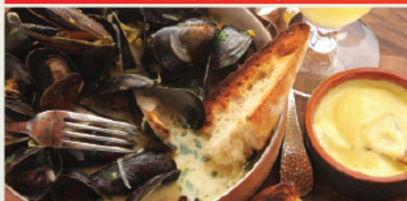
布鲁塞尔 - 青口贝