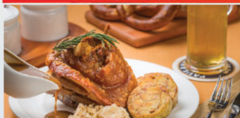
滴滴湖 - 德国烤猪脚