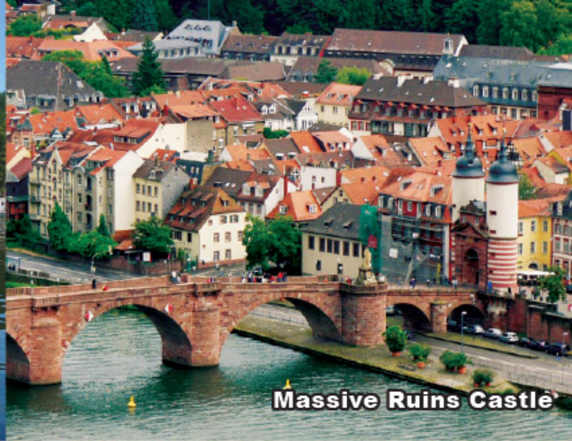
Massive Ruins Castle