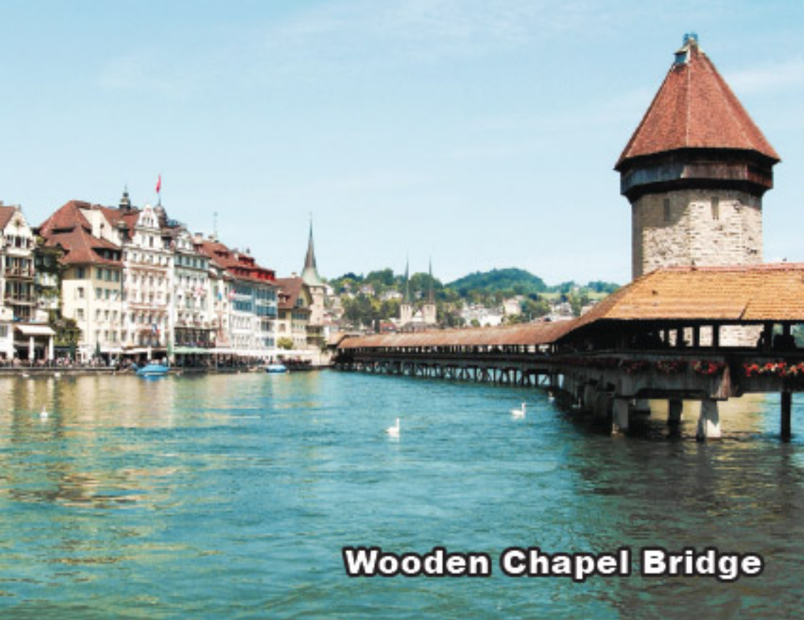
Wooden Chapel Bridge