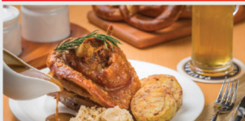
German Lunch with Pork Knuckle