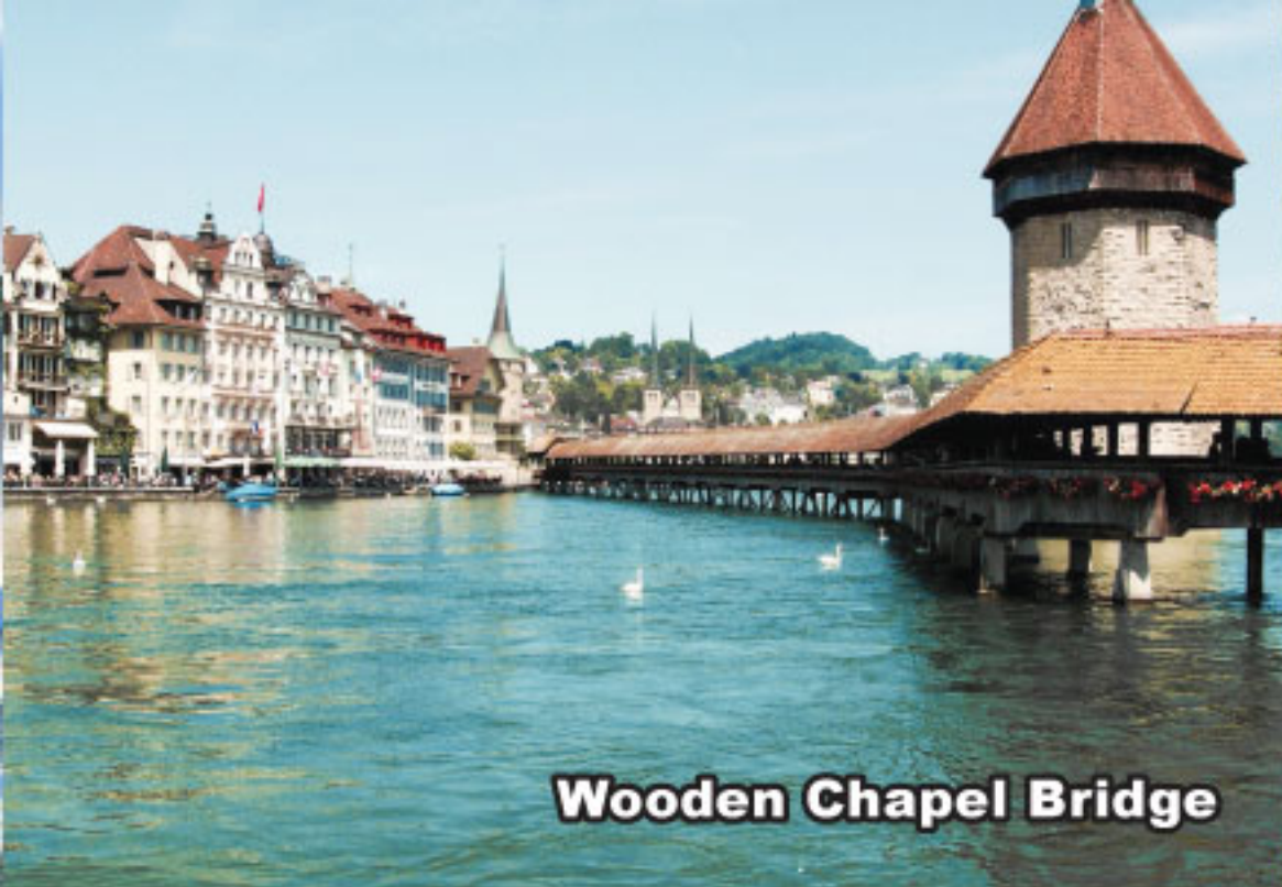
Wooden Chapel Bridge