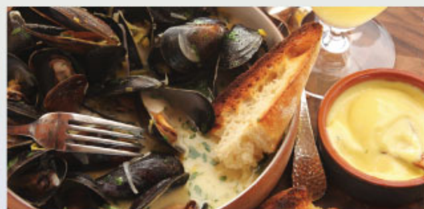
3道菜-布鲁塞尔 - 青口贝