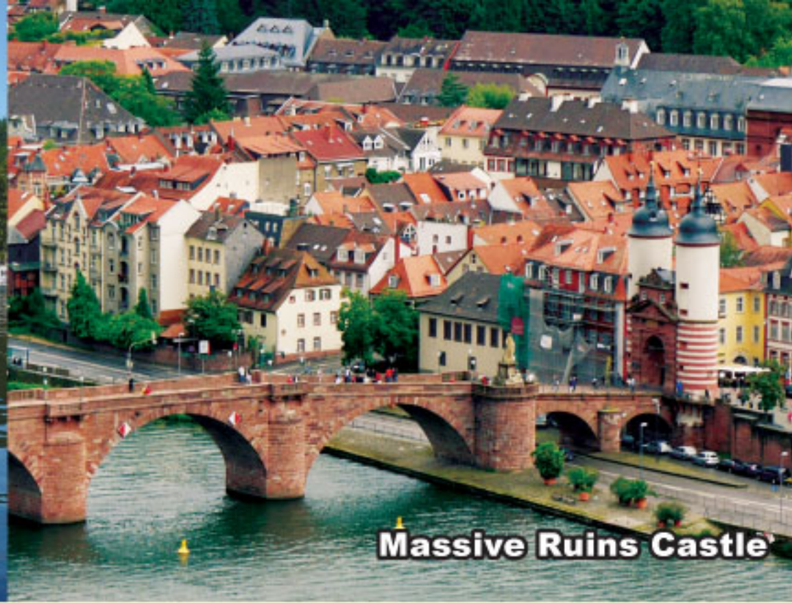
Massive Ruins Castle