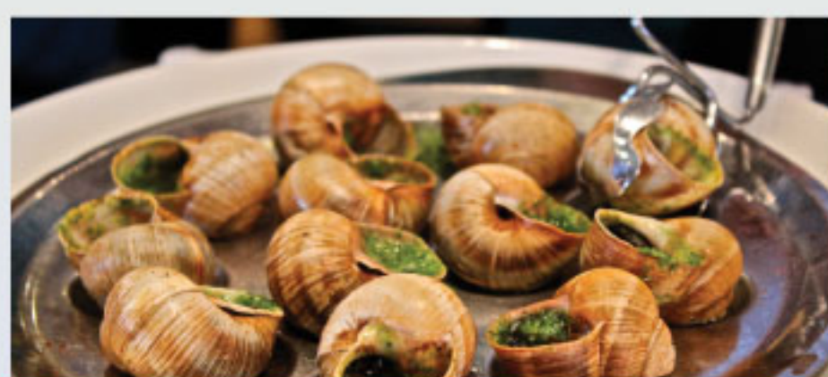
3 Course Meal –French Cuisine with Escargot