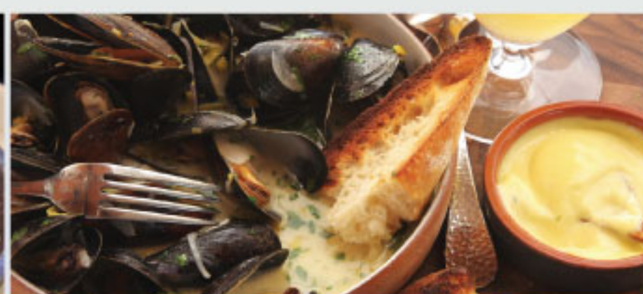
3 Course Meal –Mussels Meals