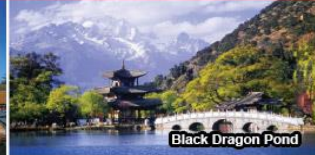
Black Dragon Pond