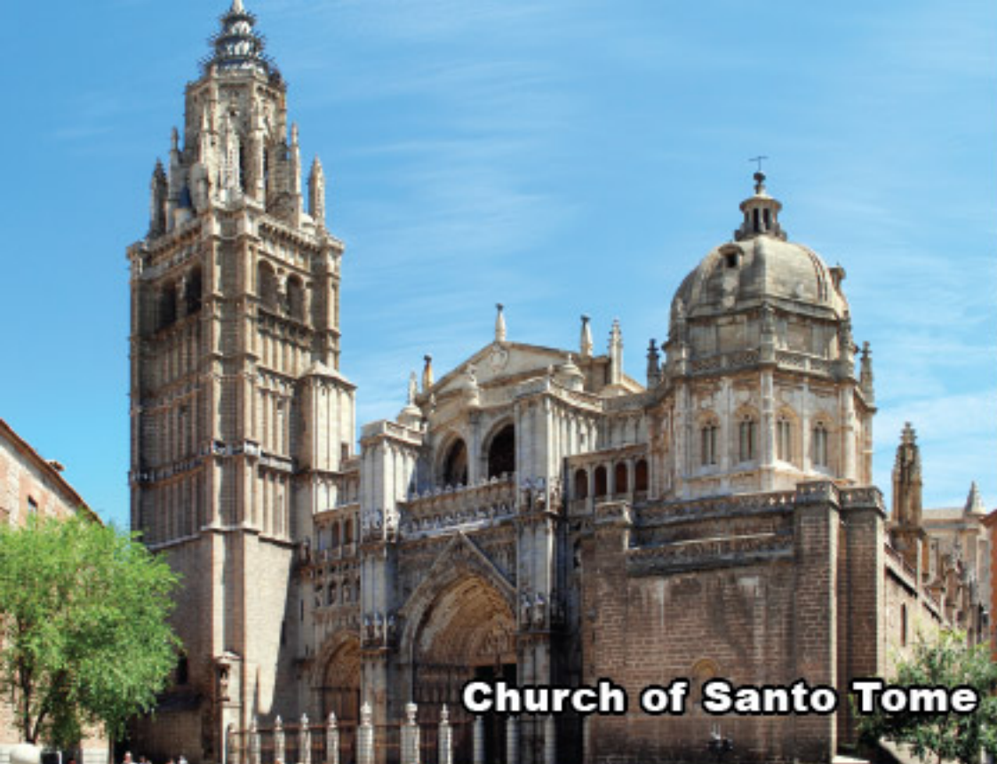
Church of Santo Tome