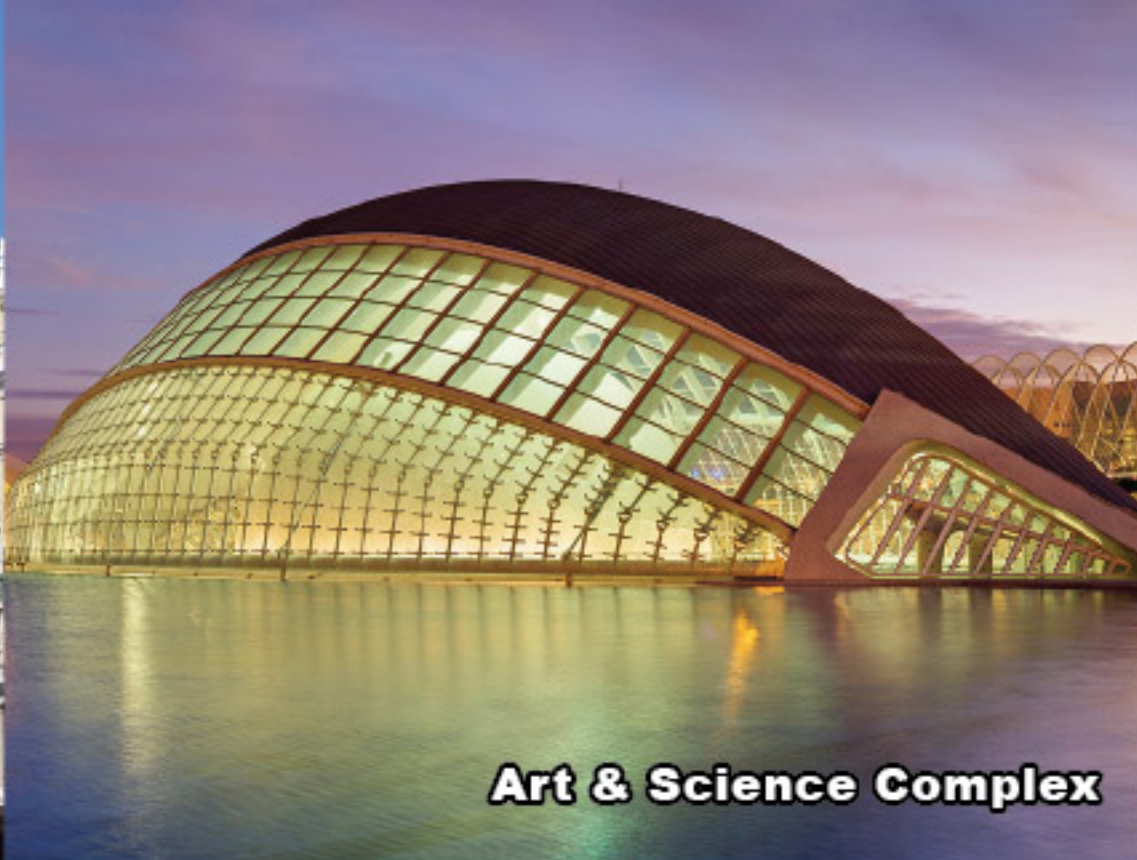
Art & Science Complex