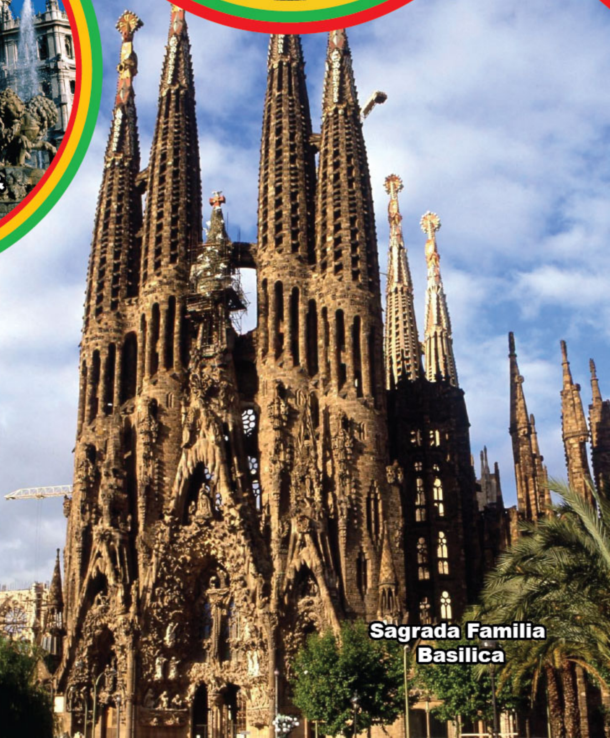
Sagrada Familia Basilica