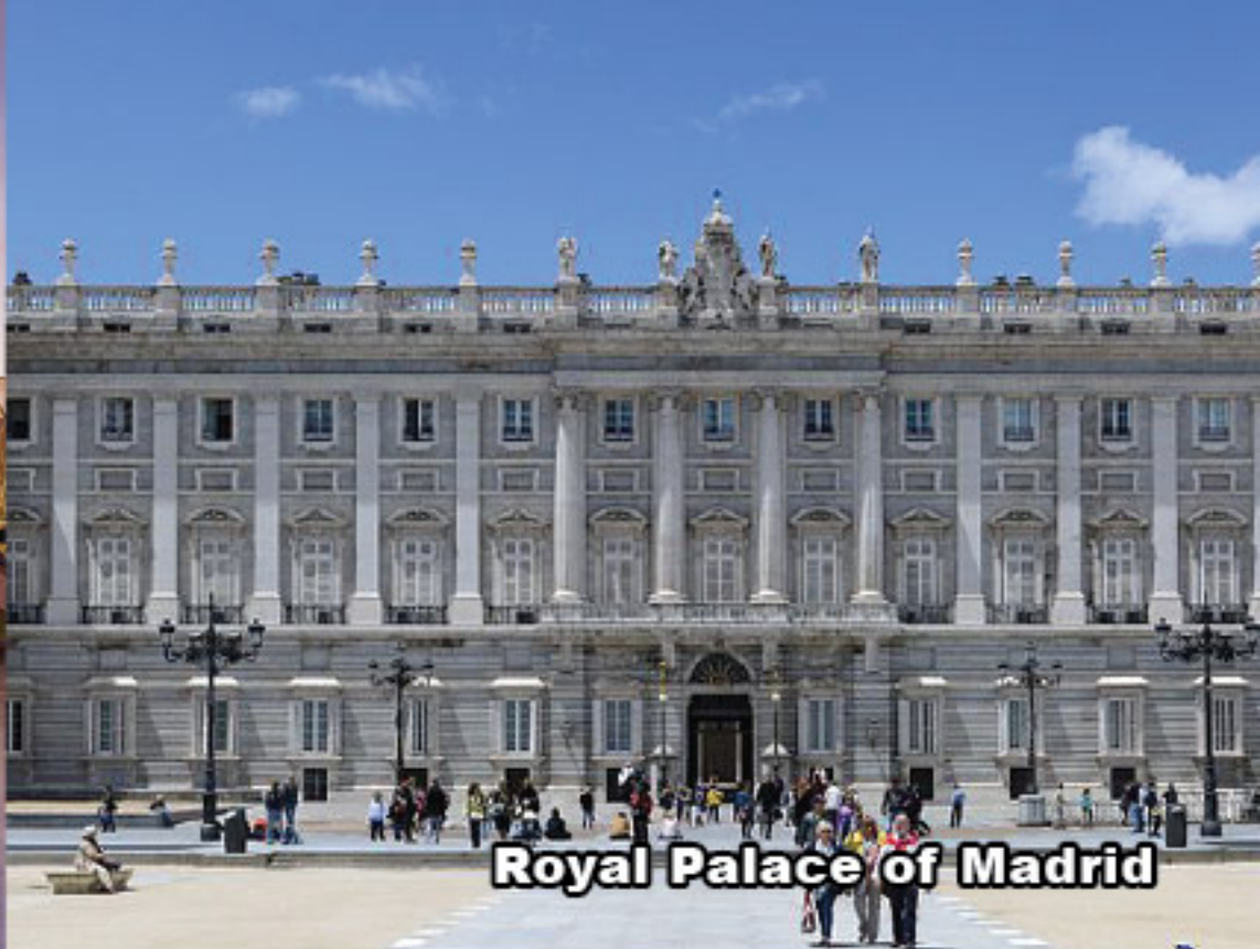
Royal Palace of Madrid

D8 BARCELONA – KUALA LUMPUR (14H++) (B/MOB)