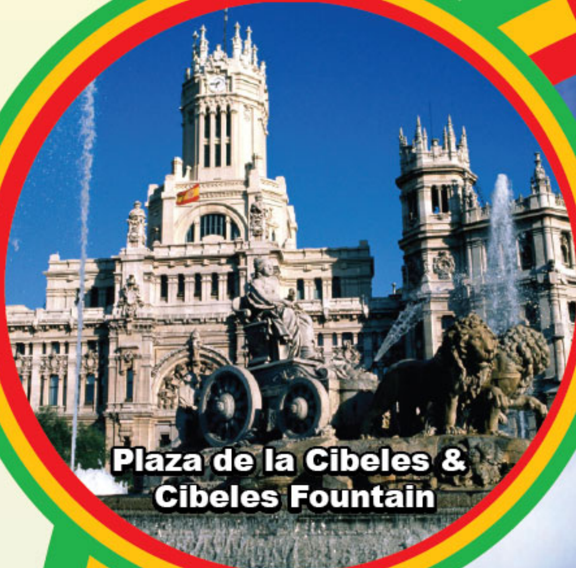
Plaza de la Cibeles & Cibeles Fountain