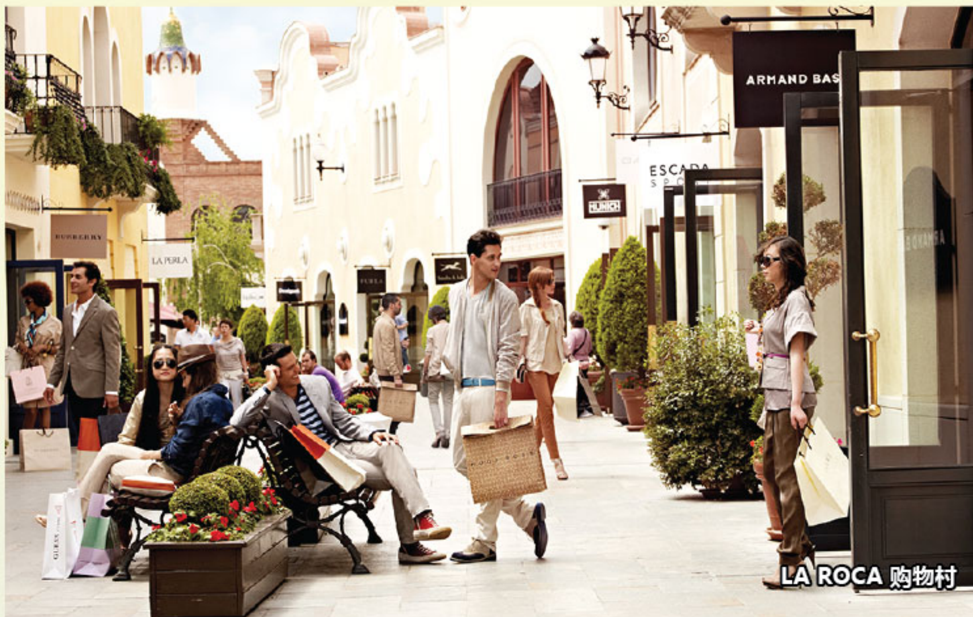
LA ROCA 购物村