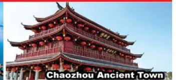
Chaozhou Ancient Town