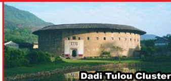
Dadi Tulou Cluster