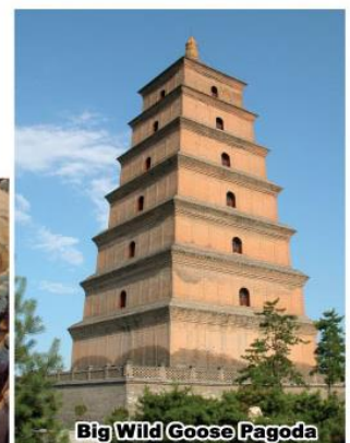
Big Wild Goose Pagoda

Optional Tour : Tang Dynasty Performance + Datang City Night view + Daming Palace National Heritage Park (include Buggy car & IMAX 3D movies Daming Palace Legend) [ RMB 400/Person]