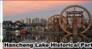
Hancheng Lake Historical Park