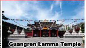
Guangren Lamma Temple