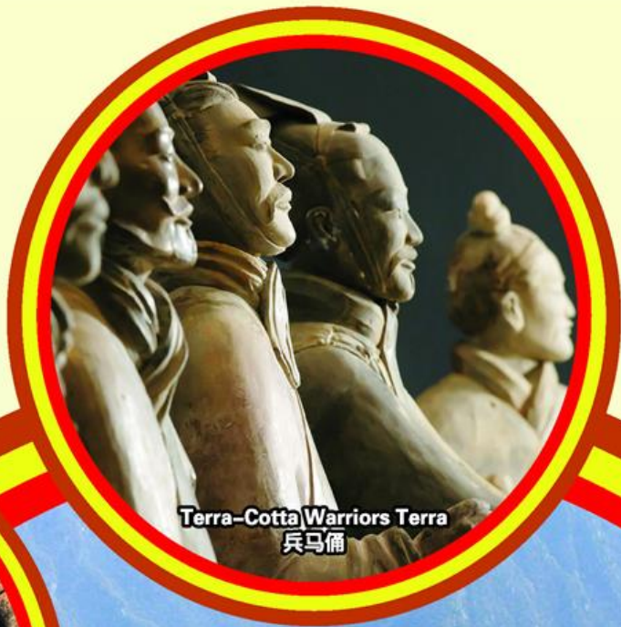
Terra-Cotta Warriors 兵马俑