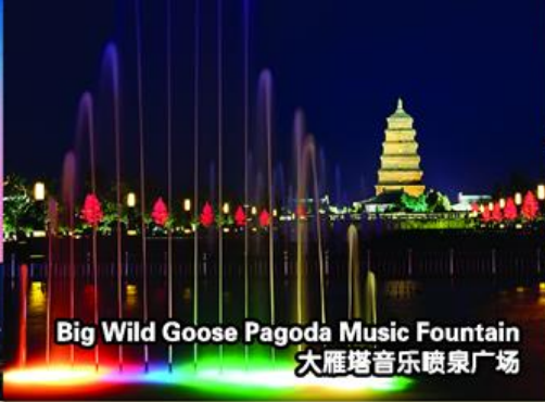
Big Wild Goose Pagoda Music Fountain 大雁塔音乐喷泉广场