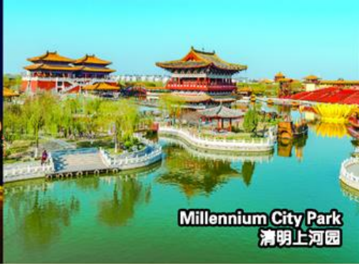
Millennium City Park 清明上河园