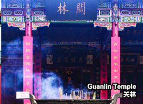
Guanlin Temple 关林