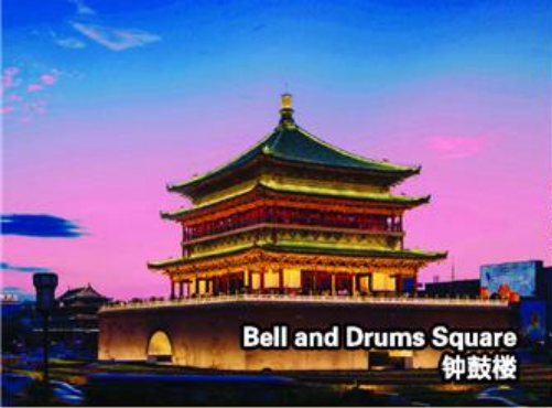
Bell and Drums Square 钟鼓楼