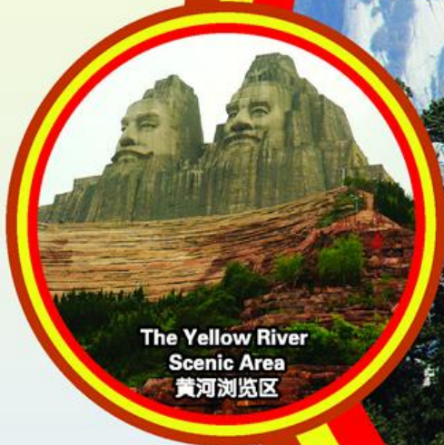
The Yellow River Scenic Area 黄河浏览区

行程次序·以当地旅社安排为准。 Sequences of Itinerary are subject to local arrangement.