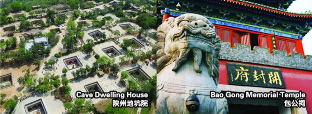
Cave Dwelling House 陕州地坑院