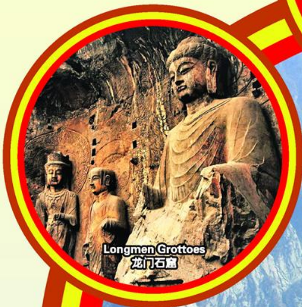
Longmen Grottoes 龙门石窟