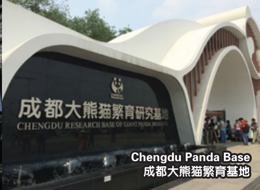
Chengdu Panda Base 成都大熊猫繁育基地