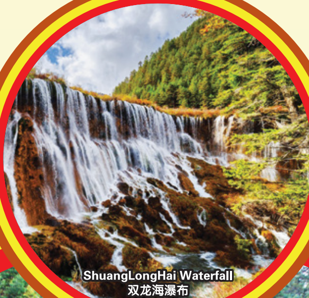
ShuangLongHai Waterfall 双龙海瀑布