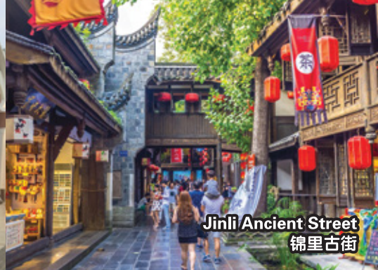
Jinli Ancient Street 锦里古街