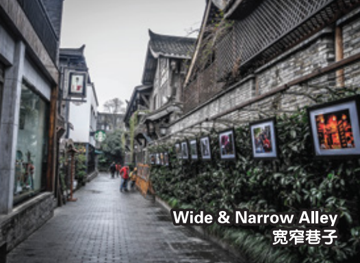
Wide & Narrow Alley 宽窄巷子