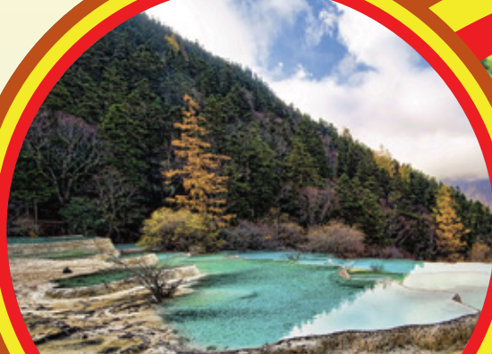
HuangLong Scenic Area 黄龙风景区