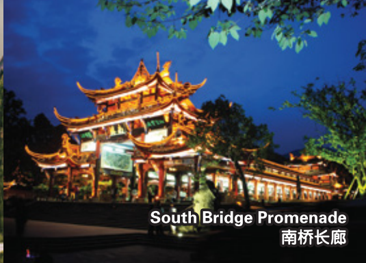
South Bridge Promenade 南桥长廊