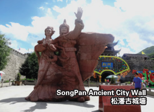
SongPan Ancient City Wall 松潘古城墙