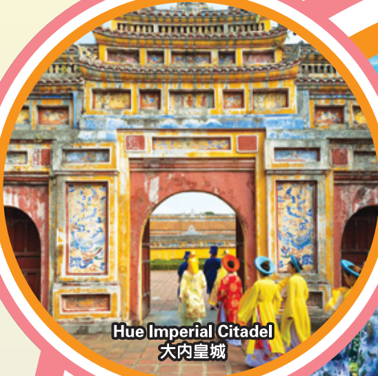
Hue Imperial Citadel 大内皇城

FREE 赠送: Experience Basket Boats @ Hoi an 竹篮船体验