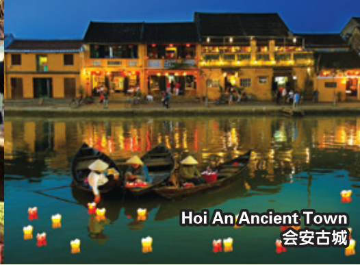
Hoi An/Ancient Town 会安古城