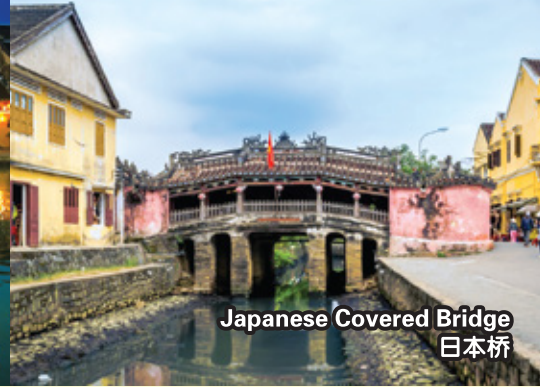
Japanese Covered Bridge 日本桥