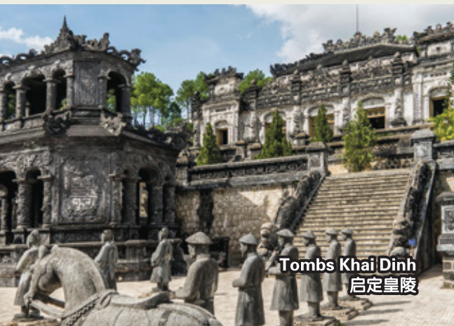
Tombs Khai Dinh 启定皇陵