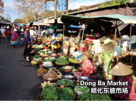
Dong Ba Market 顺化东坡市场