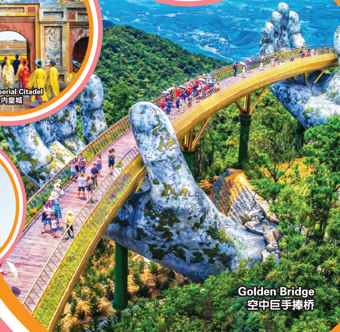
Golden Bridge 空中巨手捧桥