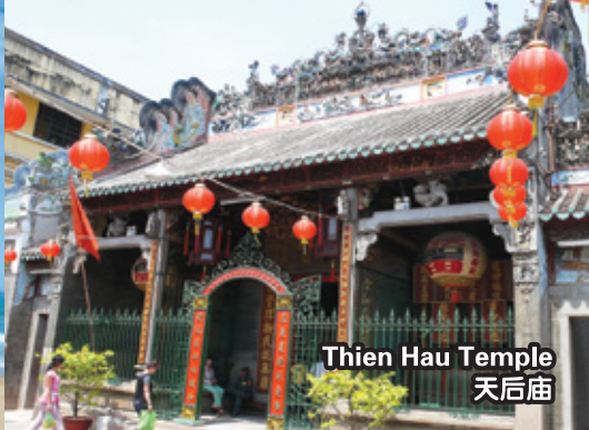
Thien Hau Temple 天后庙