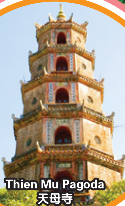
Thien Mu Pagoda 天母寺