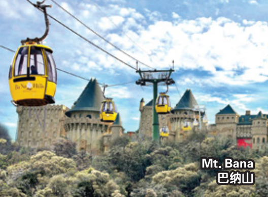
Mt. Bana 巴纳山