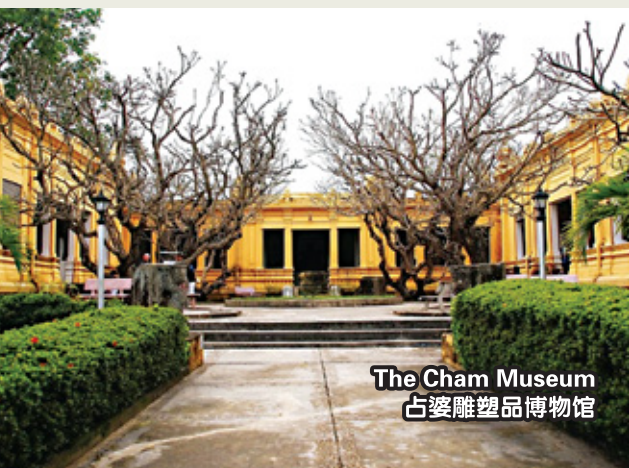
The Cham Museum 占婆雕塑品博物馆