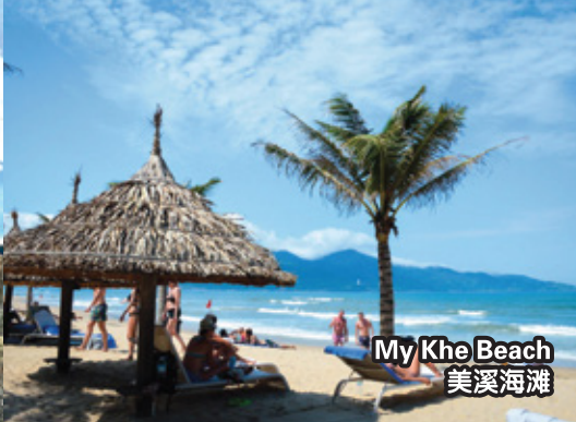
My Khe Beach 美溪海滩