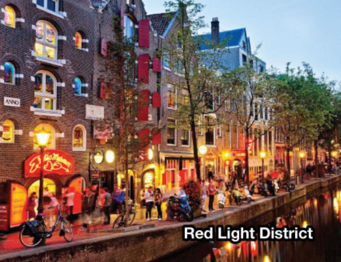
Red Light District