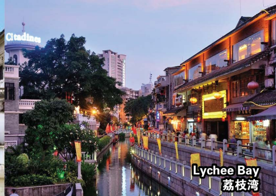
Lychee Bay 荔枝湾