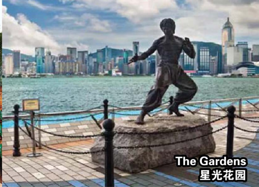
The Gardens 星光花园