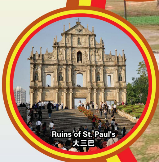
Ruins of St. Paul's 大三巴