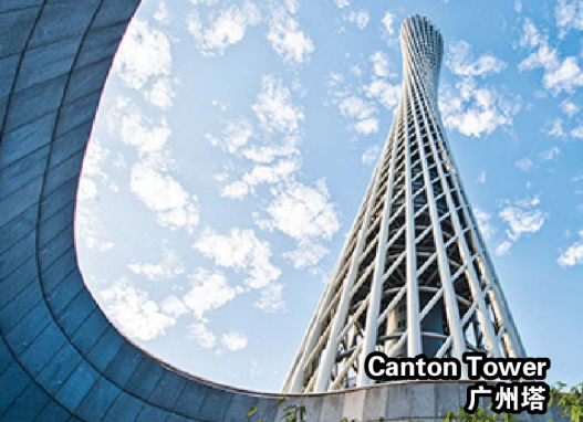
Canton Tower 广州塔