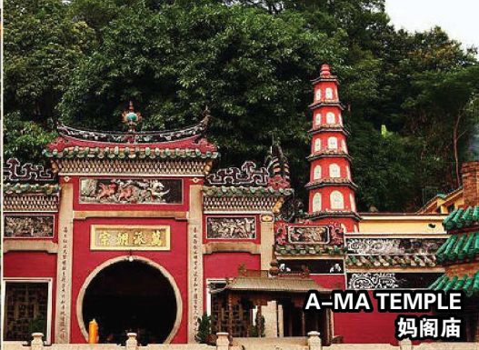
A-MA TEMPLE 妈阁庙