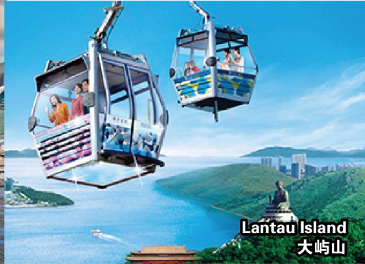
Lantau Island 大屿山