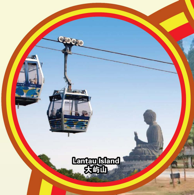
Lantau Island 大屿山