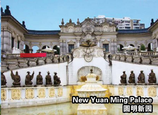
New Yuan Ming Palace 圆明新园