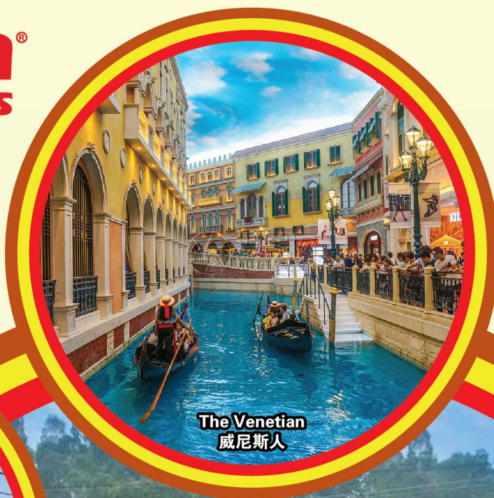
The Venetian 威尼斯人