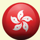
Hong Kong 香港