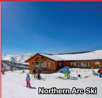
Northern Arc Ski

Sequences of Itinerary are subject to local arrangement.