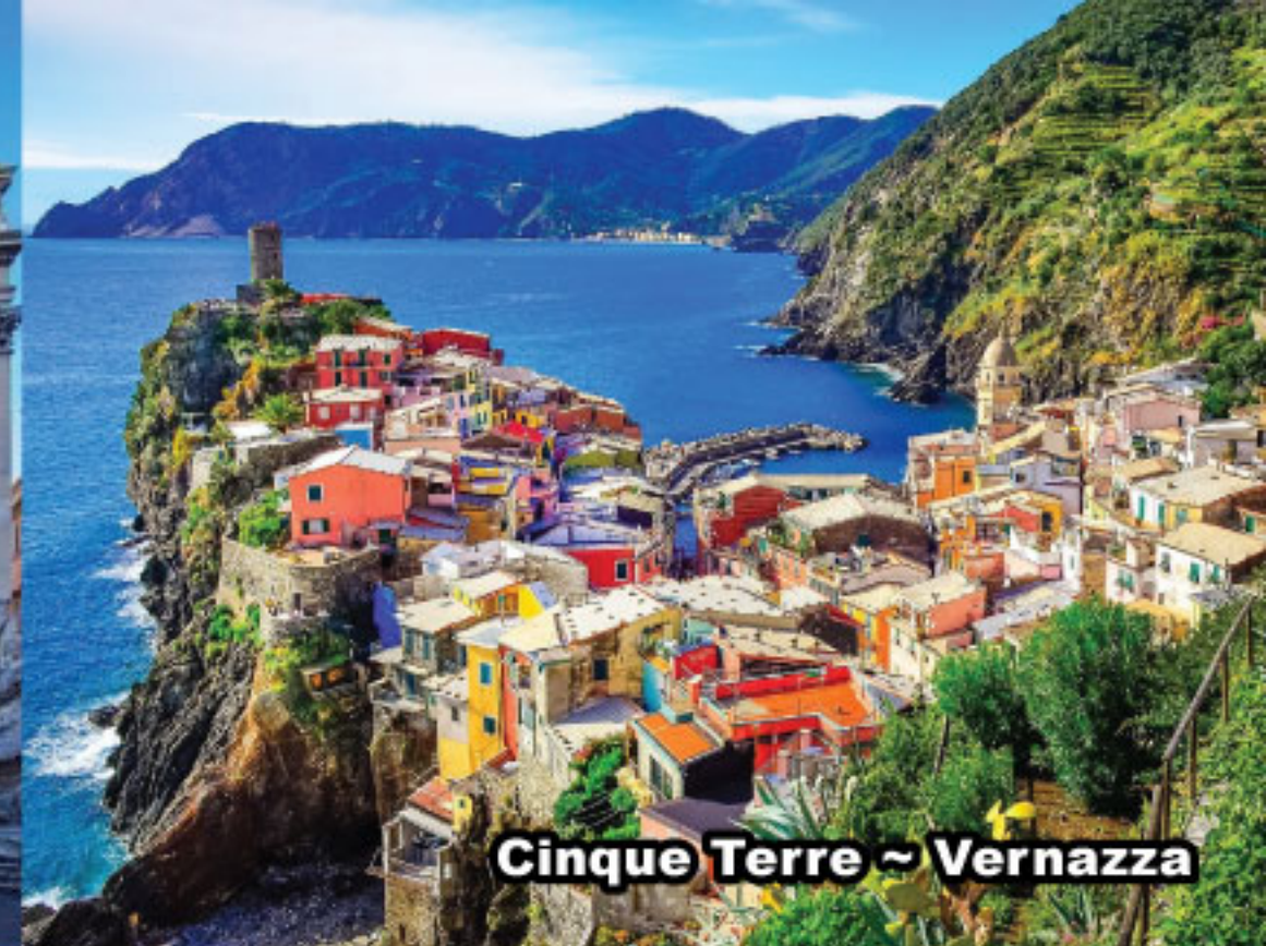
Cinque Terre ~ Vernazza