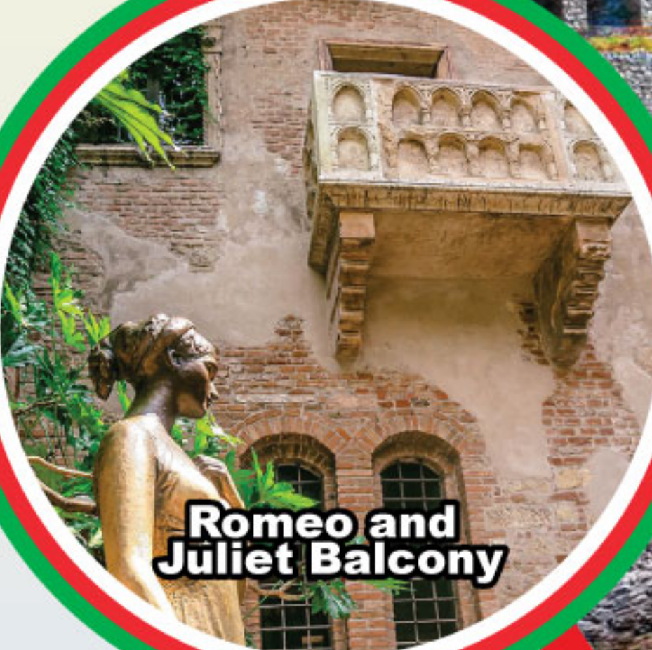
Romeo and Juliet Balcony