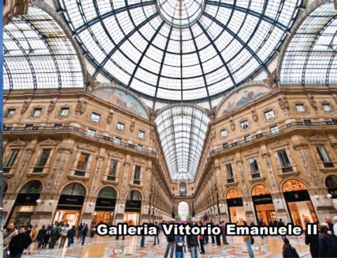
Galleria Vittorio Emanuele II