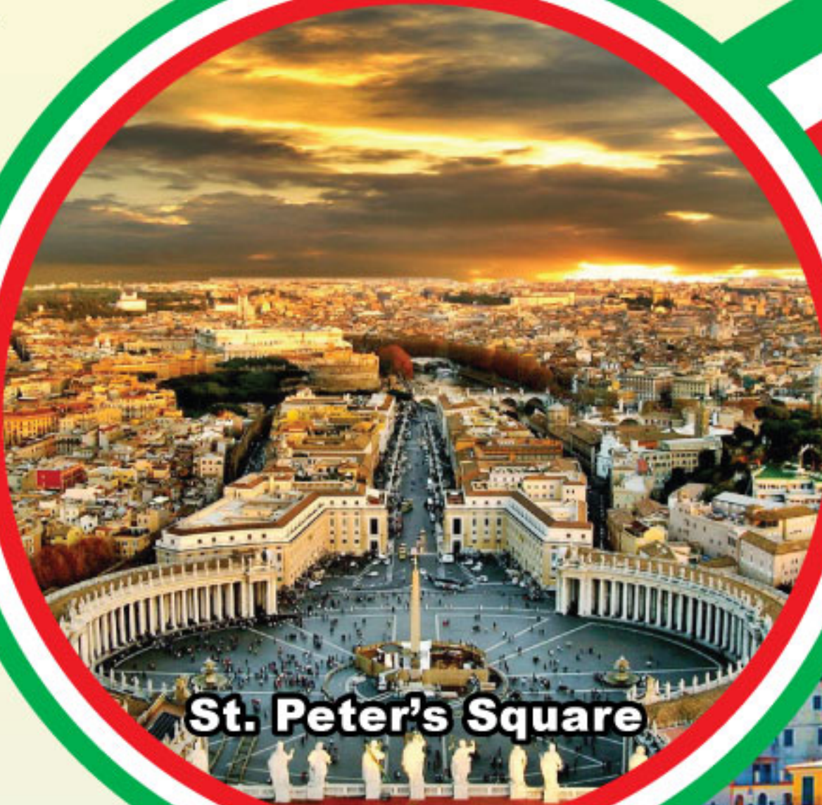
St. Peter's Square