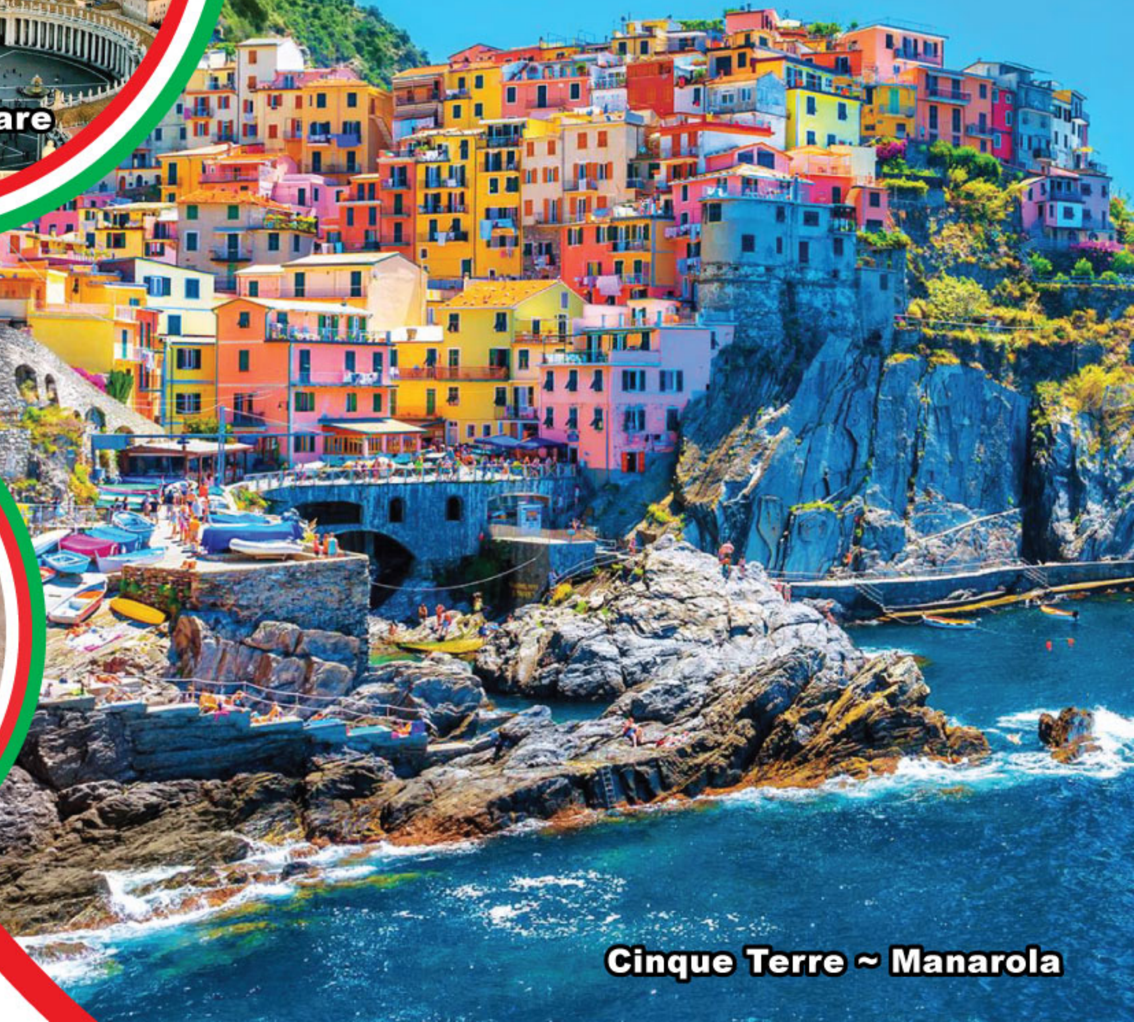
Cinque Terre ~ Manarola