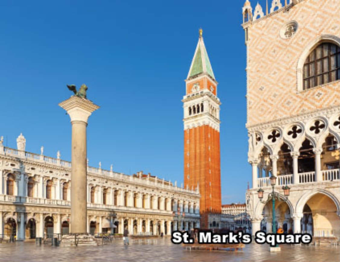
St. Mark's Square