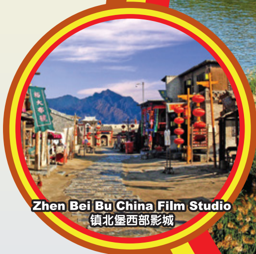
Zhen Bei Bu China Film Studio 镇北堡西部影城

行程次序，以当地旅社安排为准。 Sequences of Itinerary are subject to local arrangement.