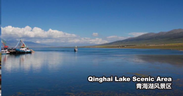
Qinghai Lake Scenic Area 青海湖风景区