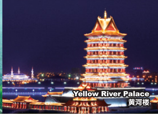
Yellow River Palace 黄河楼