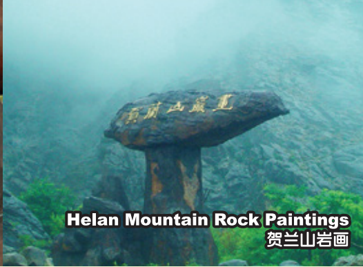
Helan Mountain Rock Paintings 贺兰山岩画