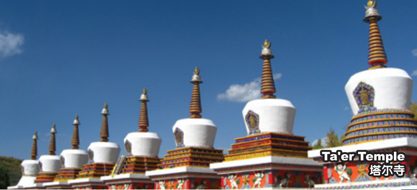
Ta'er Temple 塔尔寺