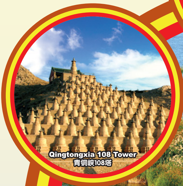
Qingtongxia 108 Tower 青铜峡108塔