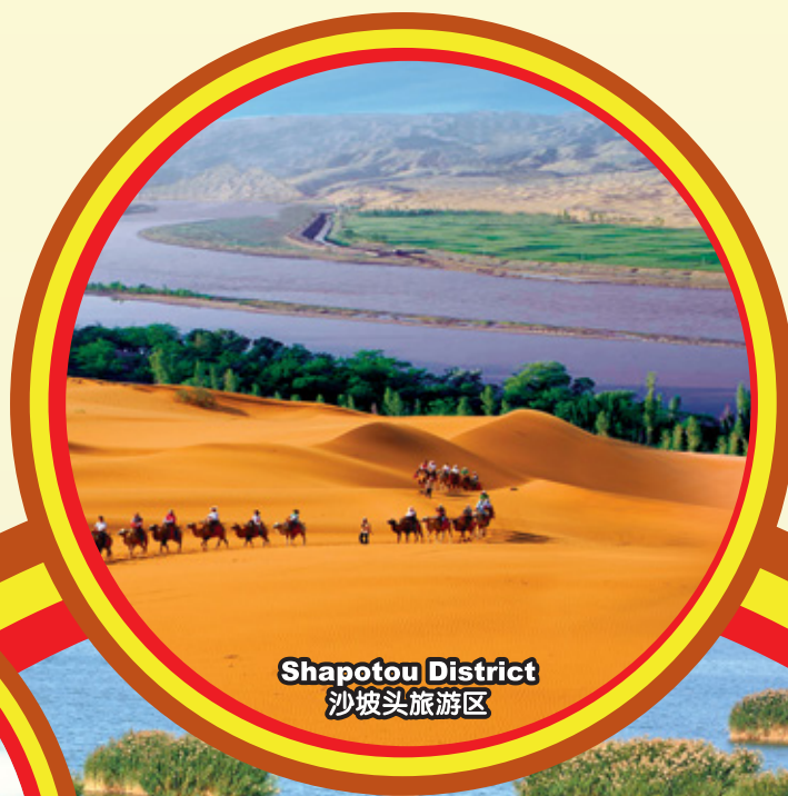
Shapotou District 沙坡头旅游区