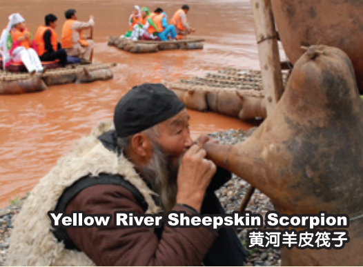
Yellow River Sheepskin Scorpion 黄河羊皮筏子