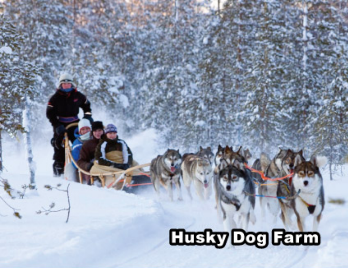
Husky Dog Farm