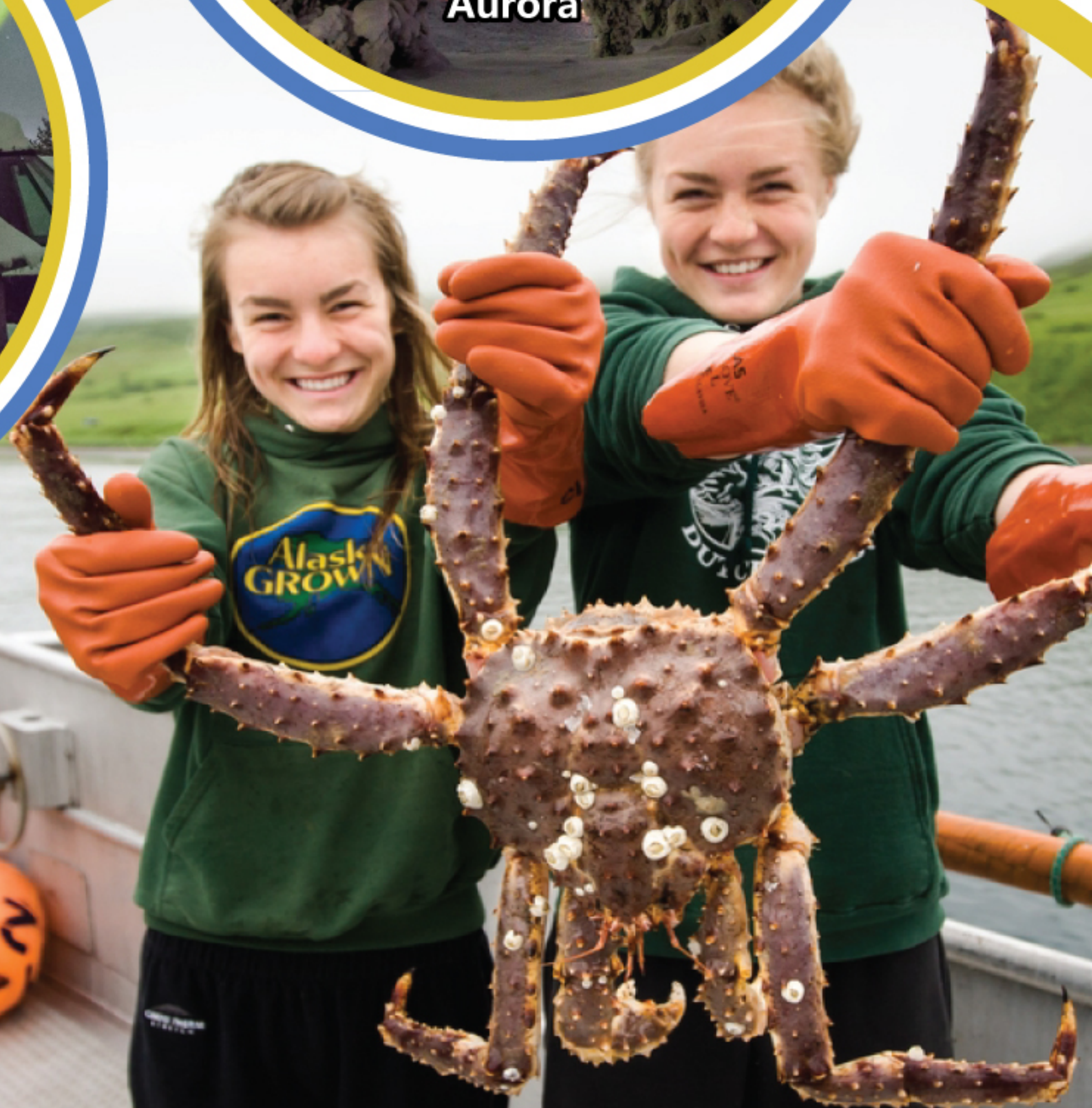
King Crab Fishing Trip