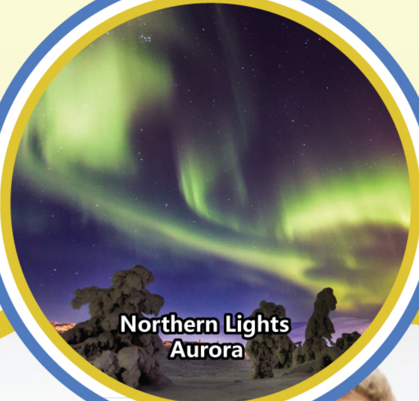
Northern Lights Aurora