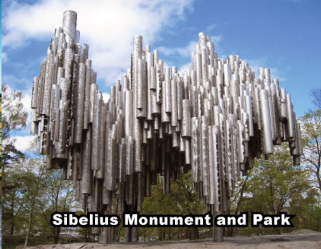
Sibelius Monument and Park