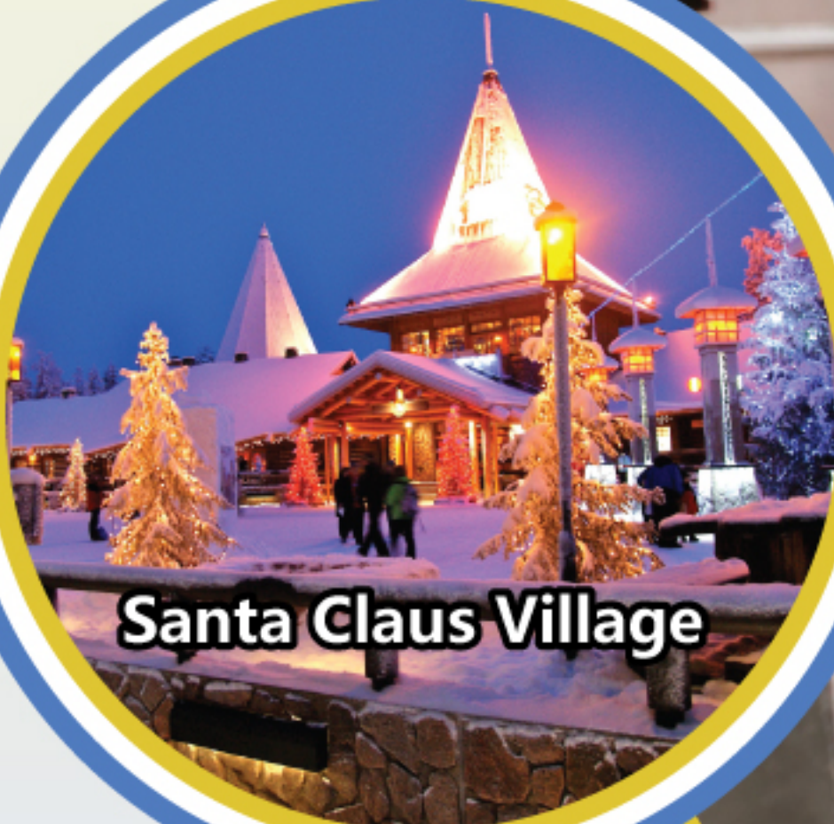
Santa Claus Village