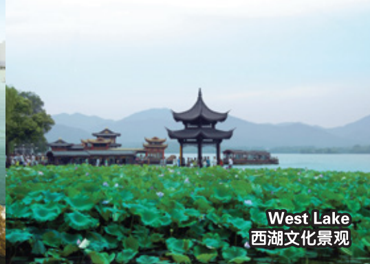
West Lake 西湖文化景观