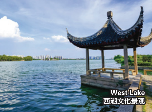
West Lake 西湖文化景观