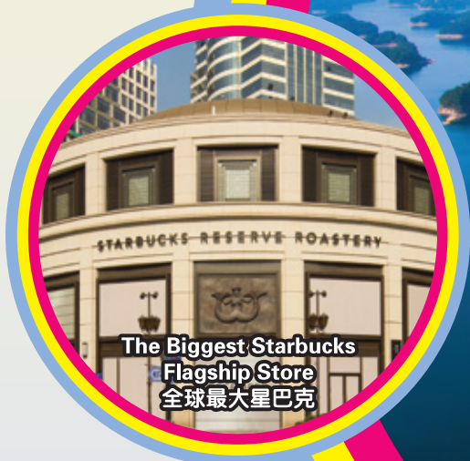
The Biggest Starbucks Flagship Store 全球最大星巴克

行程次序，以当地旅社安排为准。 Sequences of Itinerary are subject to local arrangement.