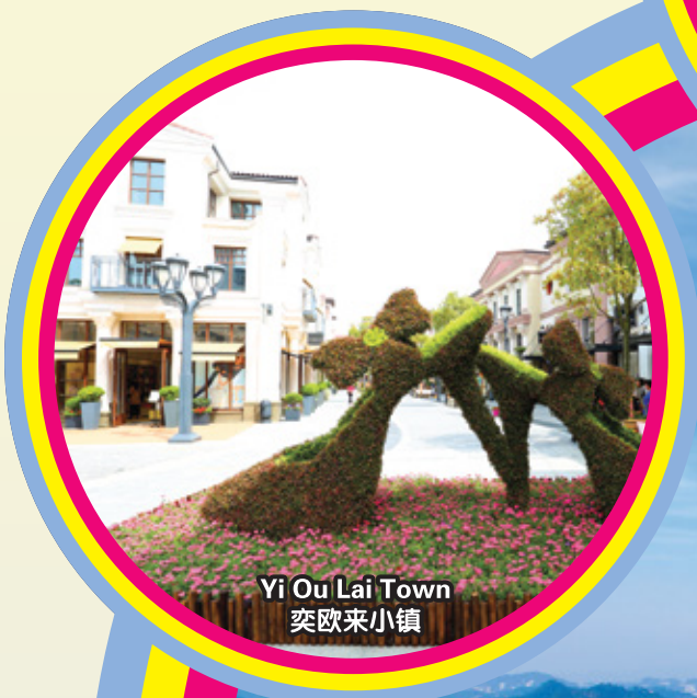
Yi Ou Lai Town 奕欧来小镇