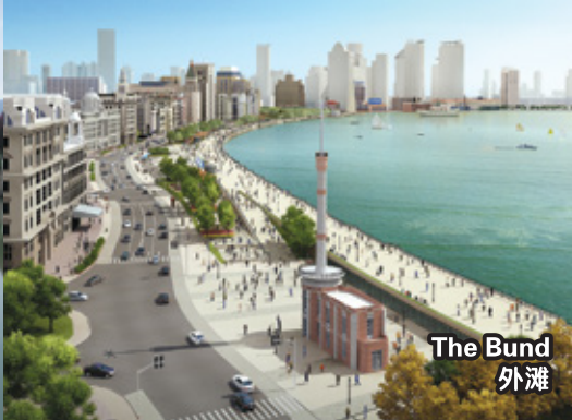
The Bund 外滩