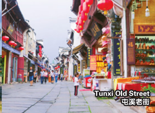
Tunxi Old Street 屯溪老街