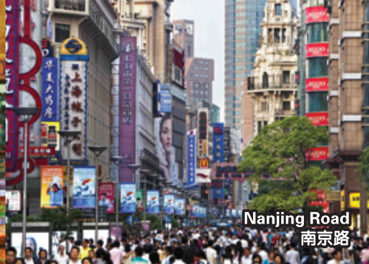
Nanjing Road 南京路