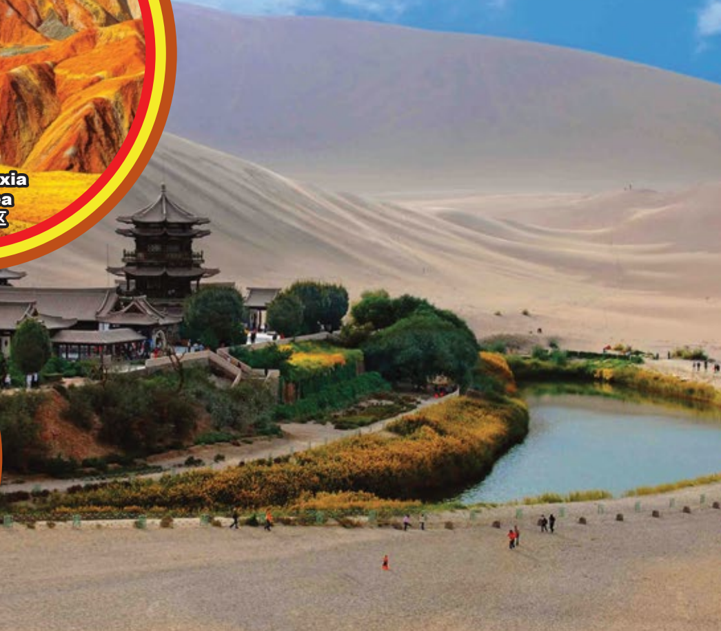
Mingsha Crescent Lake 鸣沙山月牙泉

行程次序，以當地旅社安排為準。 Sequences of Itinerary are subject to local arrangement.