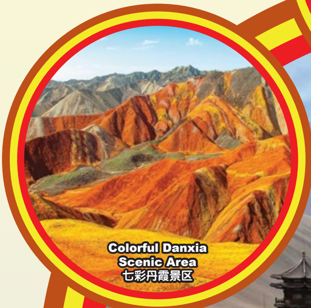
Colorful Danxia Scenic Area 七彩丹霞景区