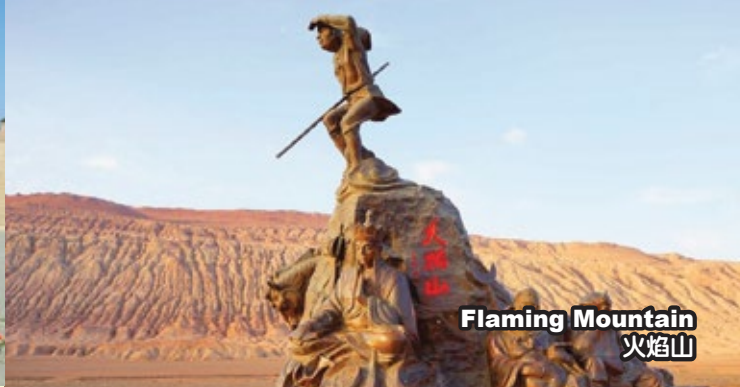
Flaming Mountain 火焰山