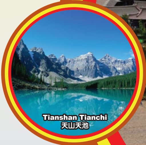
Tianshan Tianchi 天山天池