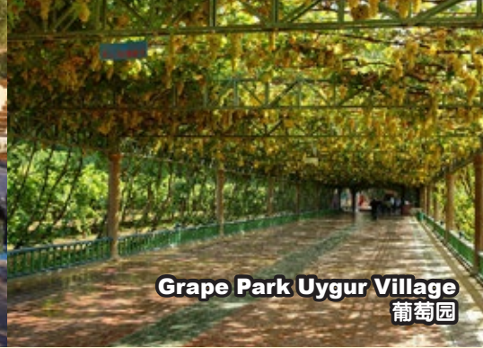
Grape Park Uygur Village 葡萄园