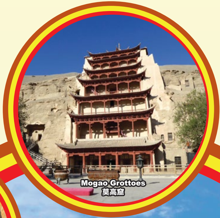
Mogao Grottoes 莫高窟