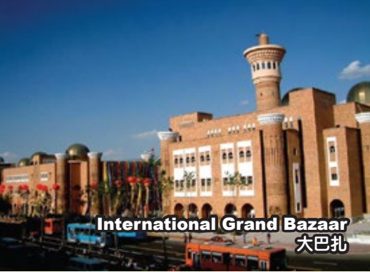
International Grand Bazaar 大巴扎