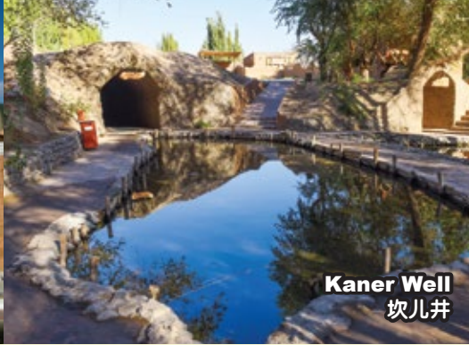
Kaner Well 坎儿井