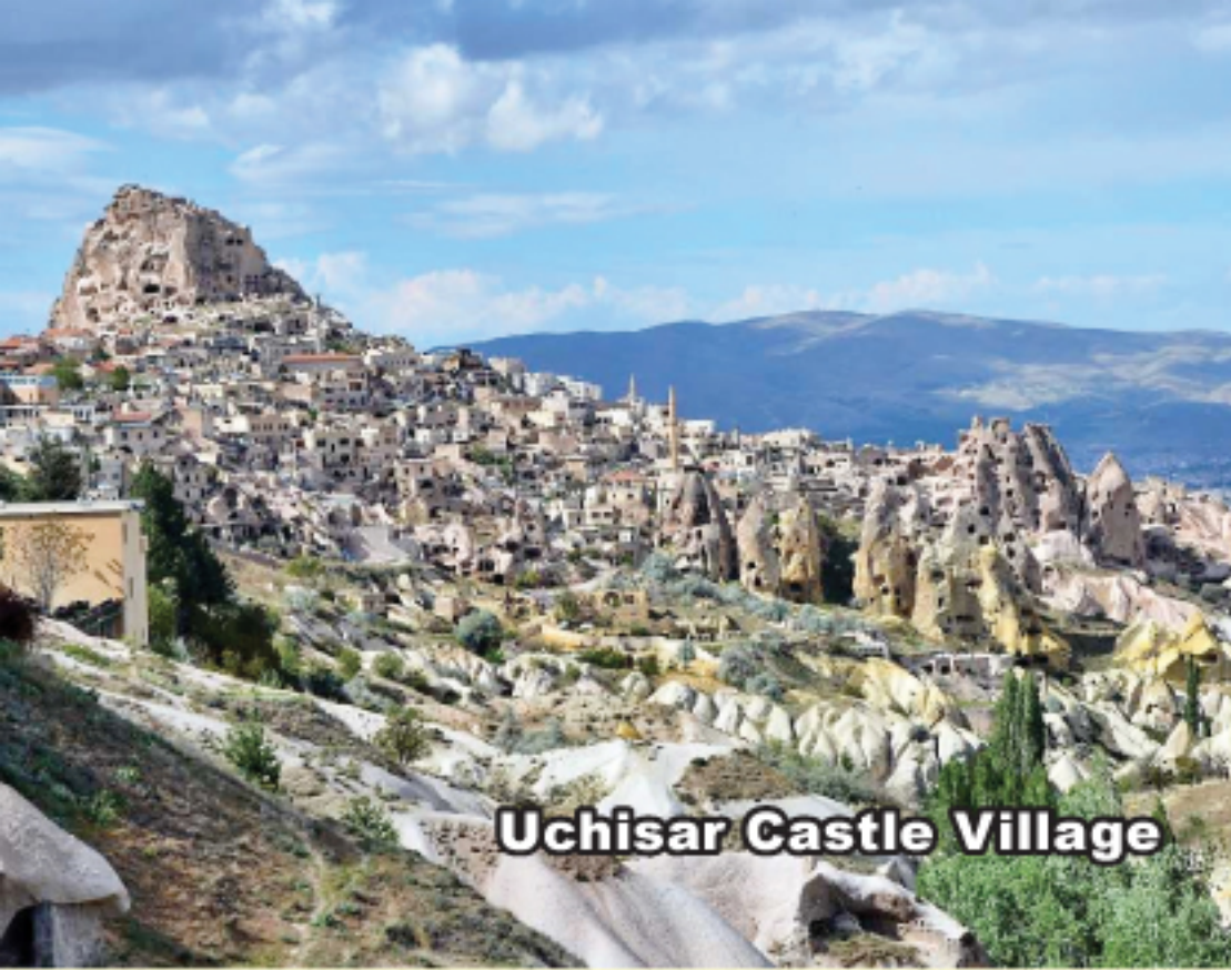
Uchisar Castle Village