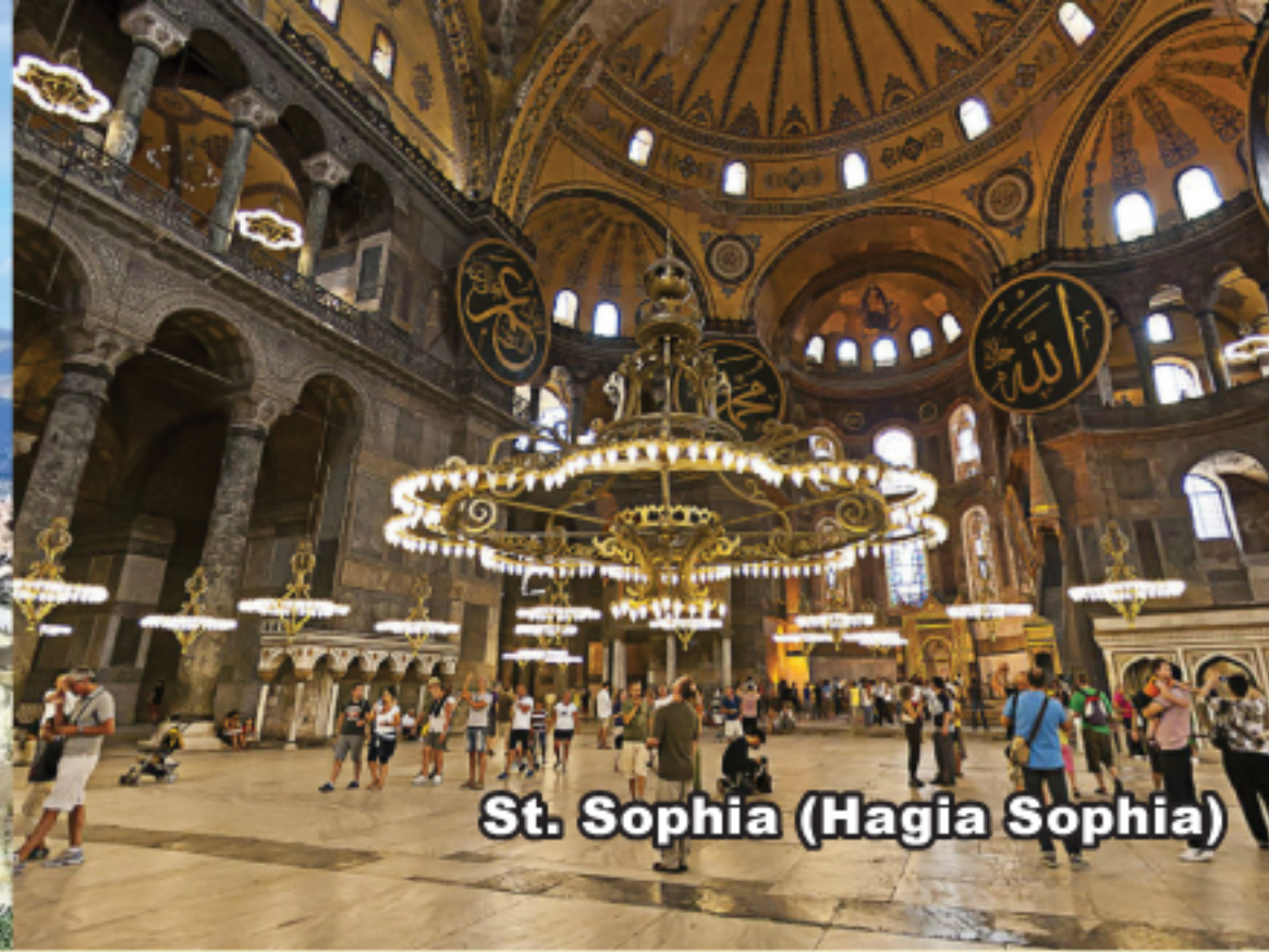
St. Sophia (Hagia Sophia)