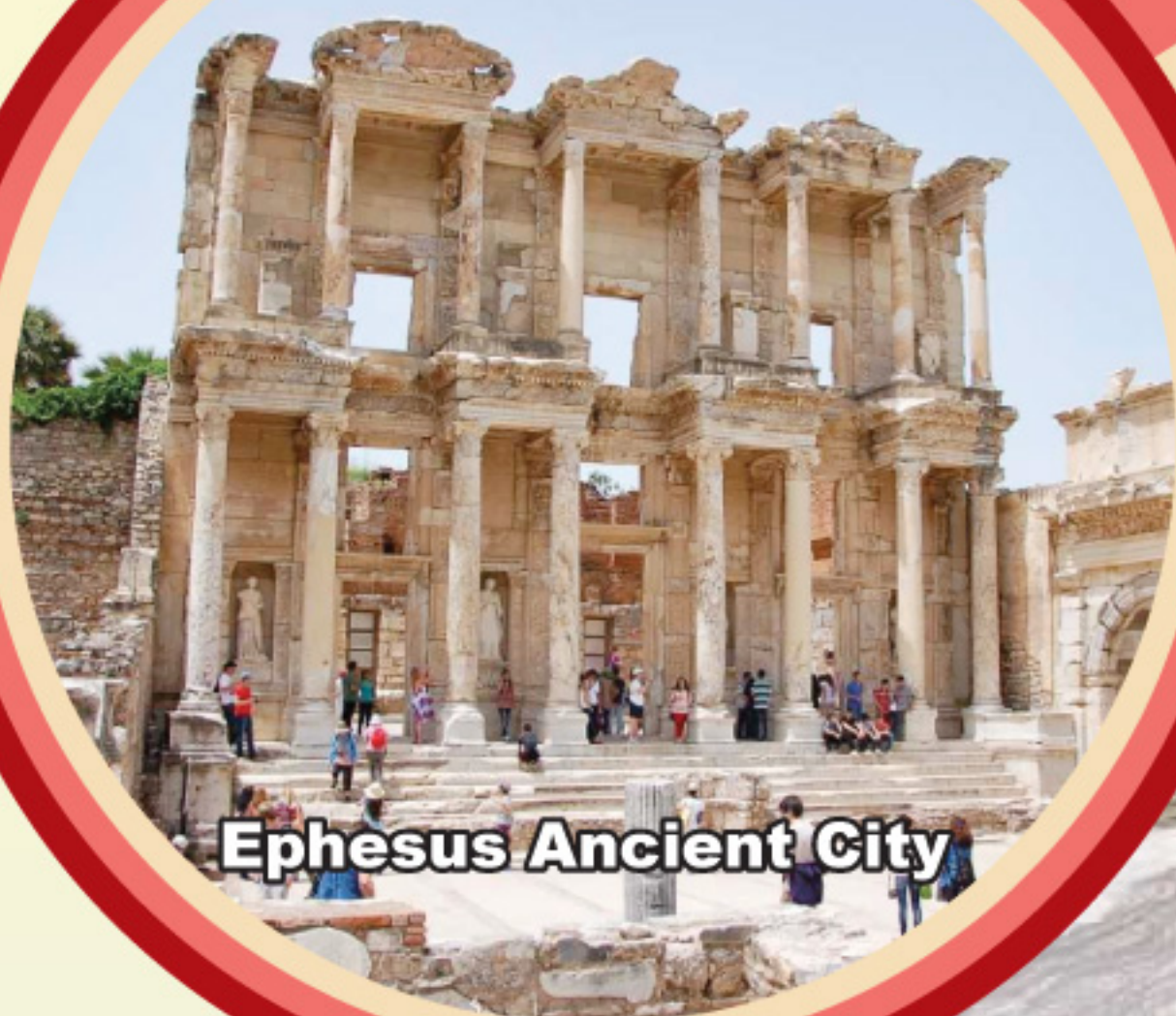
Ephesus Ancient City