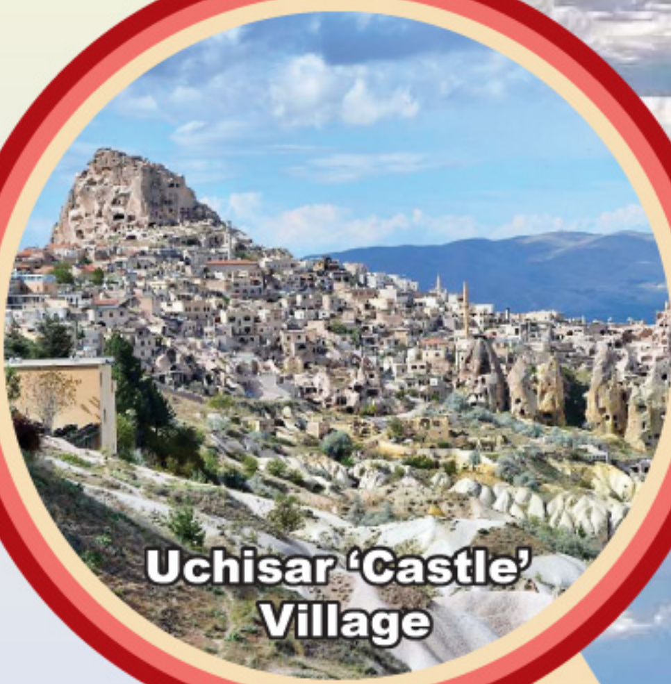
Uchisar 'Castle' Village