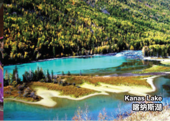
Kanas Lake 喀纳斯湖