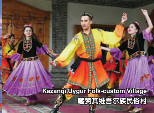
Kazanqi Uygur Folk-custom Village 喀赞其维吾尔族民俗村