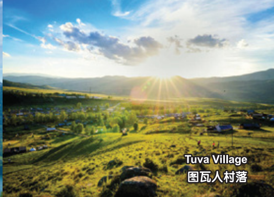
Tuva Village 图瓦人村落