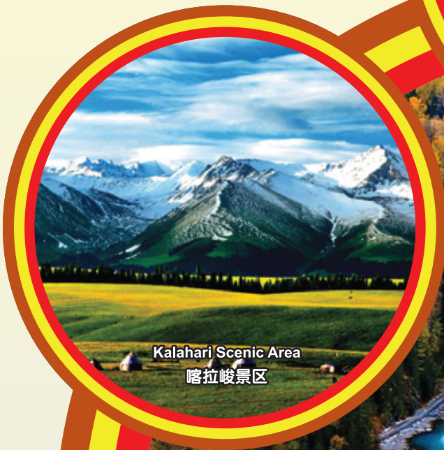
Kalahari Scenic Area 喀拉峻景区