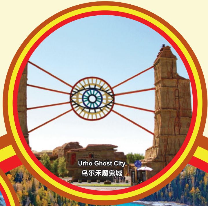
Urho Ghost City 乌尔禾魔鬼城