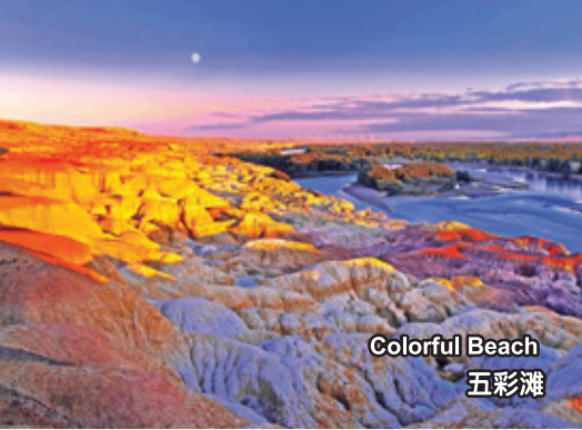
Colorful Beach 五彩滩