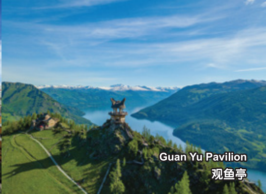
Guan Yu Pavilion 观鱼亭