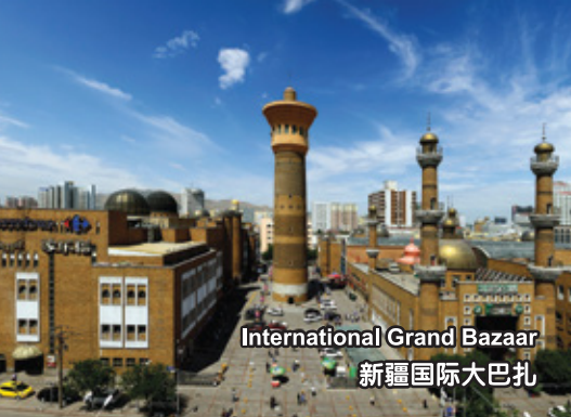
International Grand Bazaar 新疆国际大巴扎