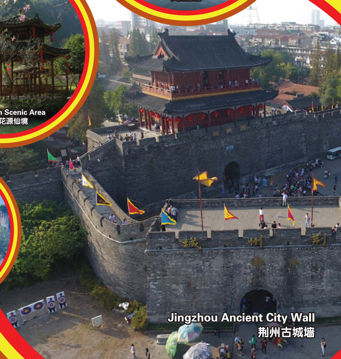
Jingzhou Ancient City Wall 荆州古城墙

行程次序，以当地旅社安排为准。 Sequences of Itinerary are subject to local arrangement.