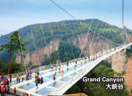
Grand Canyon 大峡谷