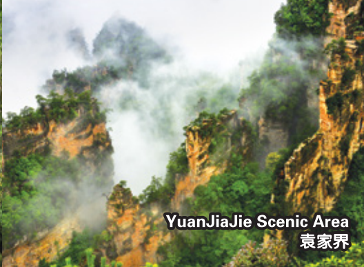
Yuanjiajie Scenic Area 袁家界