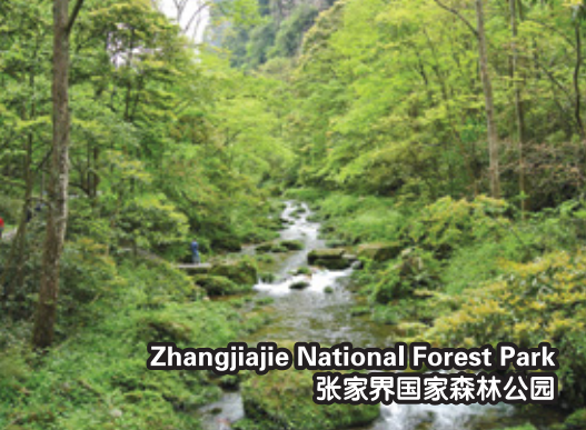
Zhangjiajie National Forest Park 张家界国家森林公园