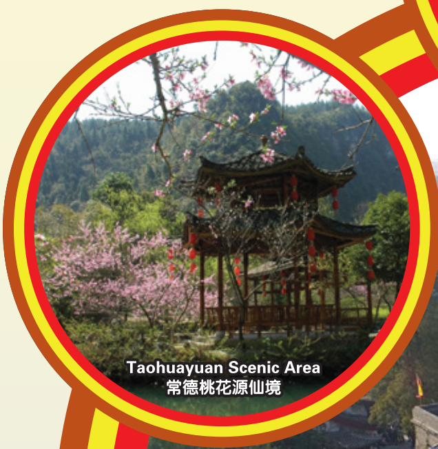
Taohuayuan Scenic Area 常德桃花源仙境