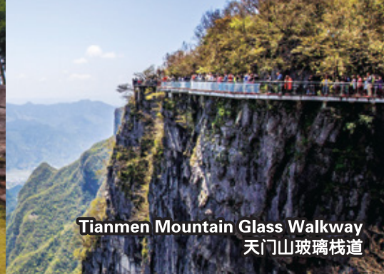
Tianmen Mountain Glass Walkway 天门山玻璃栈道