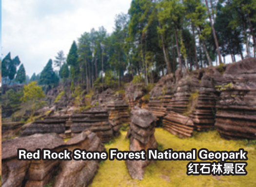
Red Rock Stone Forest National Geopark 红石林景区