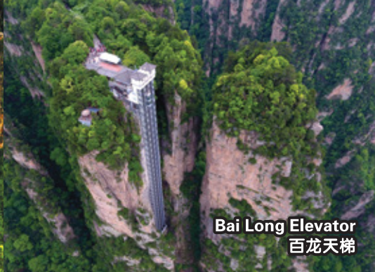
Bailong Elevator 百龙天梯