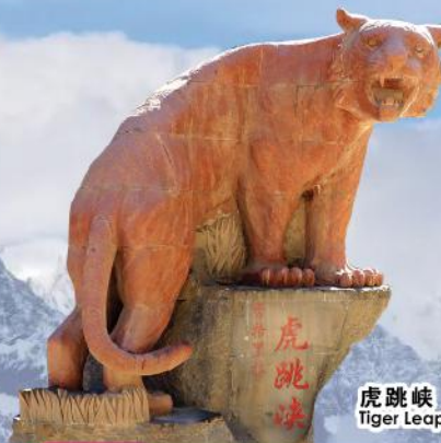
虎跳峡 Tiger Leaping Gorge