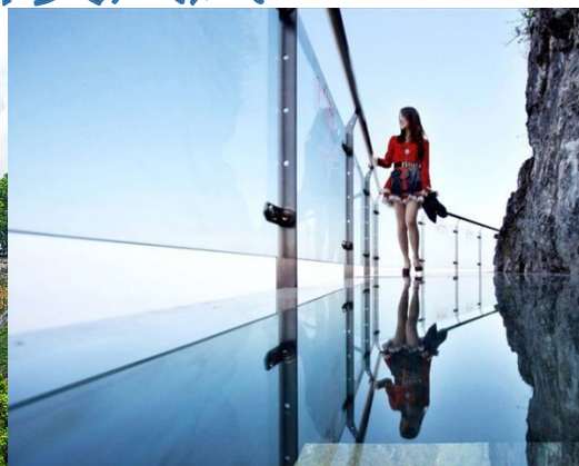
✿ Tianmen Mountain 天门山 (含缆车, 电梯, 玻璃栈道)