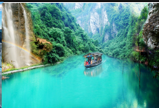
✿ The Grand Canyon of Zhangjiajie 张家界大峡谷 (含玻璃桥 + 游船)