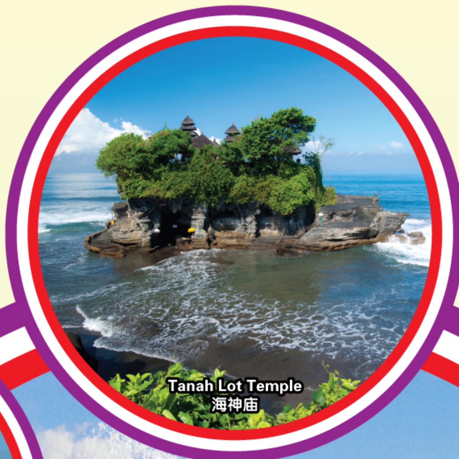
Tanah Lot Temple 海神庙