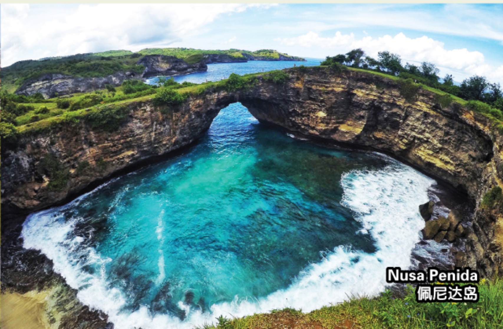
Nusa Penida 佩尼达岛