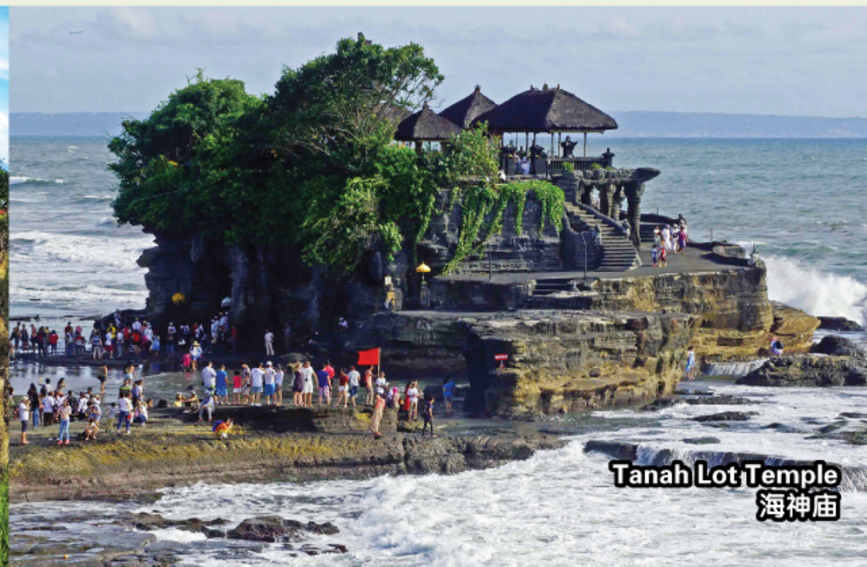
Tanah Lot Temple 海神庙