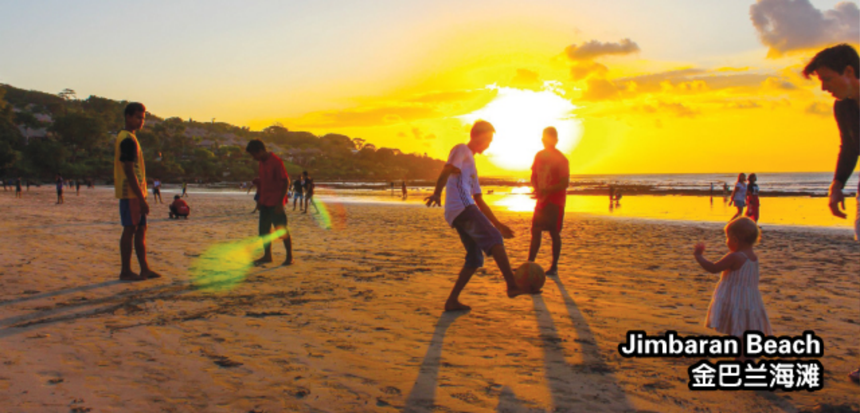
Jimbaran Beach 金巴兰海滩