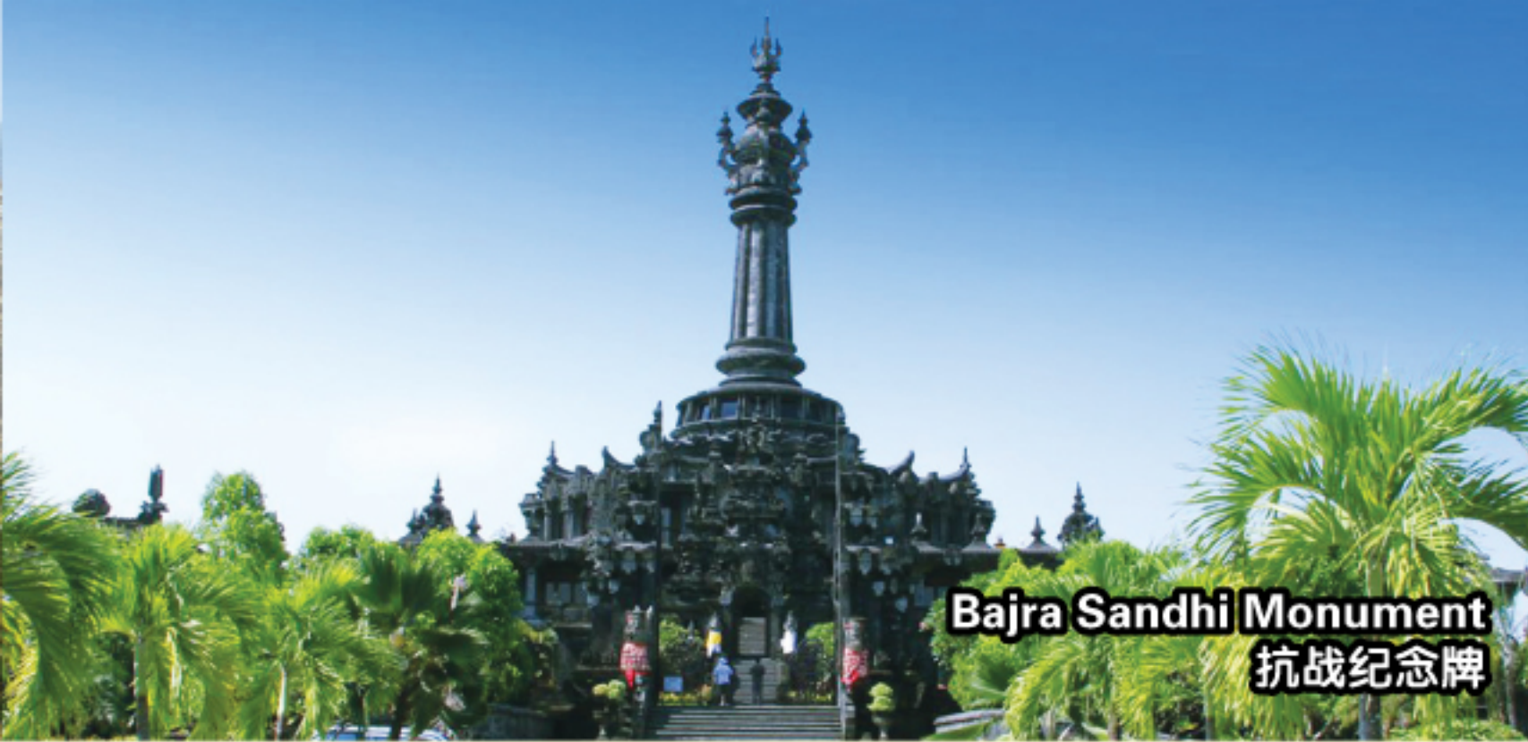
Bajra Sandhi Monument 抗战纪念碑