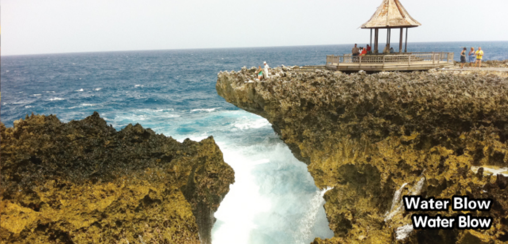
Water Blow Water Blow