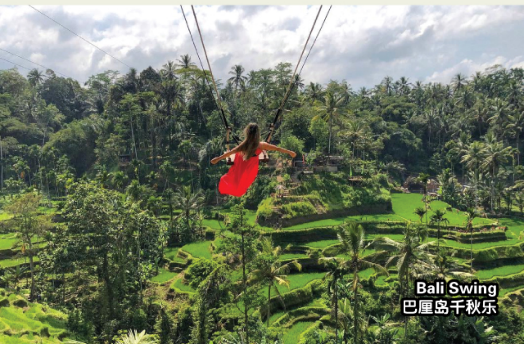
Bali Swing 巴厘岛千秋乐