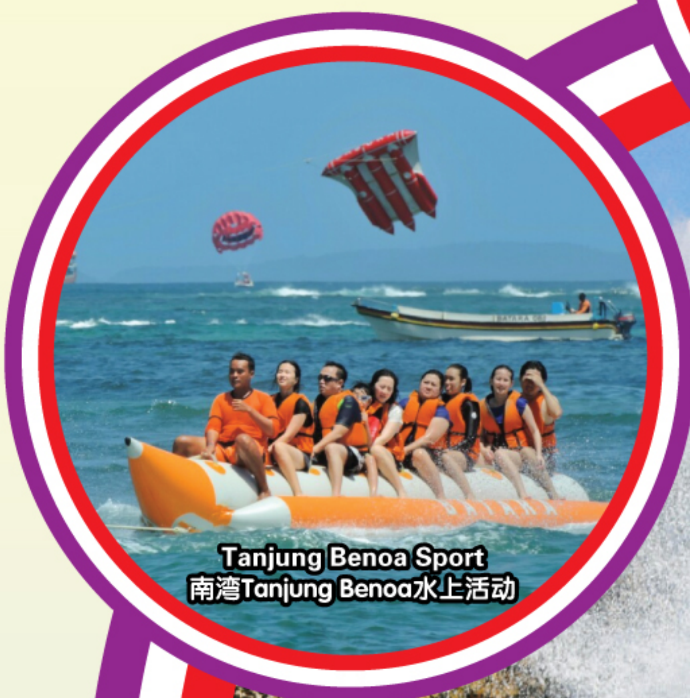
Tanjung Benoa Sport 南湾Tanjung Benoa水上活动