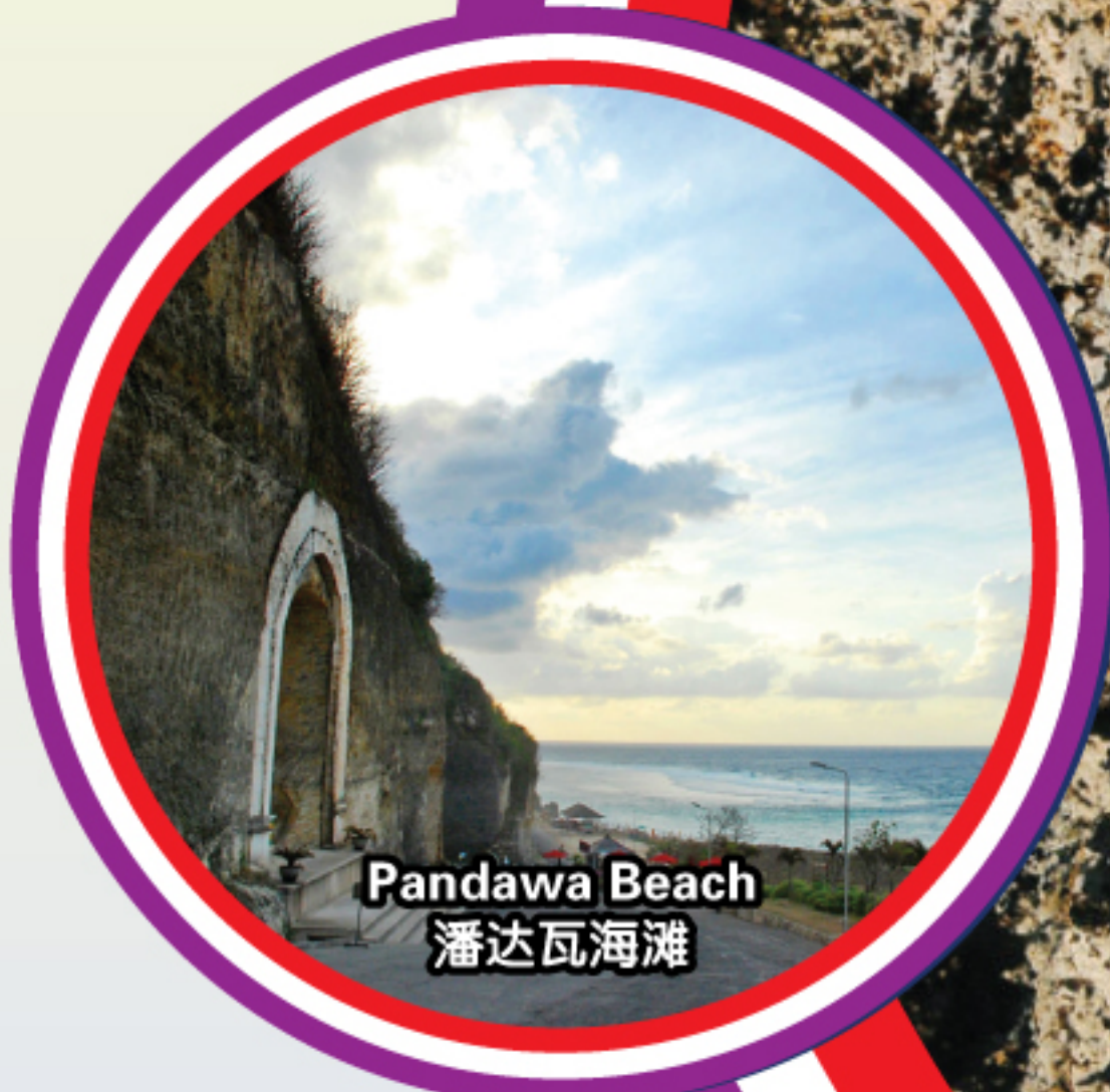
Pandawa Beach 潘达瓦海滩

行程次序，以当地旅社安排为准。 Sequences of Itinerary are subject to local arrangement.