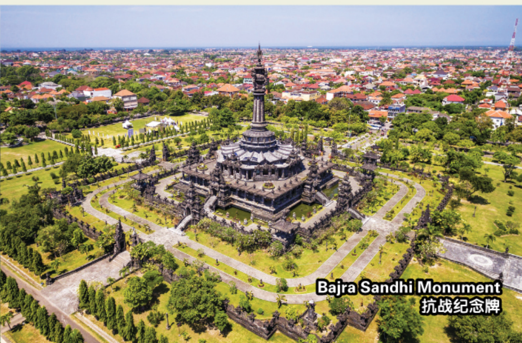
Bajra Sandhi Monument 抗战纪念碑