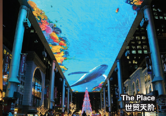
The Place 世贸天阶