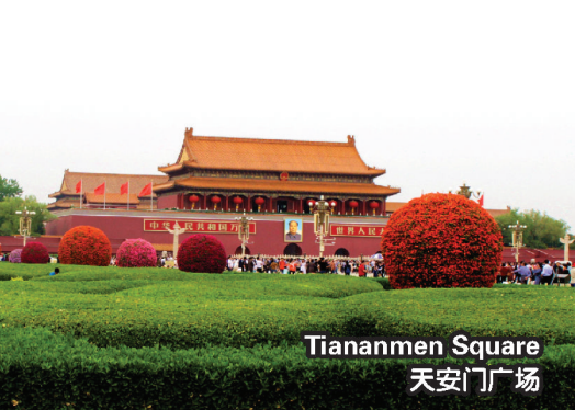
Tiananmen Square 天安门广场