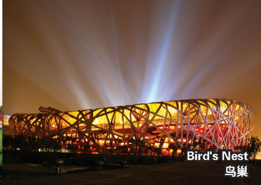
Bird's Nest 鸟巢