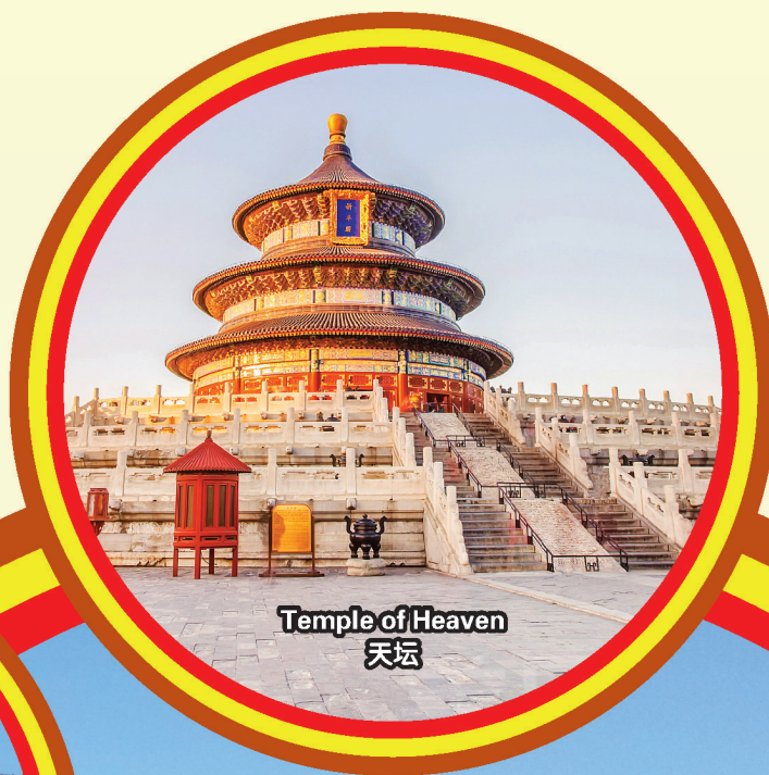
Temple of Heaven 天坛