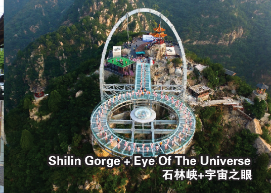
Shilin Gorge + Eye Of The Universe 石林峡+宇宙之眼