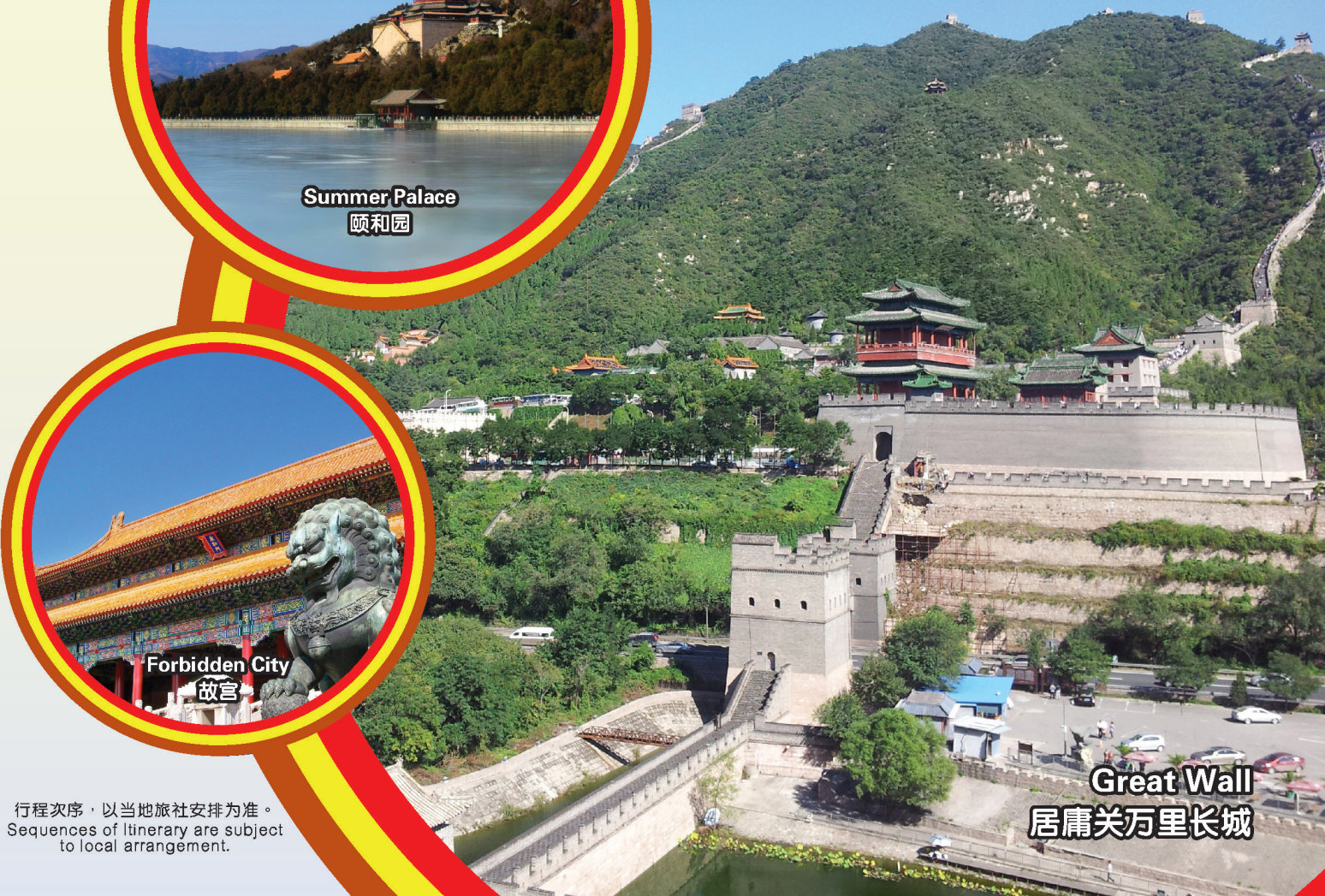
Great Wall 居庸关万里长城

行程次序，以当地旅社安排为准。 Sequences of Itinerary are subject to local arrangement.