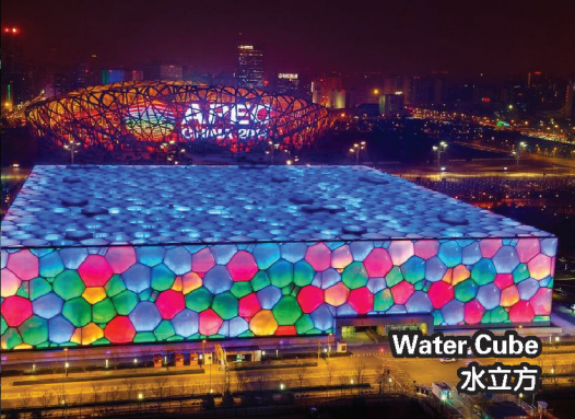
Water Cube 水立方