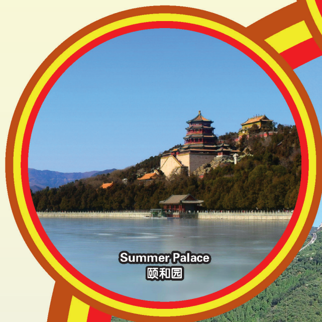
Summer Palace 颐和园