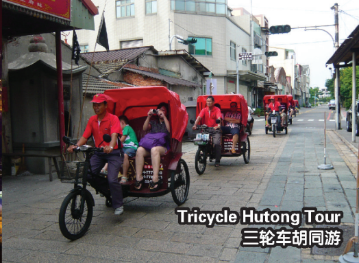
Tricycle Hutong Tour 三轮车胡同游