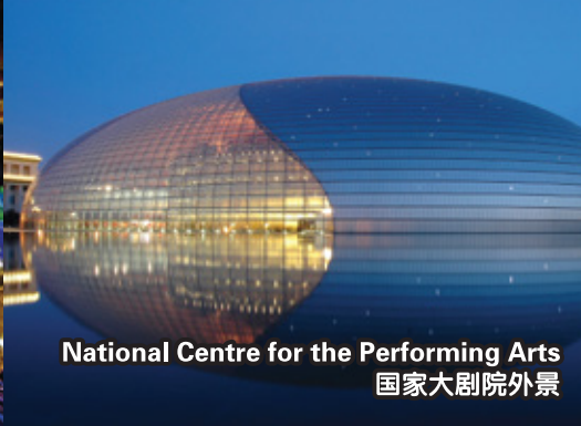
National Centre for the Performing Arts 国家大剧院外景