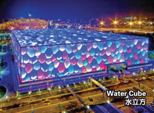
Water Cube 水立方