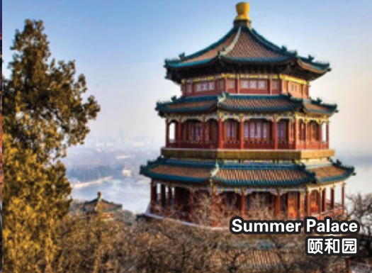
Summer Palace 颐和园