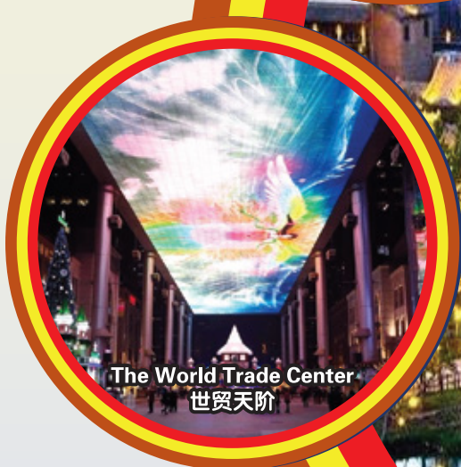
The World Trade Center 世贸天阶

行程次序，以当地旅社安排为准。 Sequences of Itinerary are subject to local arrangement.