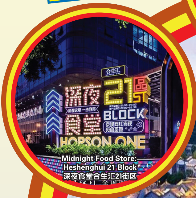
Midnight Food Store: Heshenghui 21 Block 深夜食堂合生汇21街区