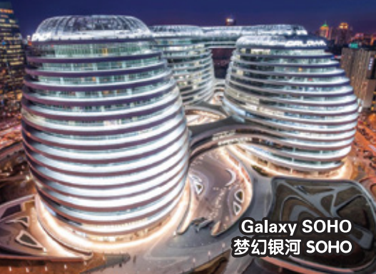
Galaxy SOHO 梦幻银河 SOHO