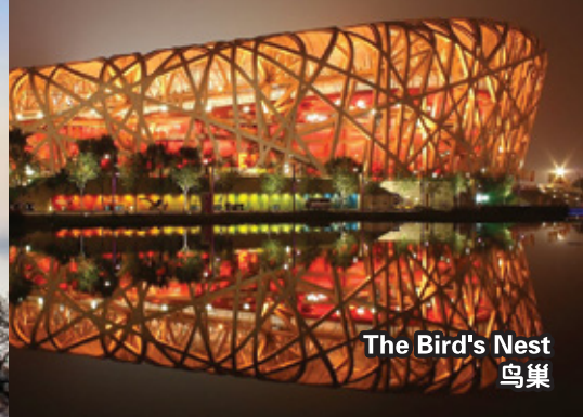
The Bird's Nest 鸟巢