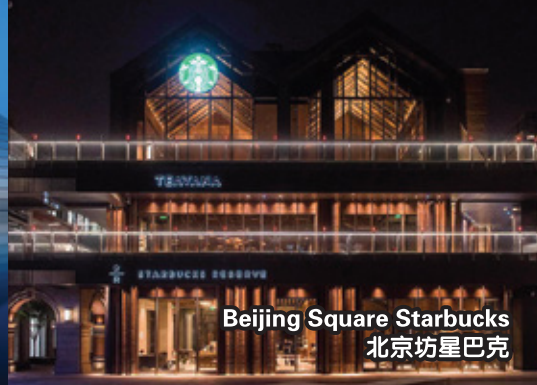
Beijing Square Starbucks 北京坊星巴克