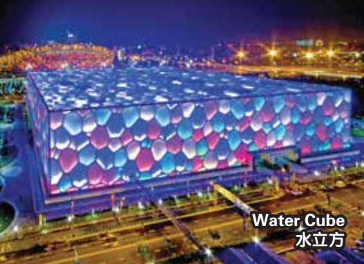
Water Cube 水立方