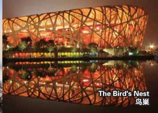
The Bird's Nest 鸟巢