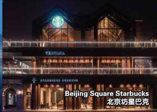
Beijing Square Starbucks 北京坊星巴克