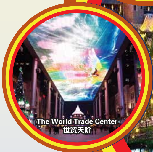
The World Trade Center 世贸天阶

行程次序，以当地旅社安排为准。 Sequences of Itinerary are subject to local arrangement.