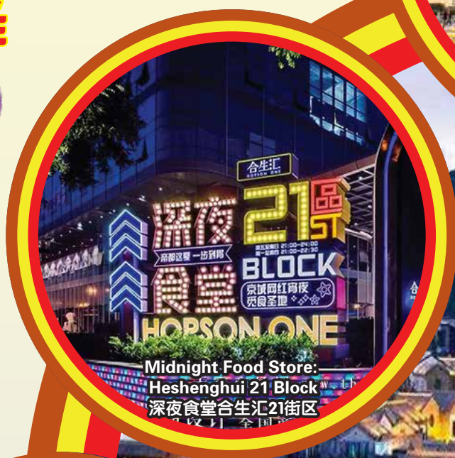
Midnight Food Store: Heshenghui 21 Block 深夜食堂合生汇21街区