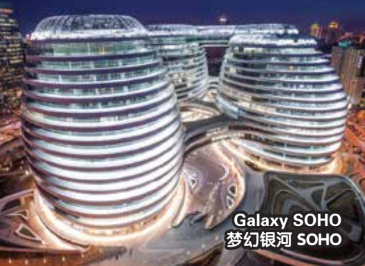
Galaxy SOHO 梦幻银河 SOHO