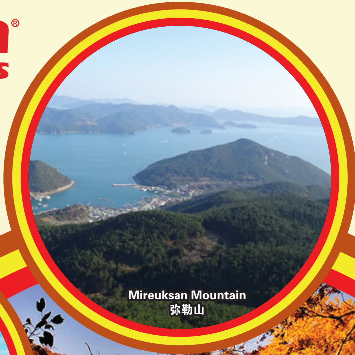
Mireuksan Mountain 弥勒山