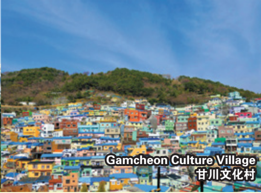
Gamcheon Culture Village 甘川文化村