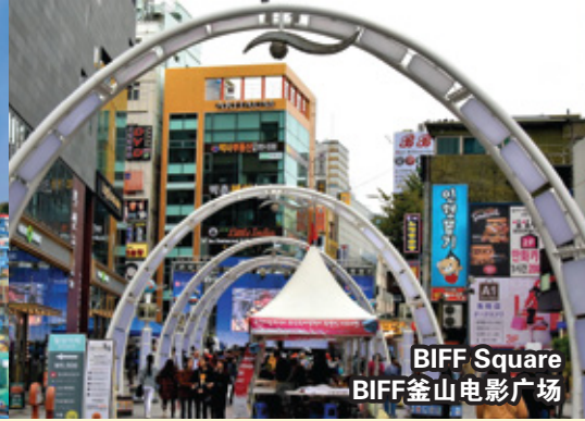
BIFF Square BIFF釜山电影广场