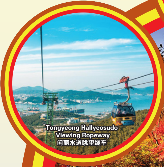
Tongyeong Hallyeosudo Viewing Ropeway 闲丽水道眺望缆车