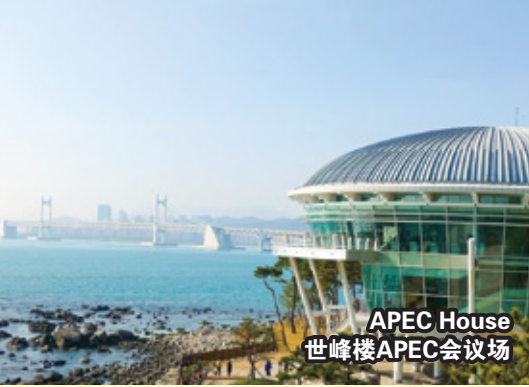
APEC House 世峰楼APEC会议场