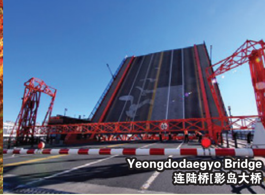
Yeongdodaegyo Bridge 连陆桥[影岛大桥]