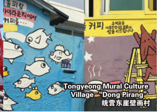
Tongyeong Mural Culture Village "Dong Pirang" 统营东崖壁画村