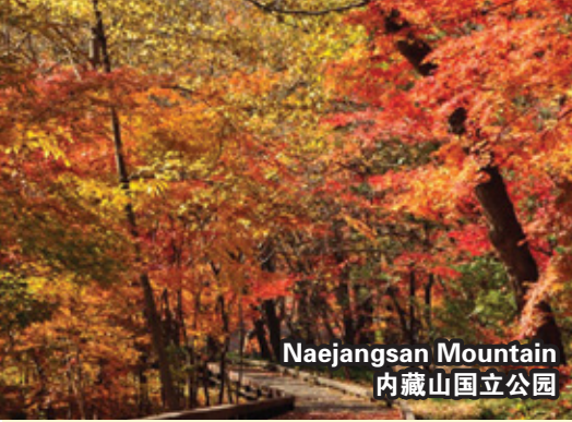
Naejangsan Mountain 内藏山国立公园