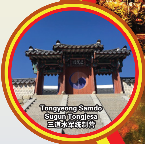
Tongyeong Samdo Sugun Tongjesa 三道水军统制营