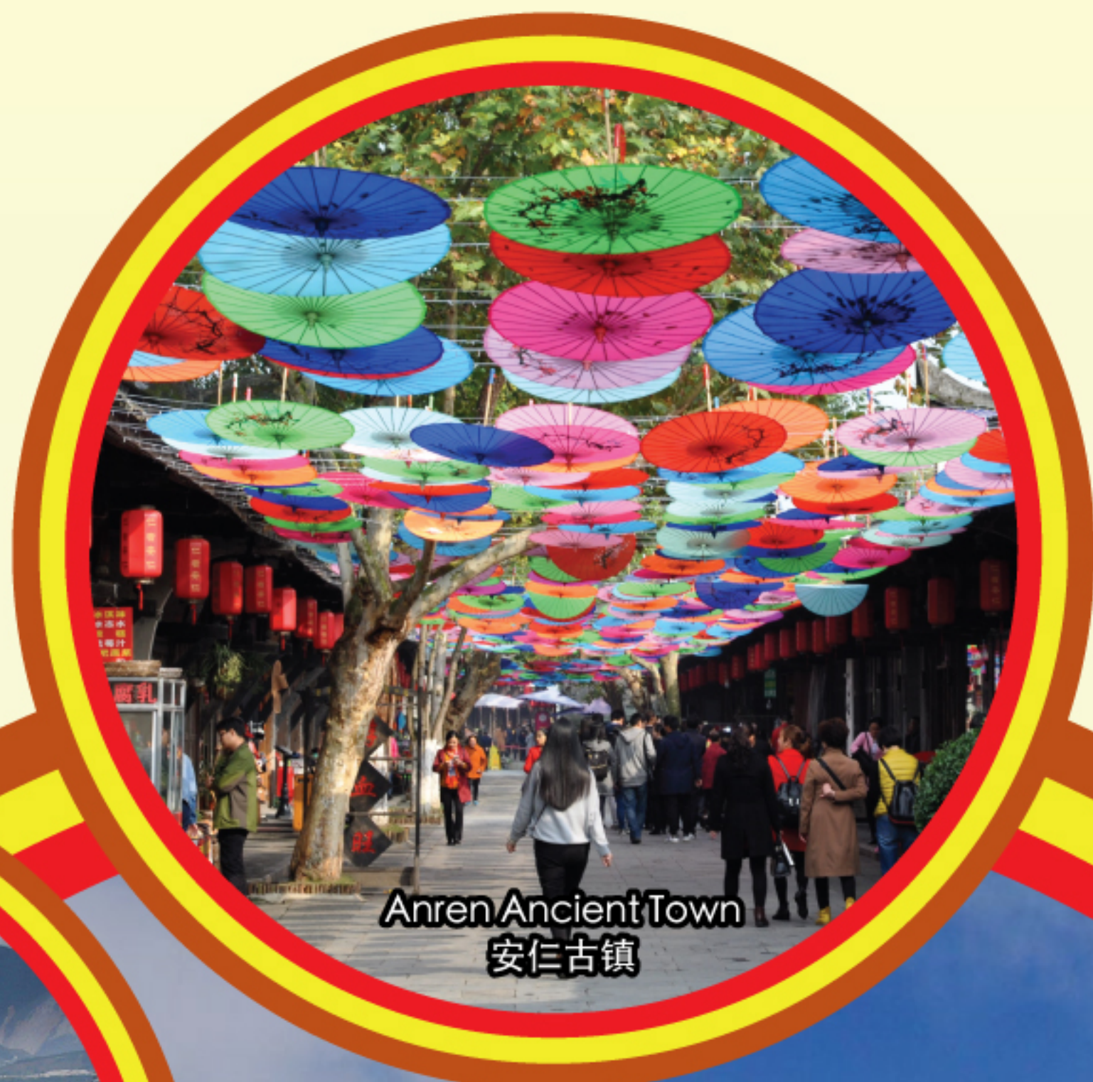
Anren Ancient Town 安仁古镇