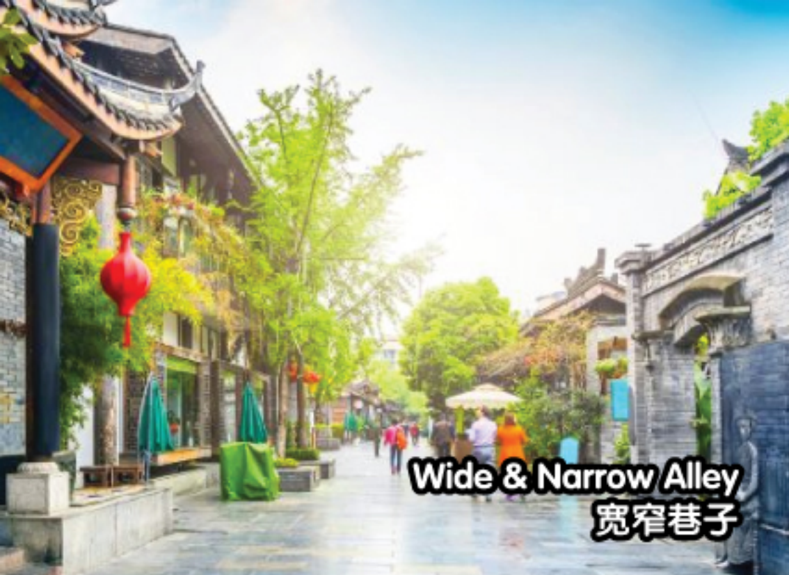
Wide & Narrow Alley 宽窄巷子