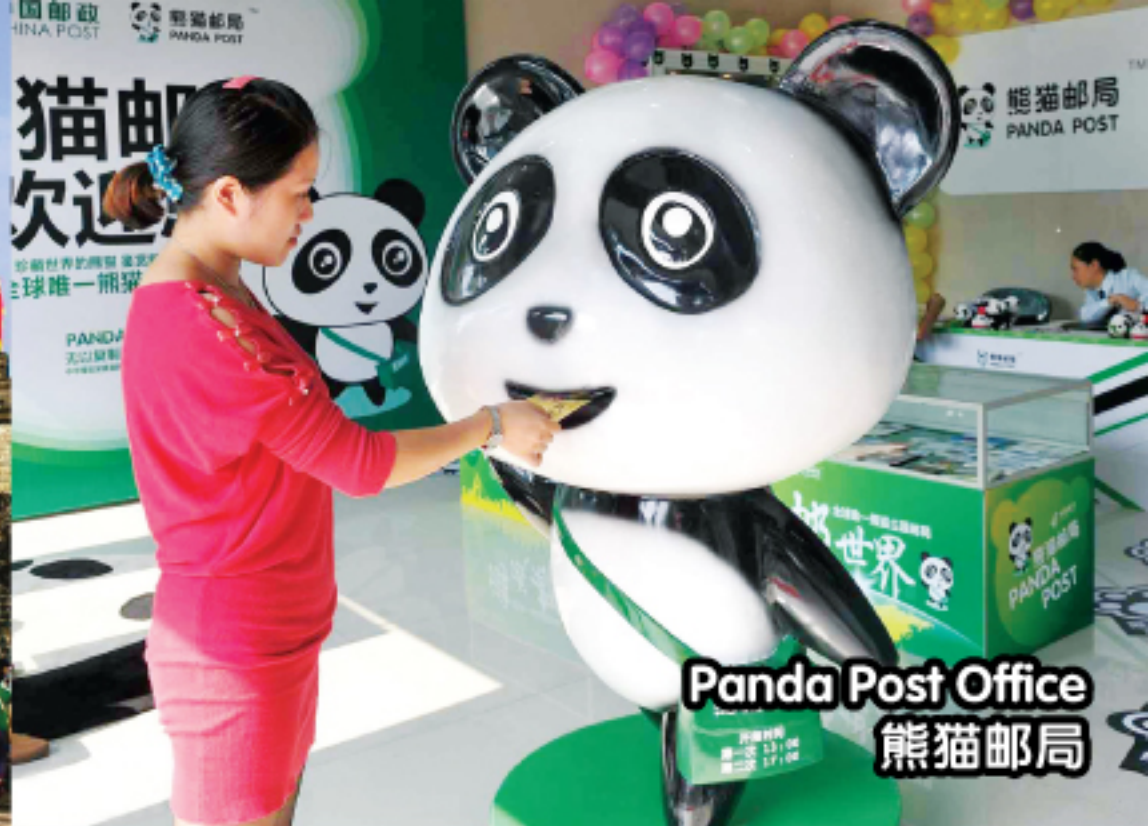
Panda Post Office 熊猫邮局