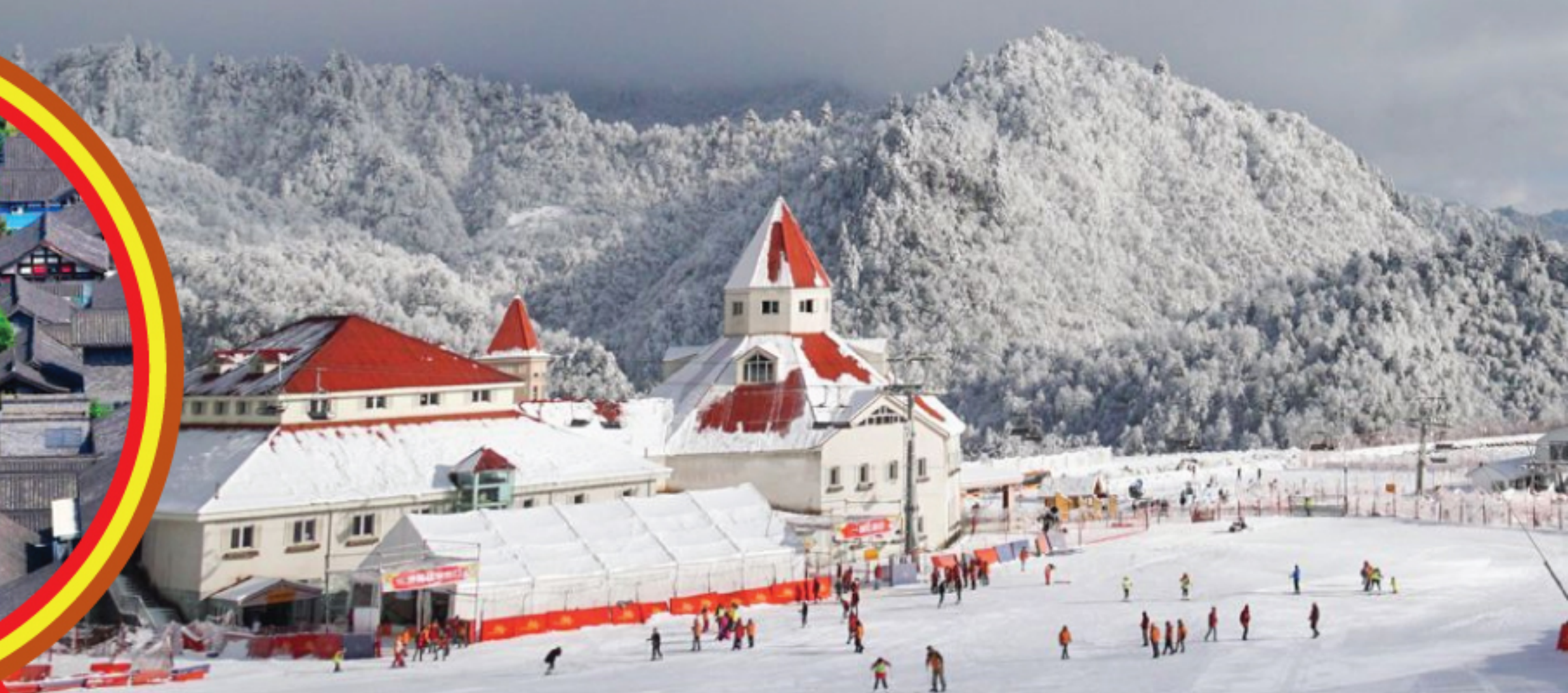
Xiling Snow Mountain 西岭雪山

行程次序，以當地旅社安排為準。 Sequences of Itinerary are subject to local arrangement.