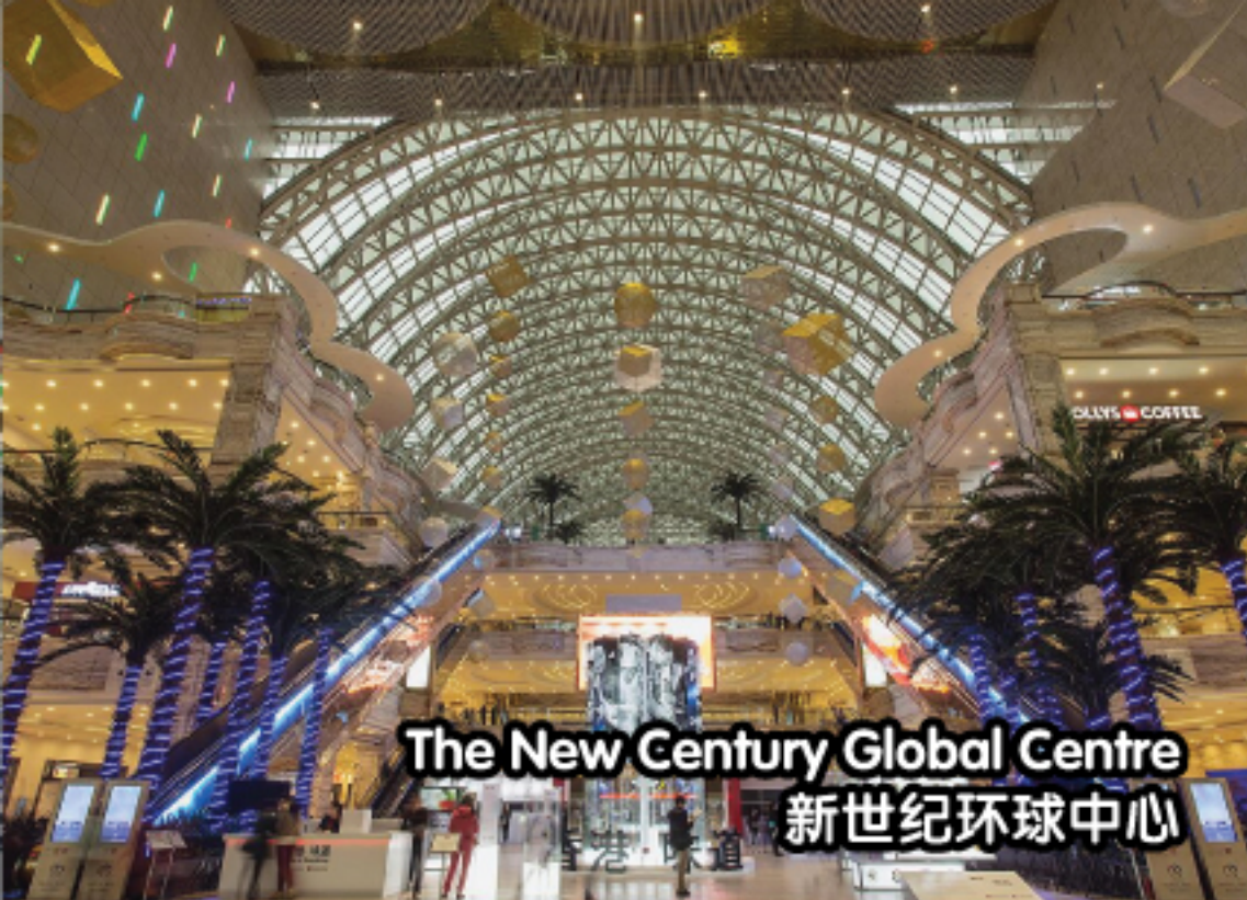
The New Century Global Centre 新世纪环球中心