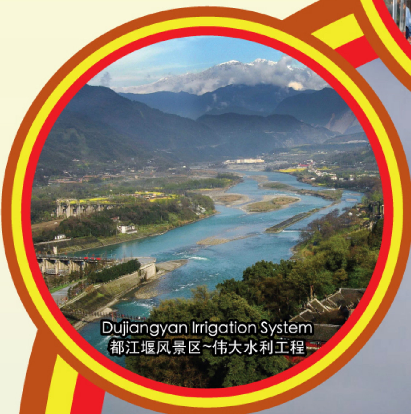
Dujiangyan Irrigation System 都江堰风景区~伟大水利工程