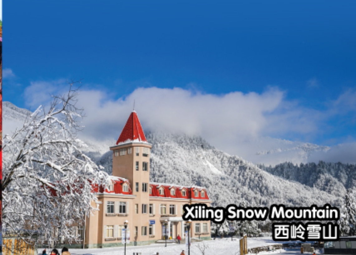
Xiling Snow Mountain 西岭雪山