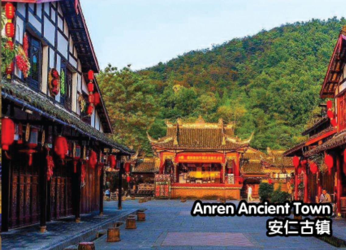
Anren Ancient Town 安仁古镇