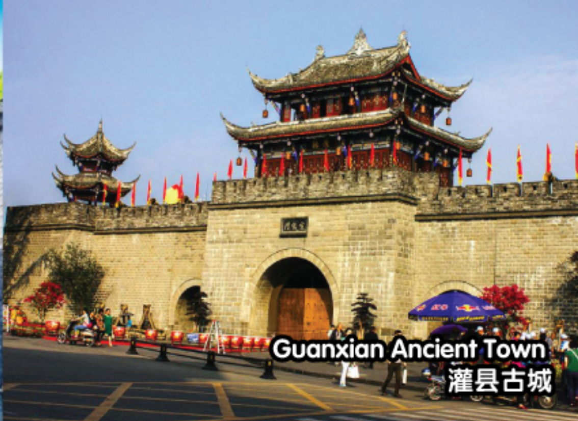
Guanxian Ancient Town 灌县古城