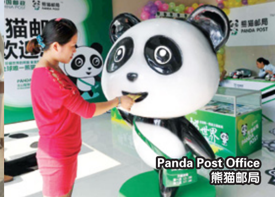
Panda Post Office 熊猫邮局