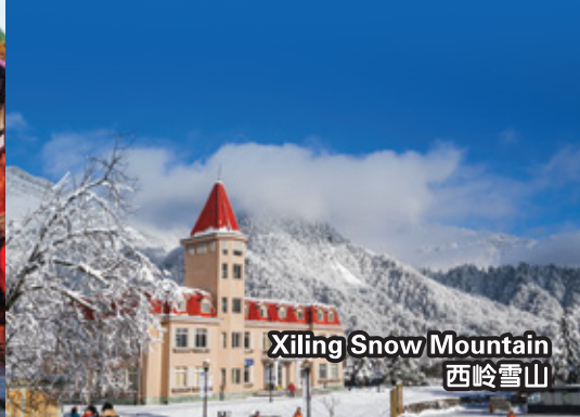
Xiling Snow Mountain 西岭雪山