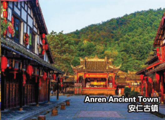
Anren Ancient Town 安仁古镇