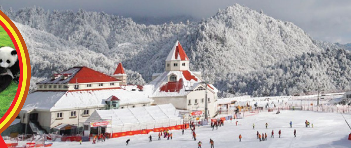
Xiling Snow Mountain 西岭雪山

行程次序，以当地旅社安排为准。 Sequences of Itinerary are subject to local arrangement.