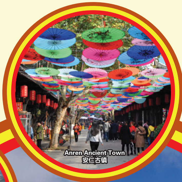
Anren Ancient Town 安仁古镇