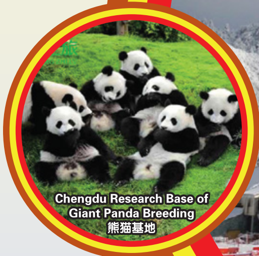
Chengdu Research Base of Giant Panda Breeding 熊猫基地