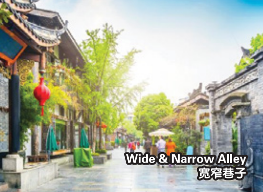
Wide & Narrow Alley 宽窄巷子