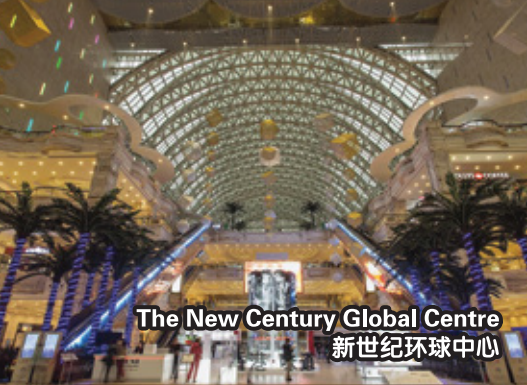
The New Century Global Centre 新世纪环球中心