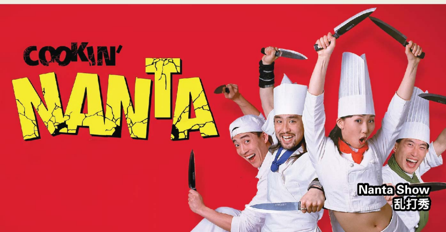
Nanta Show 乱打秀

Special Arrangement: ****Kimchi Pickled Course + Wearing Hanbok For Photo Shooting.