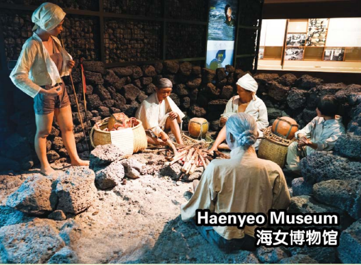
Haeyeo Museum 海女博物馆