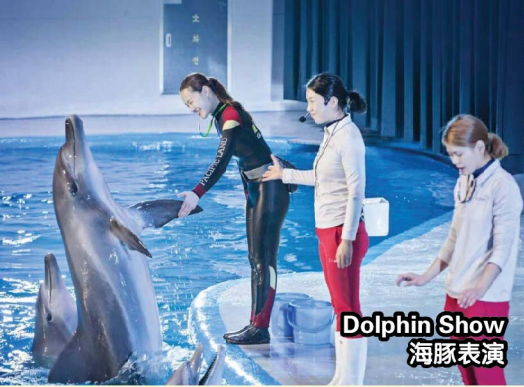
Dolphin Show 海豚表演