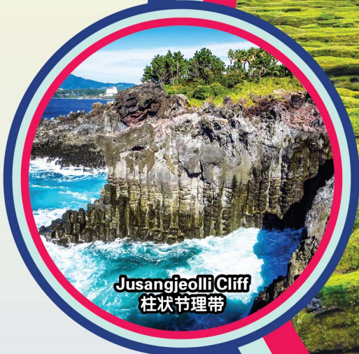
Jusangjeolli Cliff 柱状节理带

行程次序，以当地旅社安排为准。 Sequences of Itinerary are subject to local arrangement.