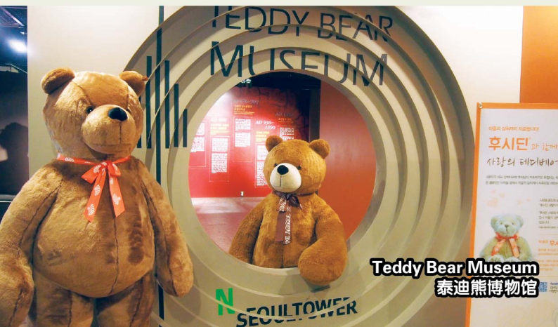
Teddy Bear Museum 泰迪熊博物馆