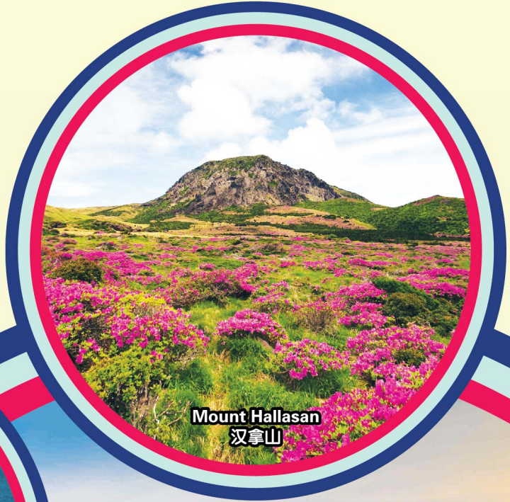
Mount Hallasan 汉拿山