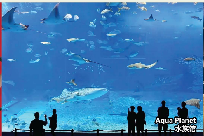
Aqua Planet 水族馆