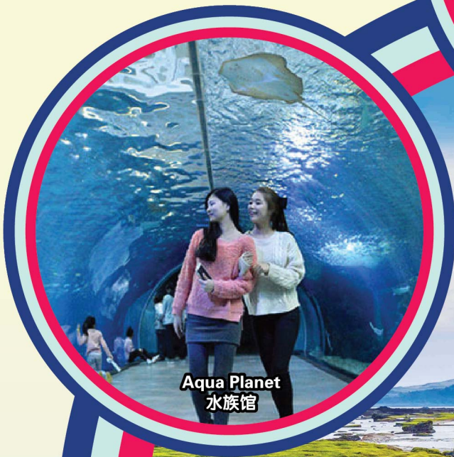
Aqua Planet 水族馆