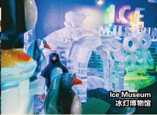
Ice Museum 冰灯博物馆