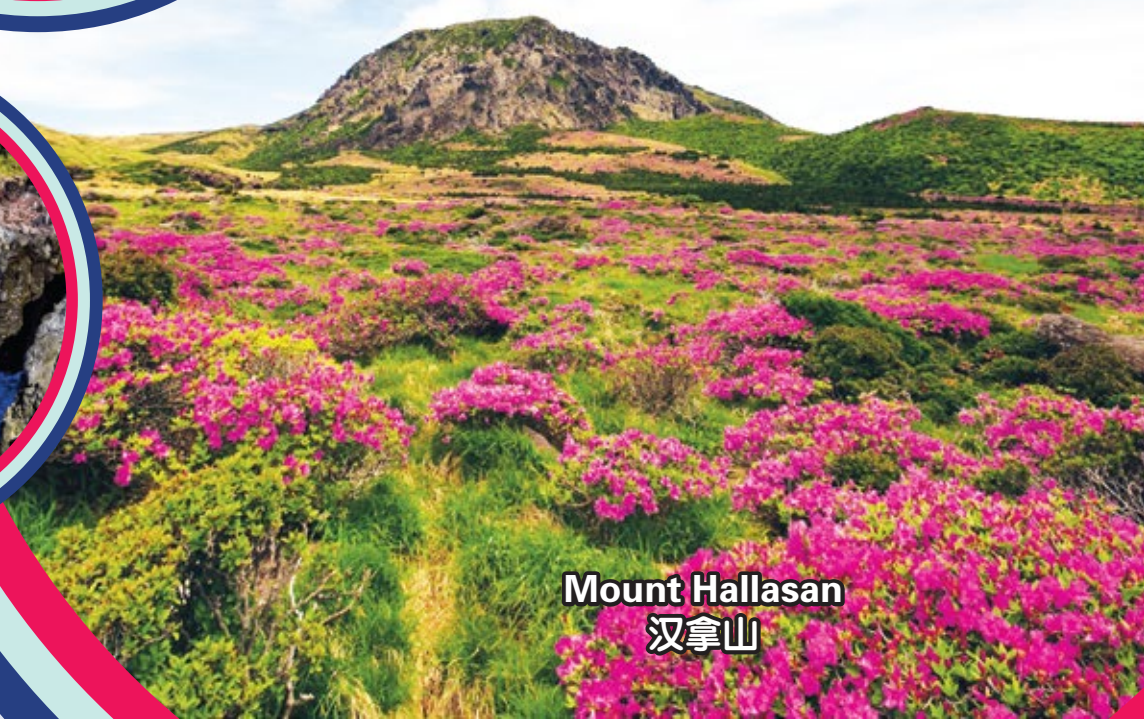
Mount Hallasan 汉拿山

行程次序，以当地旅社安排为准。 Sequences of Itinerary are subject to local arrangement.