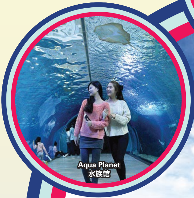
Aqua Planet 水族馆