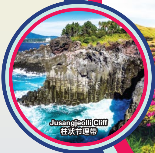
Jusangjeolli Cliff 柱状节理带