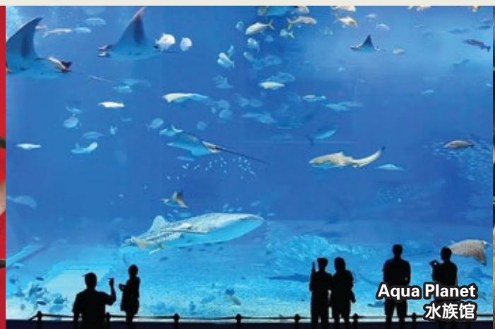
Aqua Planet 水族馆