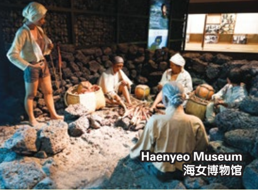
Haenyeo Museum 海女博物馆