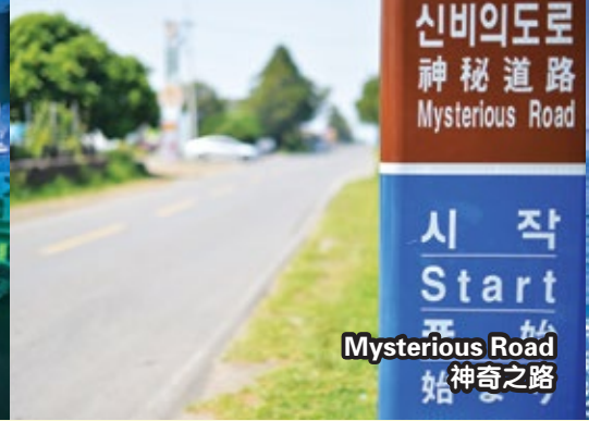
Mysterious Road 神奇之路