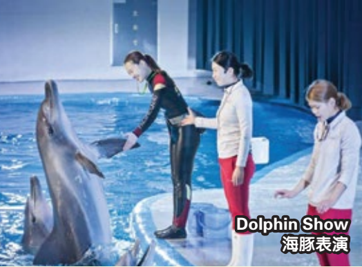
Dolphin Show 海豚表演