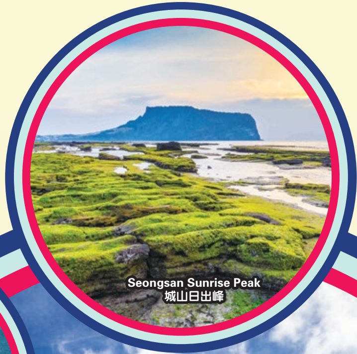
Seongsan Sunrise Peak 城山日出峰