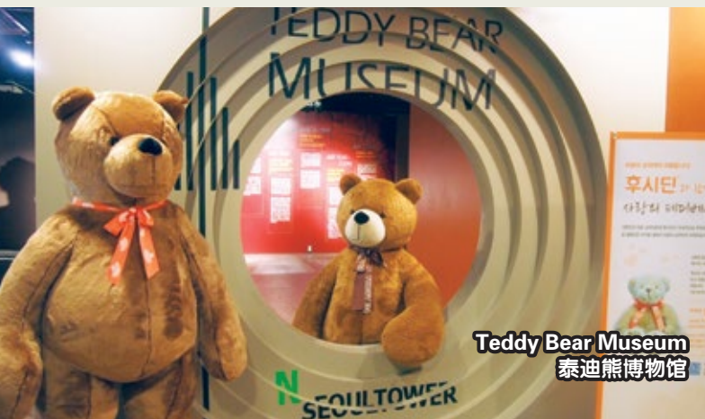
Teddy Bear Museum 泰迪熊博物馆