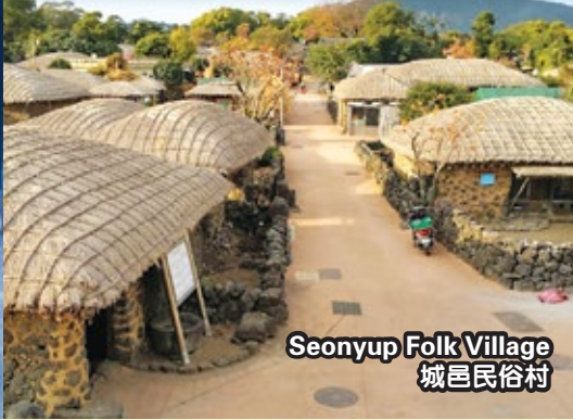
Seonyup Folk Village 城邑民俗村