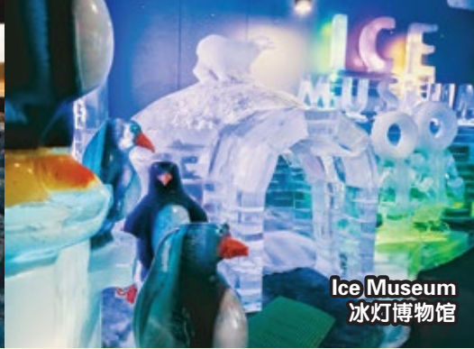
Ice Museum 冰灯博物馆