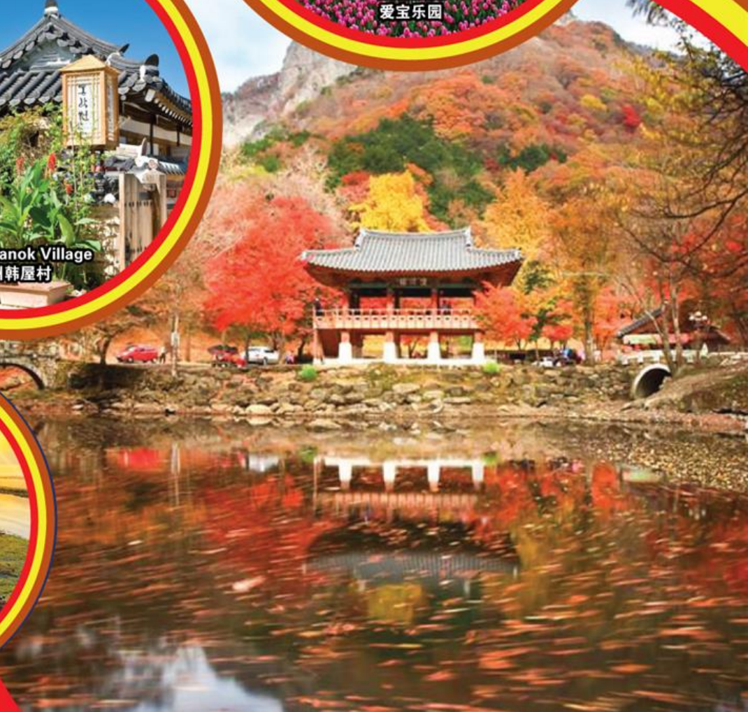
Naejongsan National Park 内藏山国立公园

行程次序·以当地旅社安排为准。 Sequences of Itinerary are subject to local arrangement.