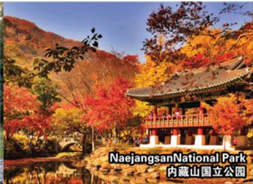
Naejongsan National Park 内藏山国立公园