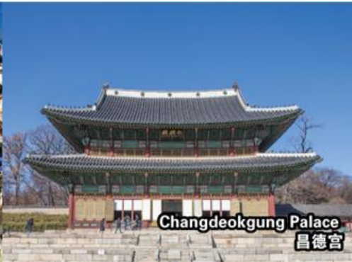
Changdeokgung Palace 昌德宫