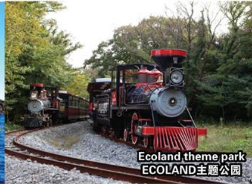
Ecoland theme park ECOLAND主题公园