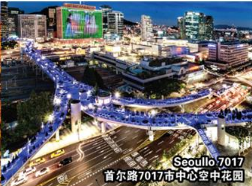
Seoullo 7017 首尔路7017市中心空中花园