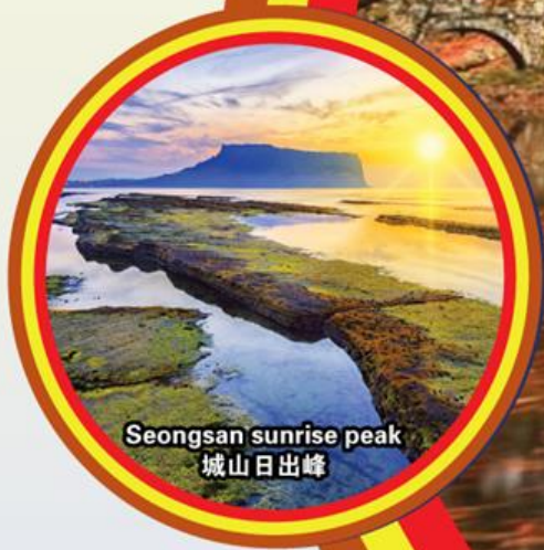
Seongsan sunrise peak 城山日出峰