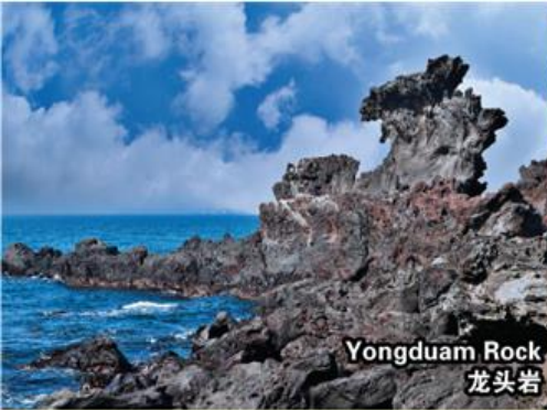
Yongduam Rock 龙头岩