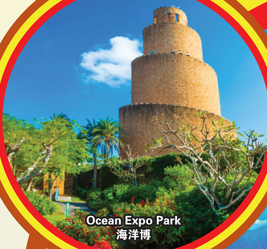
Ocean Expo Park 海洋博