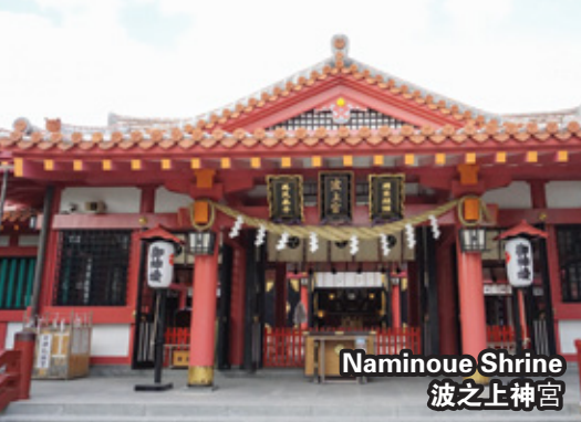
Naminoue Shrine 波之上神宮