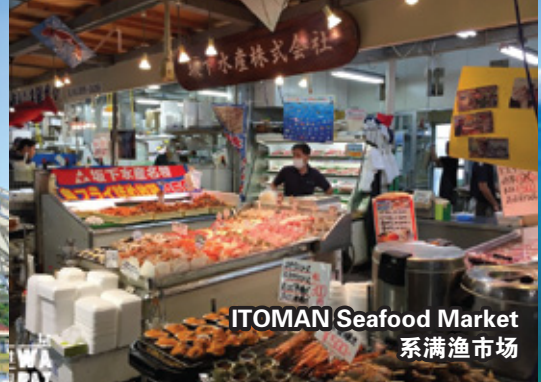
ITOMAN Seafood Market 糸満漁市場