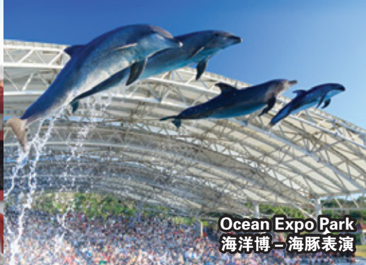
Ocean Expo Park 海洋博 - 海豚表演