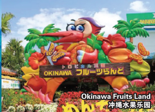
Okinawa Fruits Land 冲绳水果乐园