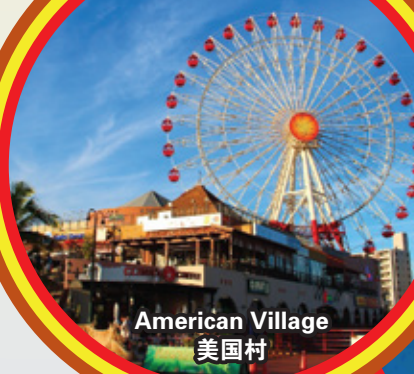
American Village 美国村