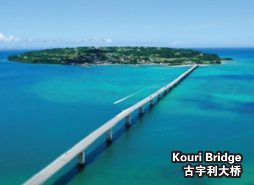
Kouri Bridge 古宇利大桥