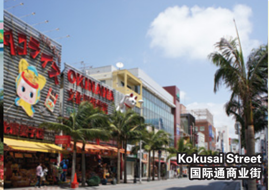
Kokusai Street 国际通商业街