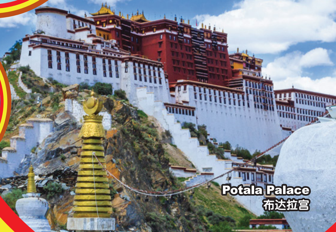
Potala Palace 布达拉宫

行程次序，以当地旅社安排为准。 Sequences of Itinerary are subject to local arrangement.