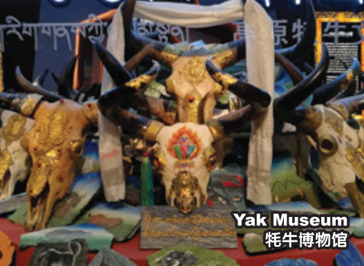
Yak Museum 牦牛博物馆