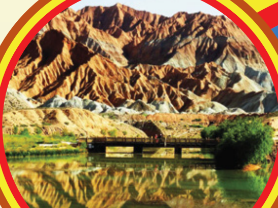
Guide National Geopark 贵德国家地质公园