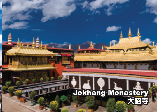
Jokhang Monastery 大昭寺