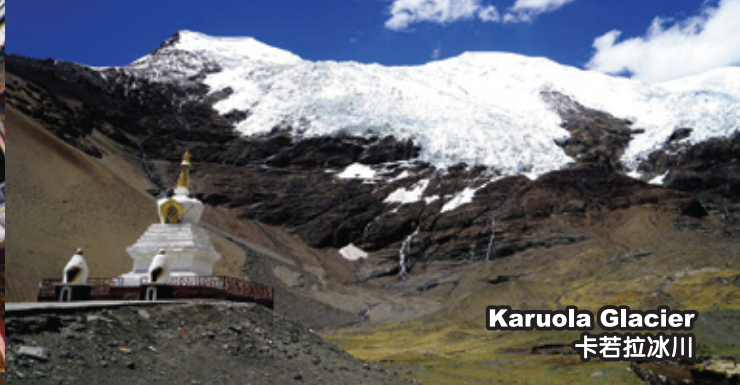
Karuola Glacier 卡若拉冰川