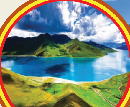
Yamdroktso Lake 羊卓雍措湖