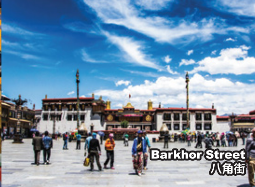
Barkhor Street 八角街