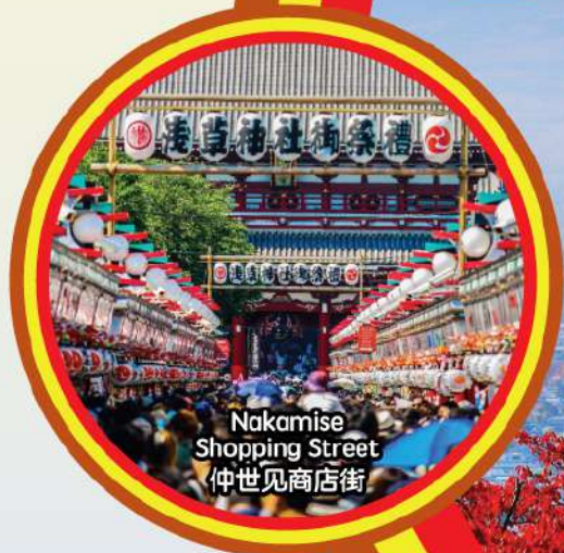
Nakamise Shopping Street 仲世见商店街

行程次序，以當地旅社安排為準。 Sequences of Itinerary are subject to local arrangement.