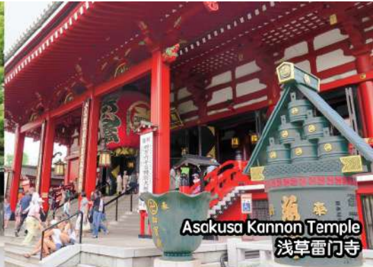
Asakusa Kannon Temple 浅草雷门寺