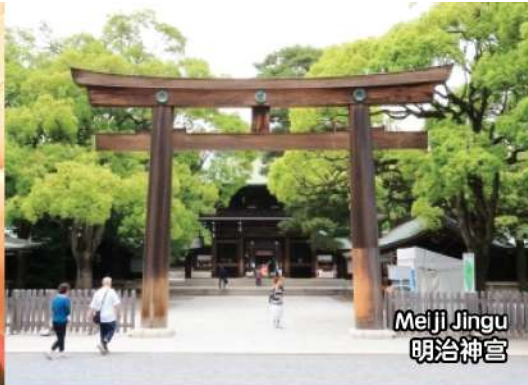
Meiji Jingu 明治神宮