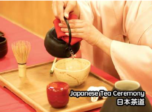
Japanese Tea Ceremony 日本茶道