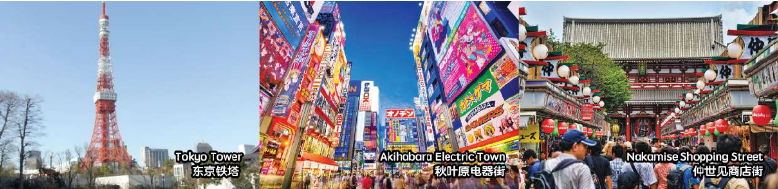
Tokyo Tower 东京铁塔