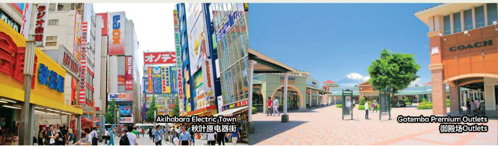
Akihabara Electric Town 秋叶原电器街