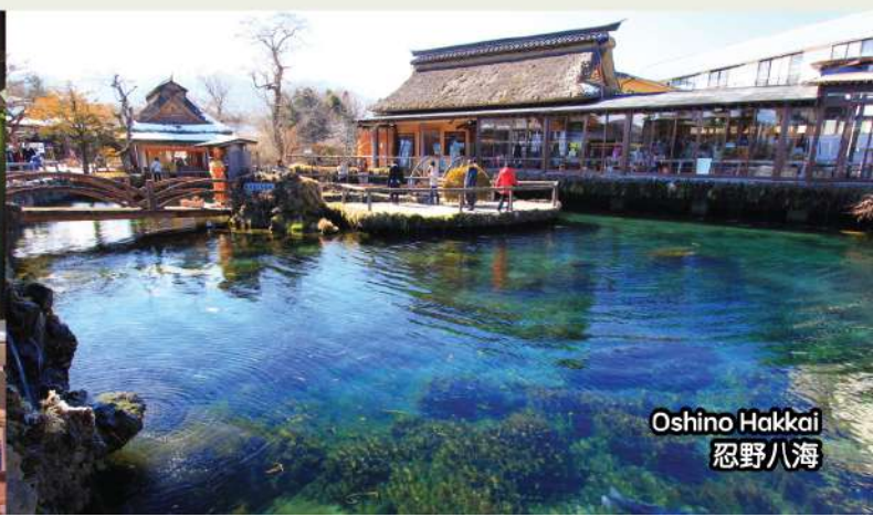
Oshino Hakkai 忍野八海