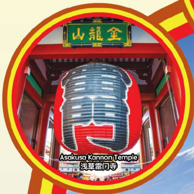
Asakusa Kannon Temple 浅草雷门寺