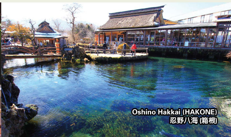
Oshino Hakkai (HAKONE) 忍野八海 (箱根)