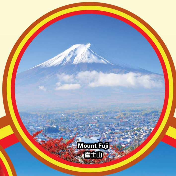
Mount Fuji 富士山