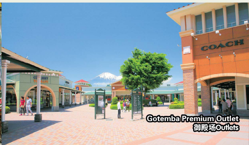
Gotemba Premium Outlet 御殿场Outlets