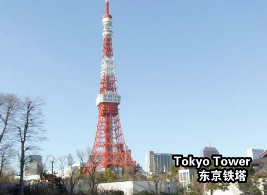
Tokyo Tower 東京铁塔