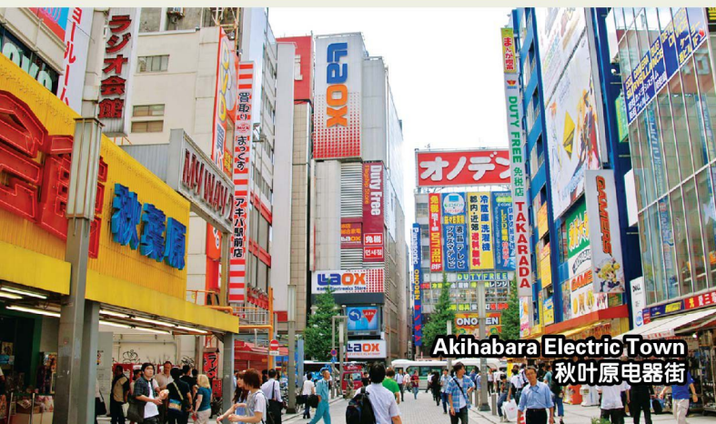
Akihabara Electric Town 秋叶原电器街