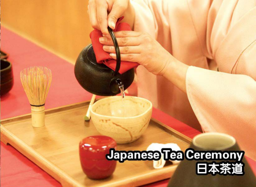
Japanese Tea Ceremony 日本茶道