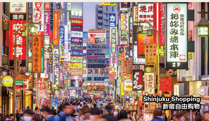
Shinjuku Shopping 新宿自由购物