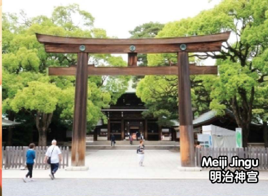
Meiji Jingu 明治神宮