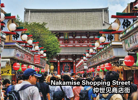
Nakamise Shopping Street 仲世见商店街