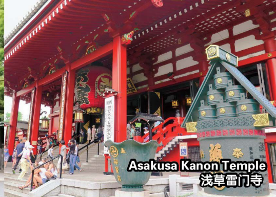
Asakusa Kannon Temple 浅草雷门寺