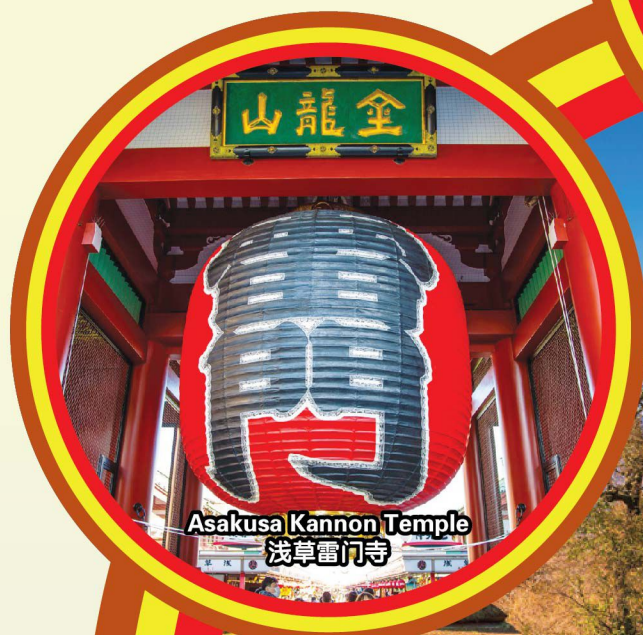
Asakusa Kannon Temple 浅草雷门寺