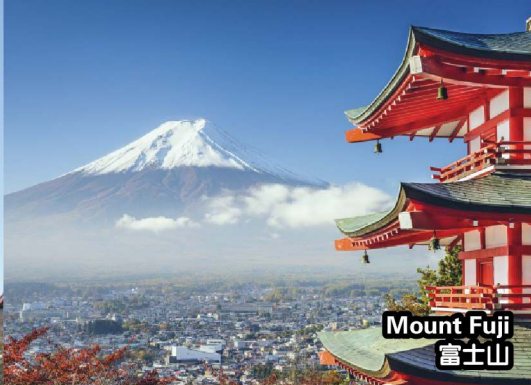
Mount Fuji 富士山