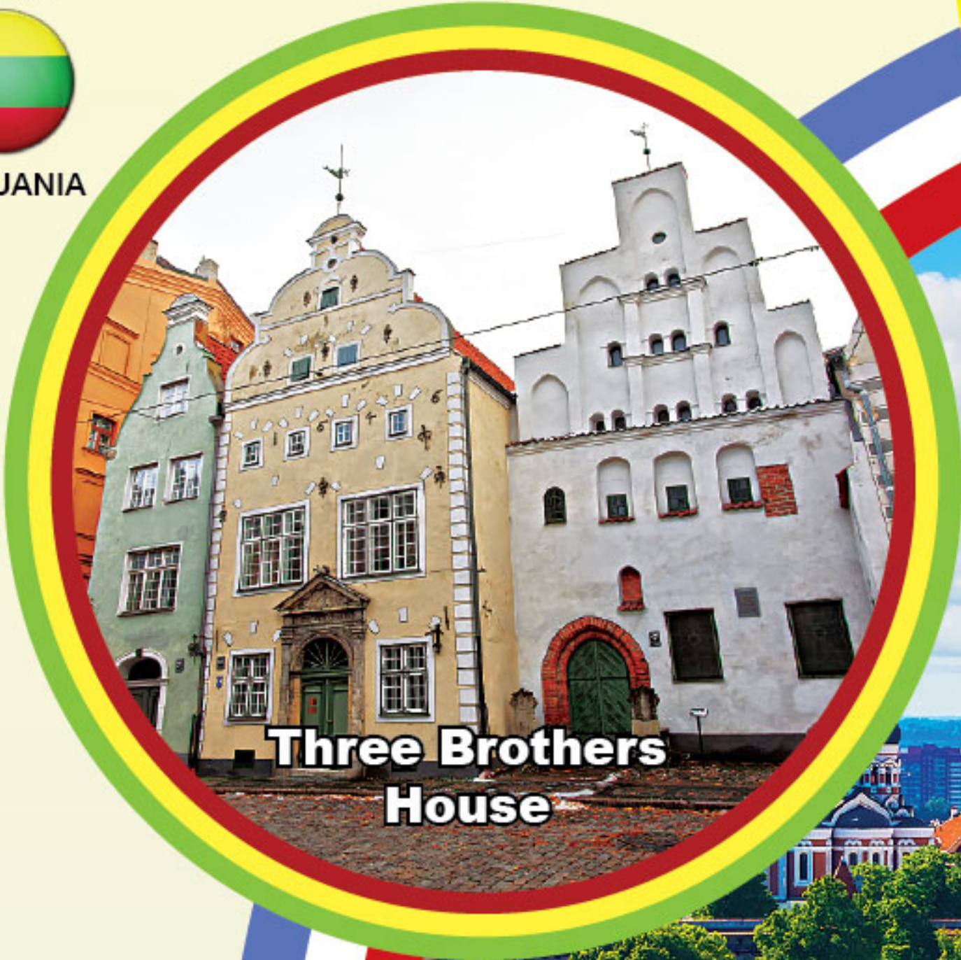
Three Brothers House