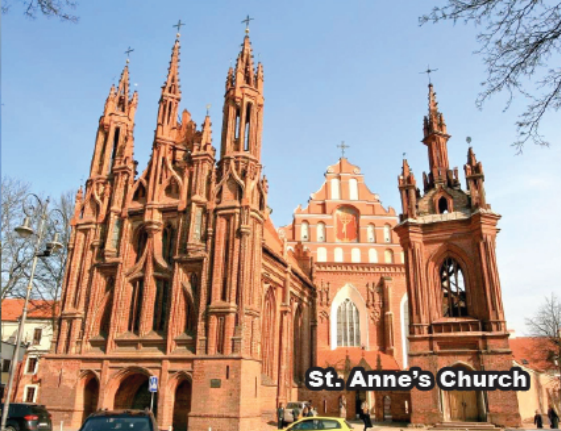
St. Anne's Church