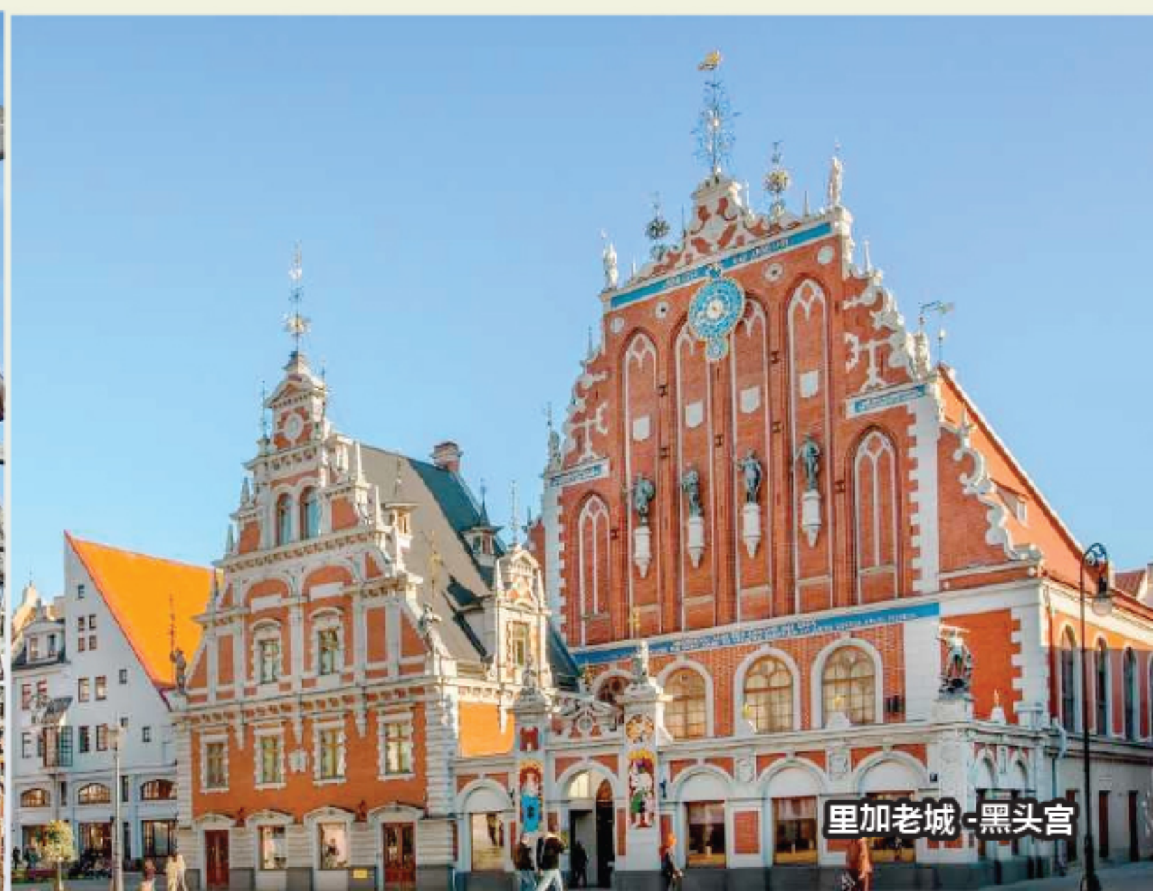
里加老城 - 黑头宫