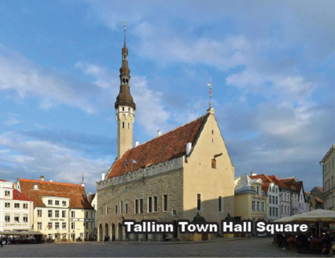
Tallinn Town Hall Square