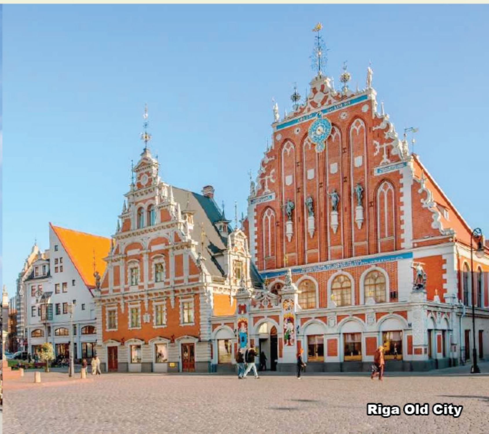
Riga Old City