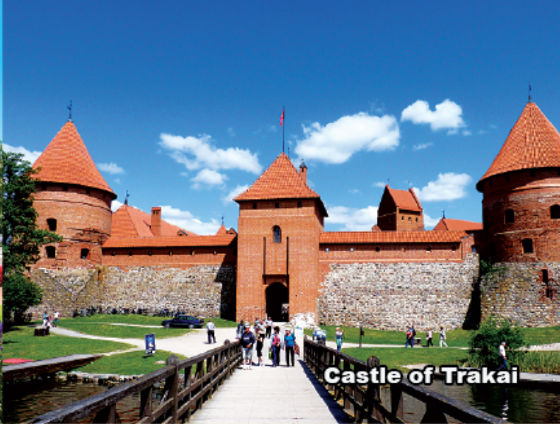
Castle of Trakai