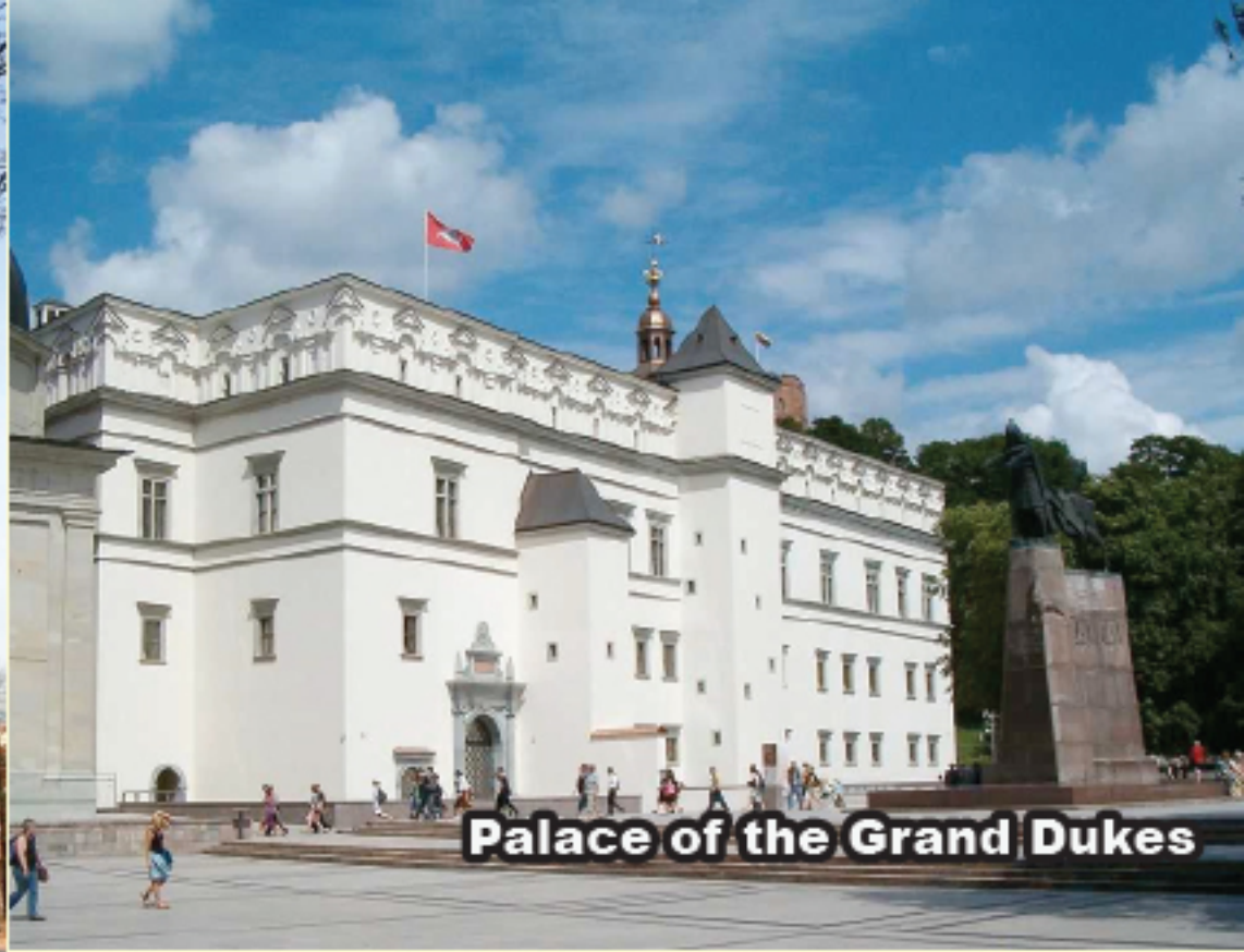
Palace of the Grand Dukes