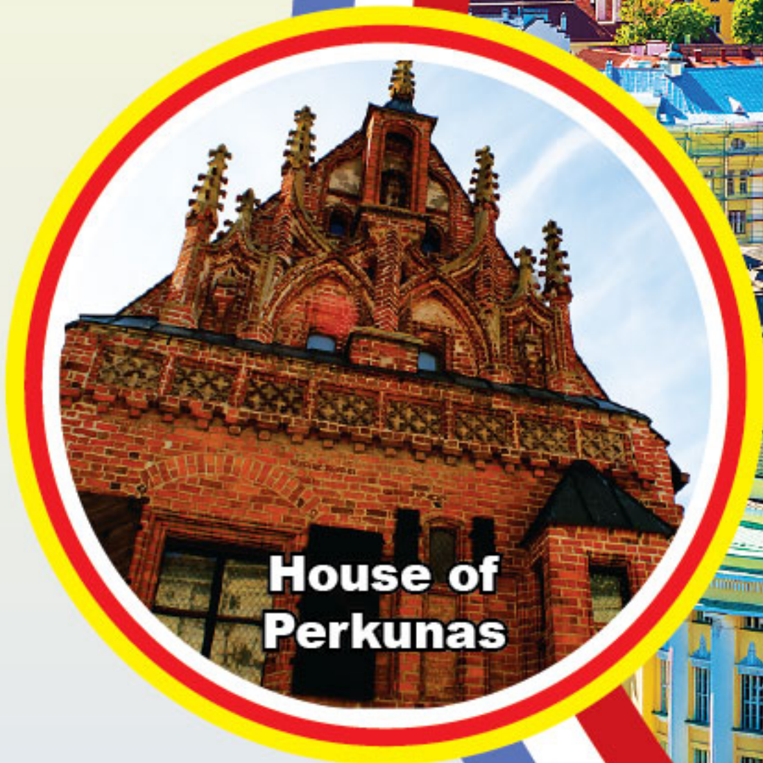
House of Perkunas