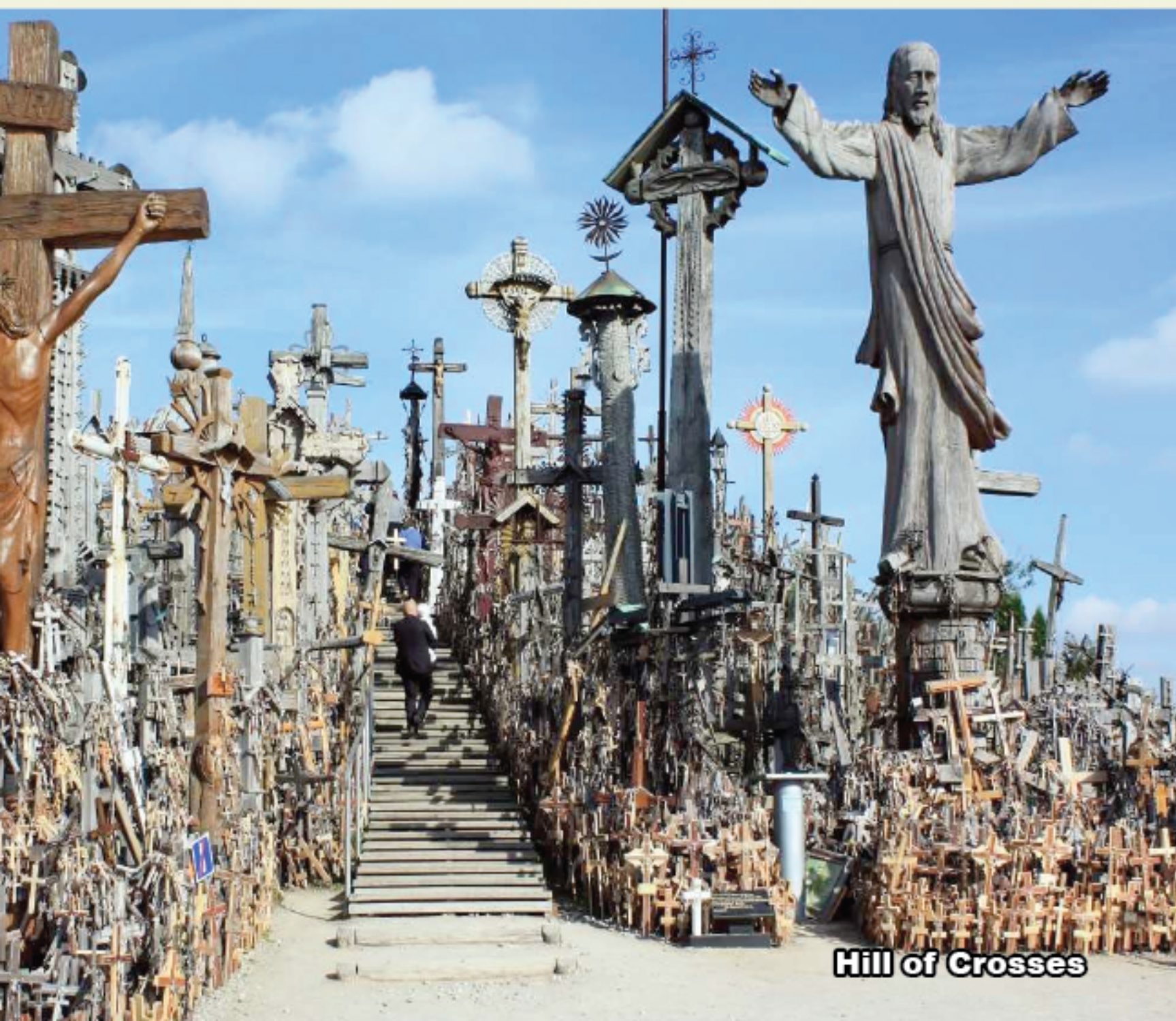
Hill of Crosses